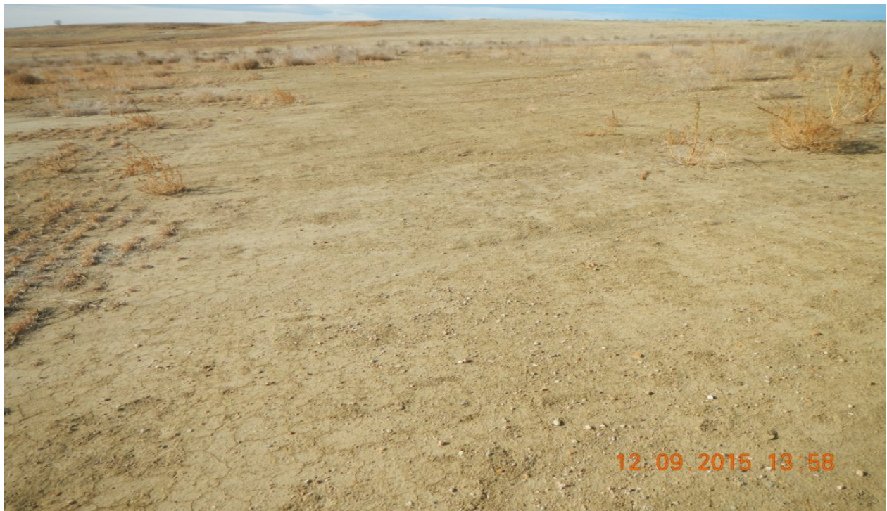
Photo 8: Facing northwest near the center of the location. There was no vegetation establishment at this area.