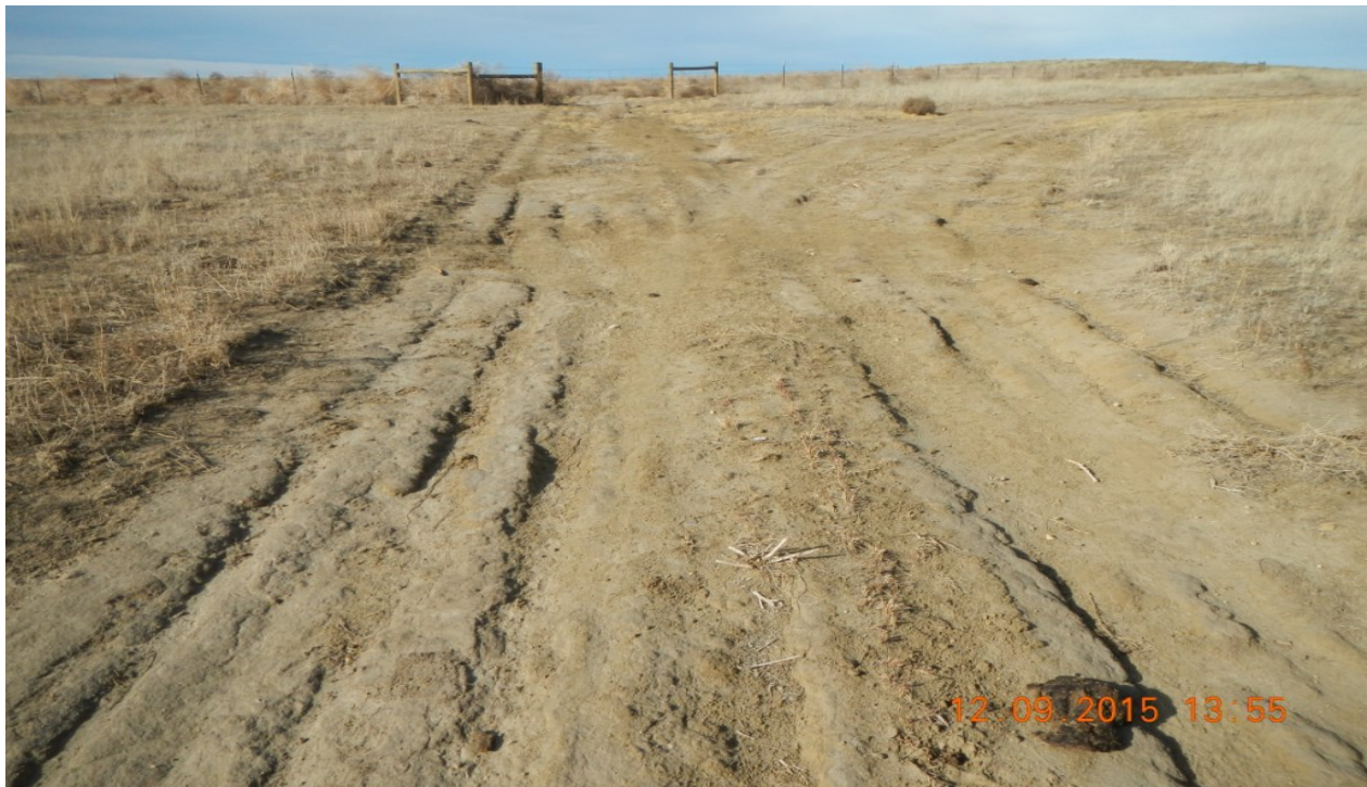
photo 4: Facing northwest towards the location. Erosion occurring where soils were ripped.