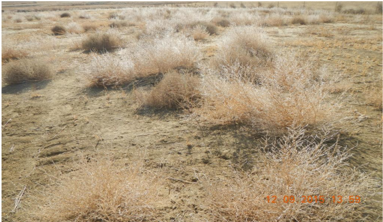
photo 13: Facing south east towards the west side of the location.