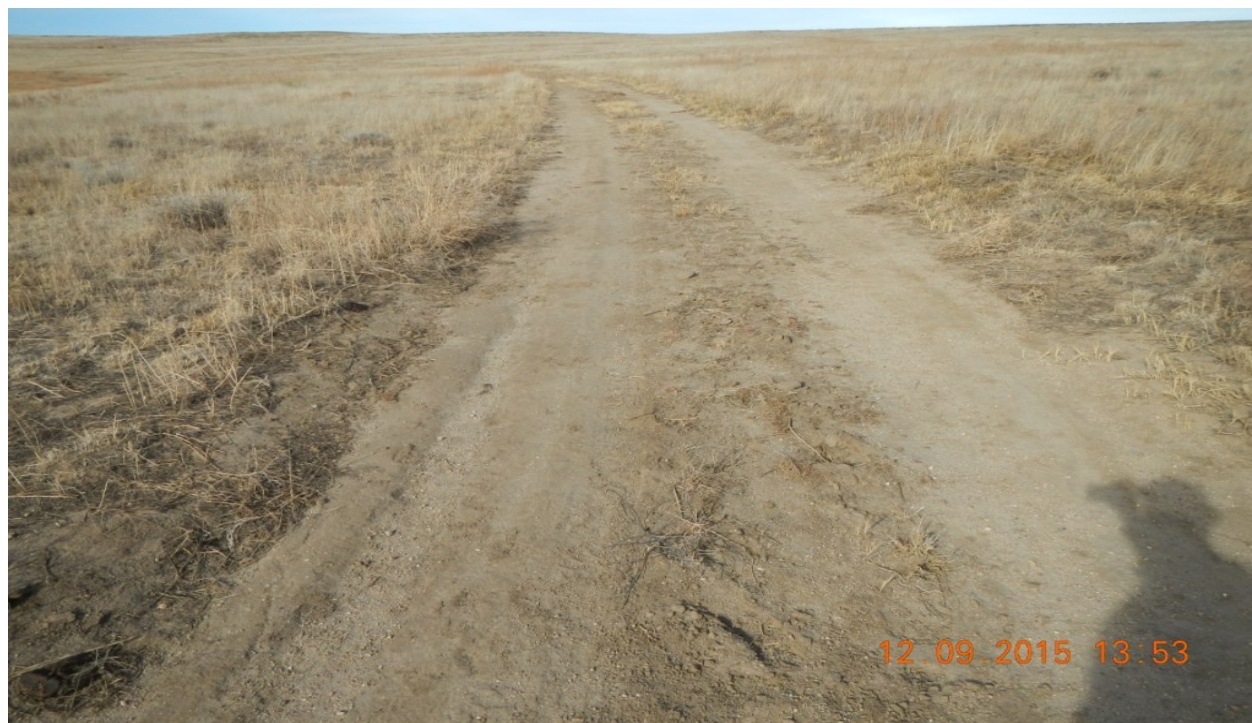
photo 2: Facing northwest along former access road towards the location.