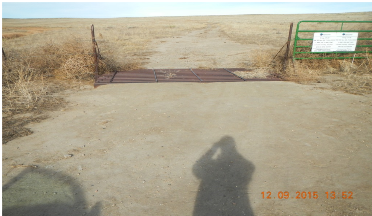
photo 1: Facing north along former access road towards the location.