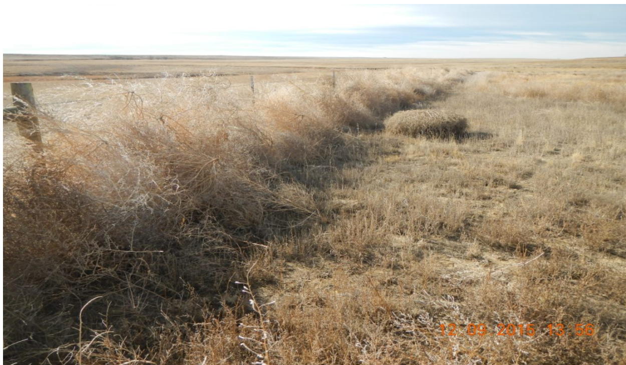
Photo 5: Southeast corner of location facing west. Weed debris is piling up along the fence line.