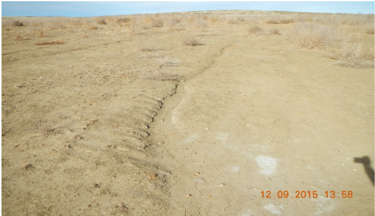
Photo 7: Erosion channel beginning to develop near the center of the location.