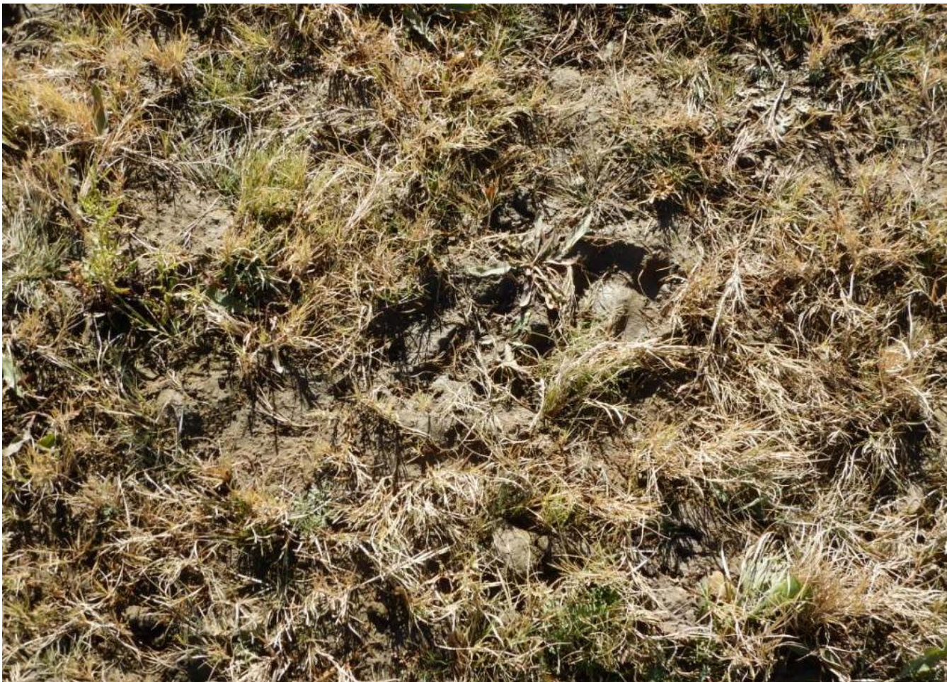
Photo 10. Reference area, facing straight down.