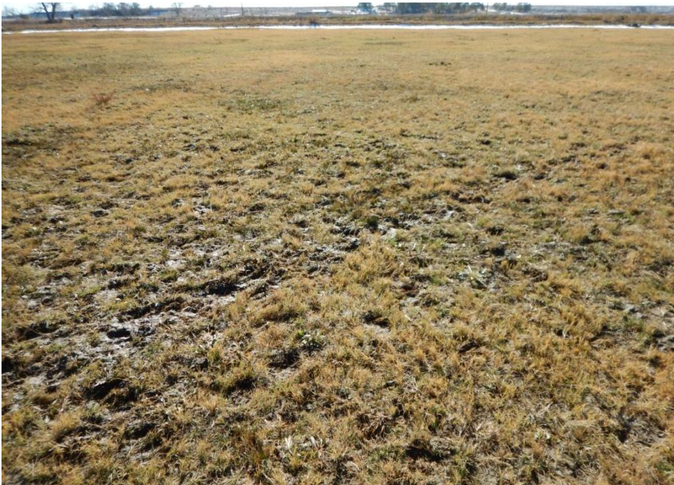
Photo 8. Reference area, facing North.