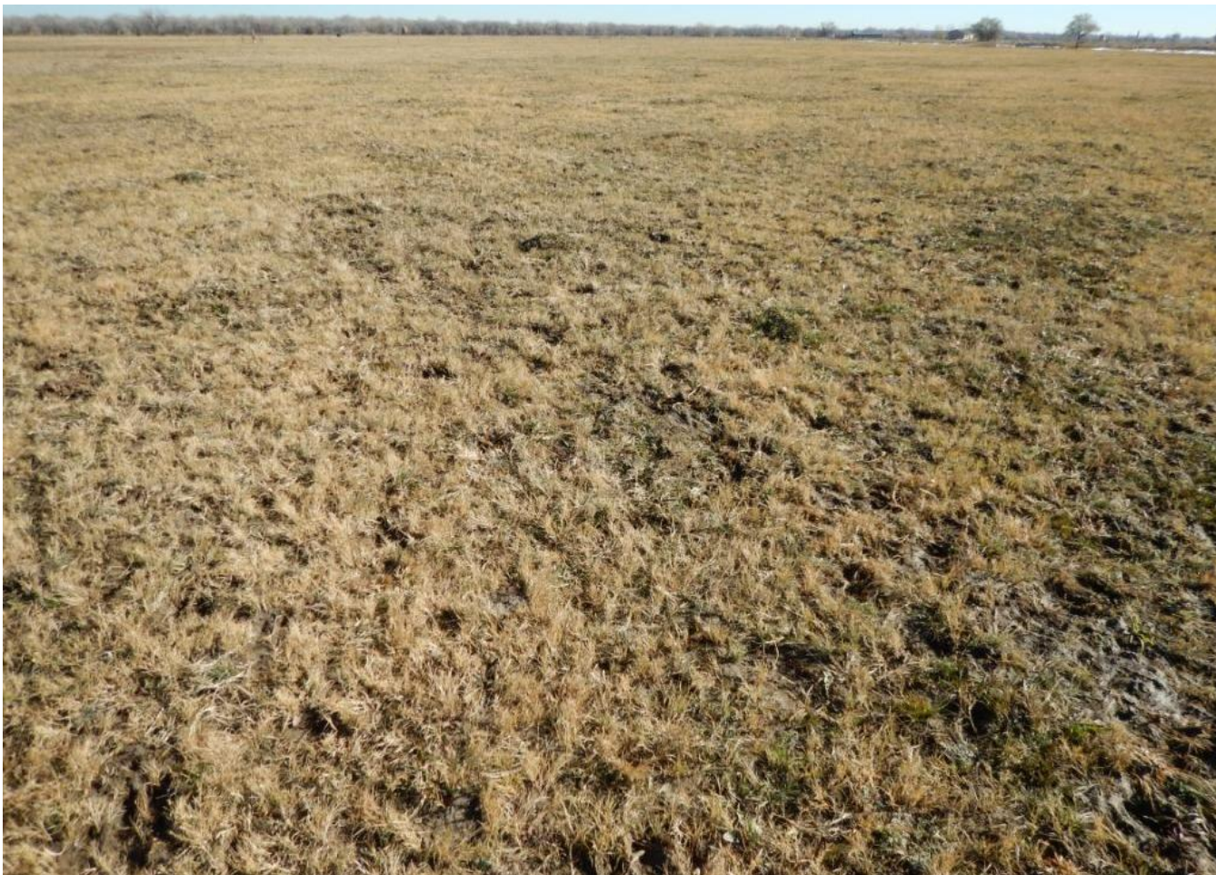
Photo 7. Reference area, facing East.