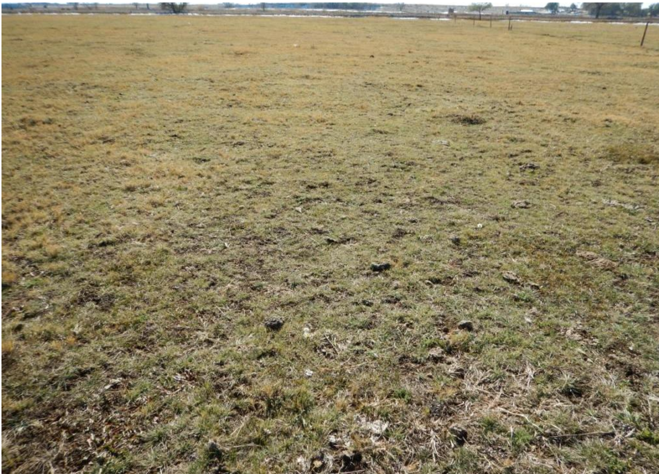
Photo 3. Photo taken from southern location, facing North. Location meets reclamation regulation standards. Final reclamation complete.