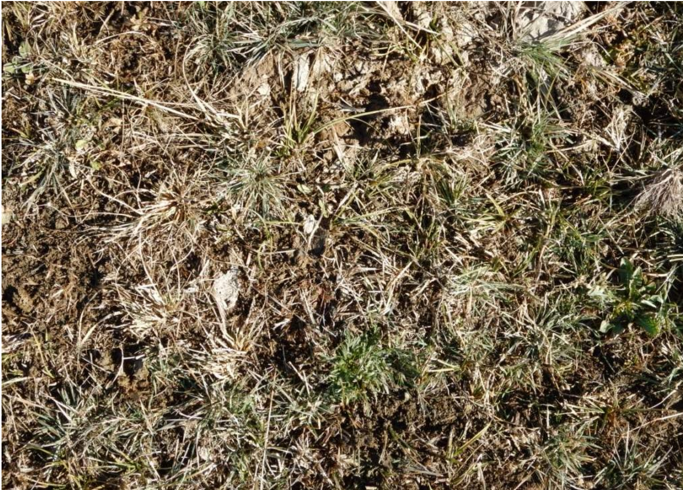
Photo 5. Photo taken from center of location, facing straight down. Location meets reclamation regulation standards. Final reclamation complete.