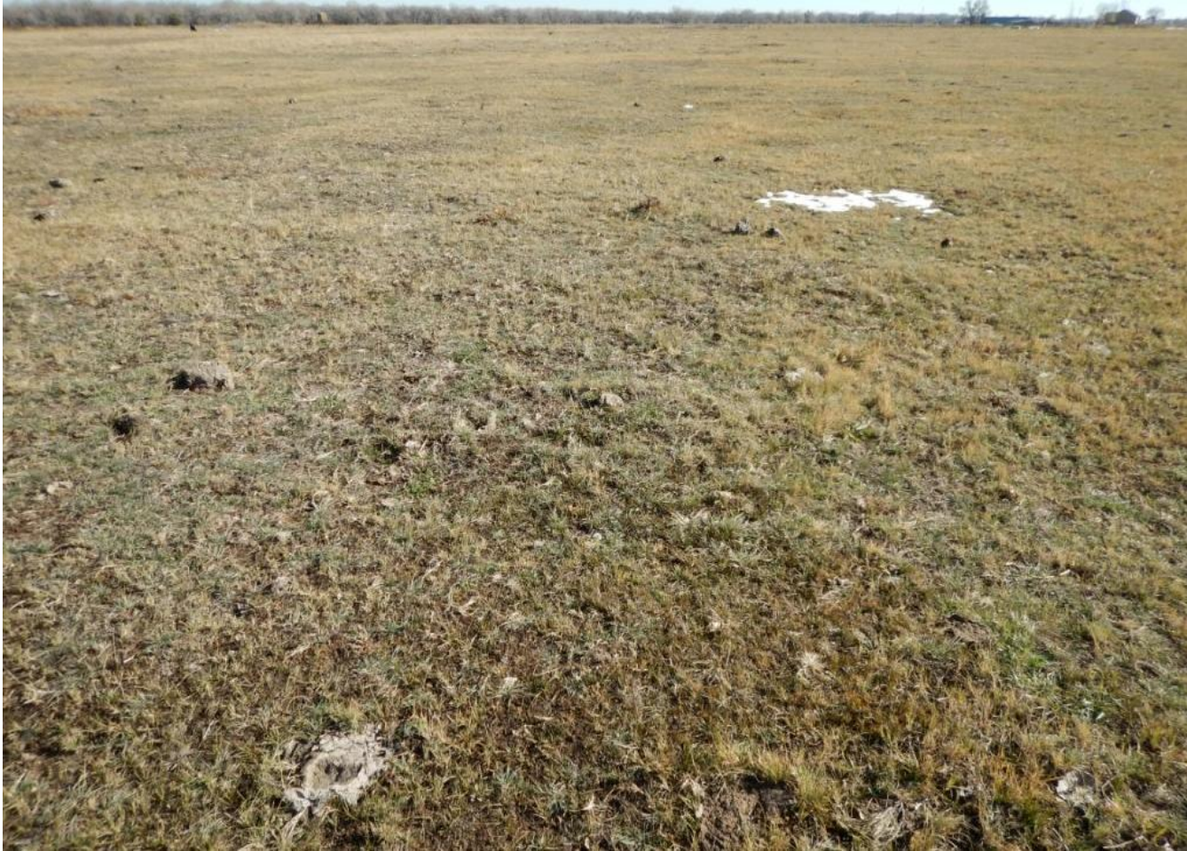
Photo 2. Photo taken from western location, facing East. Location meets reclamation regulation standards. Final reclamation complete.