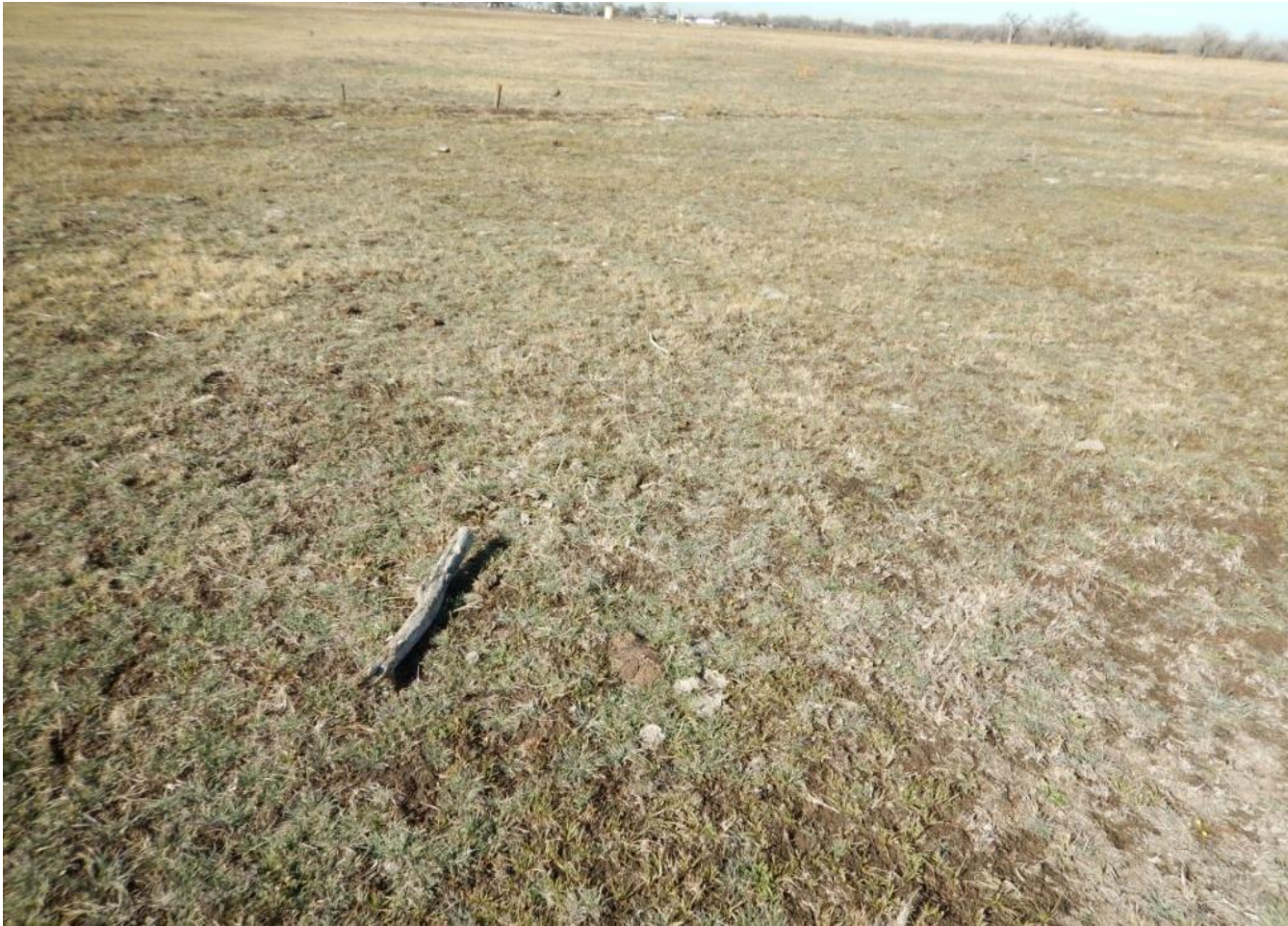
Photo 4. Photo taken from eastern location, facing West. Location meets reclamation regulation standards. Final reclamation complete.