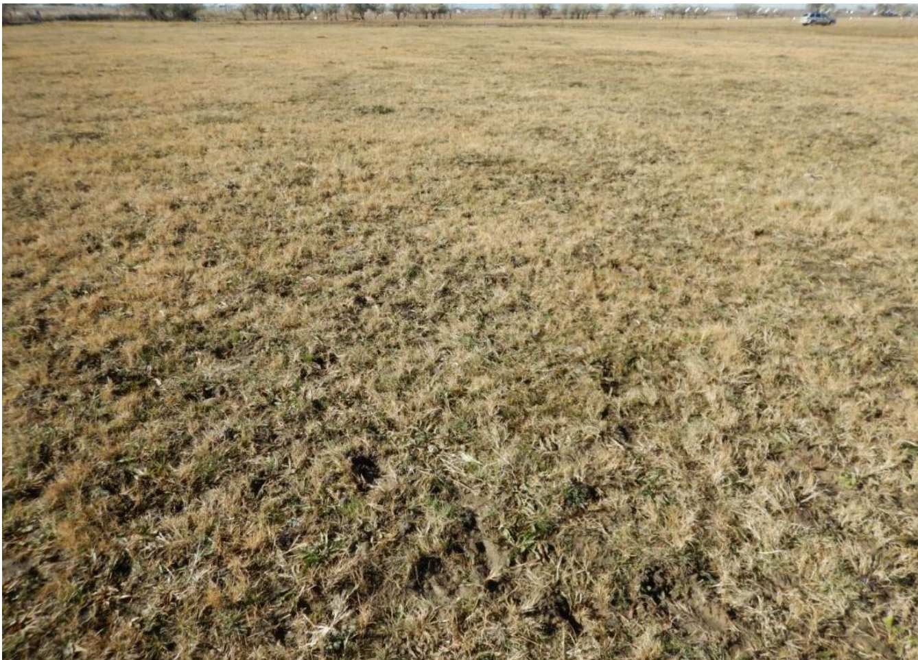
Photo 9. Reference area, facing West.