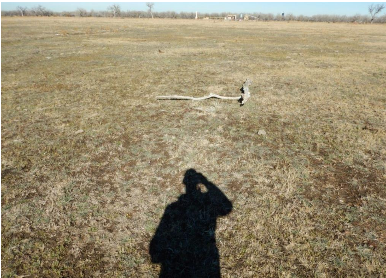
Photo 1. Photo taken from northern location, facing South. Location meets reclamation regulation standards. Final reclamation complete.