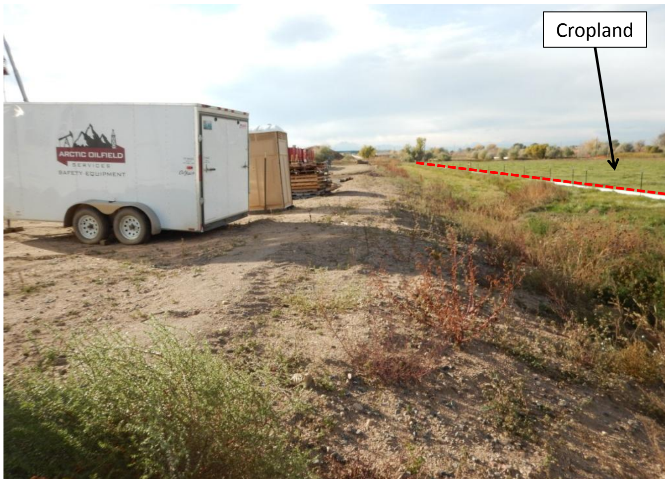
Photo 6. Photo taken from northeast location, facing West. Note the Kochia ( Kochia sp. ) and Russian thistle ( Salsola sp. ) in the photo. Weed maintenance is needed to prevent invasion of undesirable species and noxious weeds upon adjacent lands.