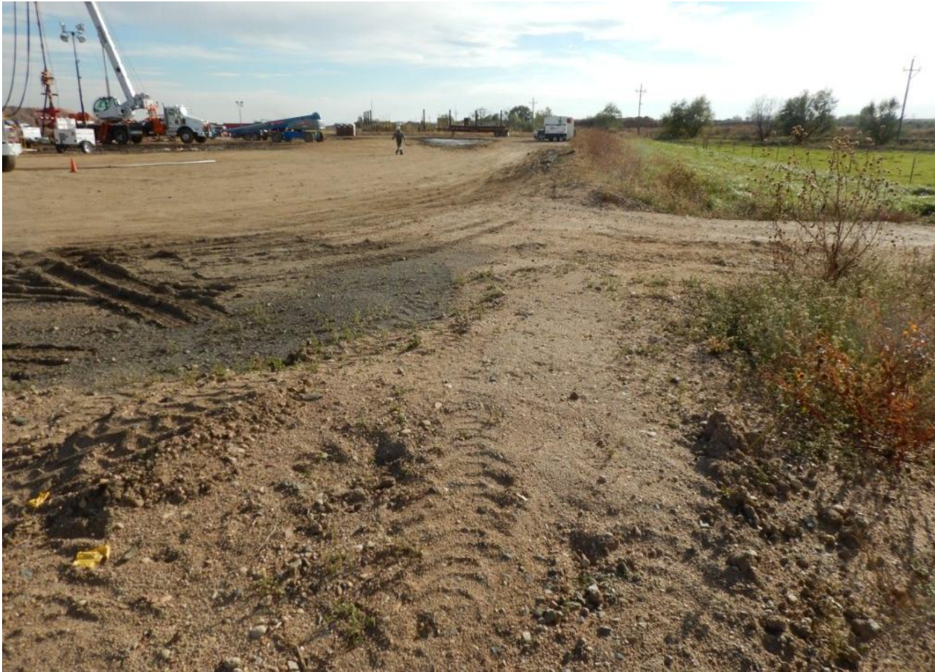
Photo 8. Photo taken from northeast location, facing West. Note the Kochia ( Kochia sp.) and Russian thistle ( Salsola sp.) in the photo. Weed maintenance is needed.