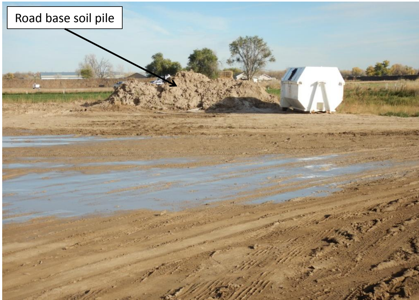
Photo 9. Photo taken from central location, facing Southeast. Road base soil pile needs to be removed after drilling completion.