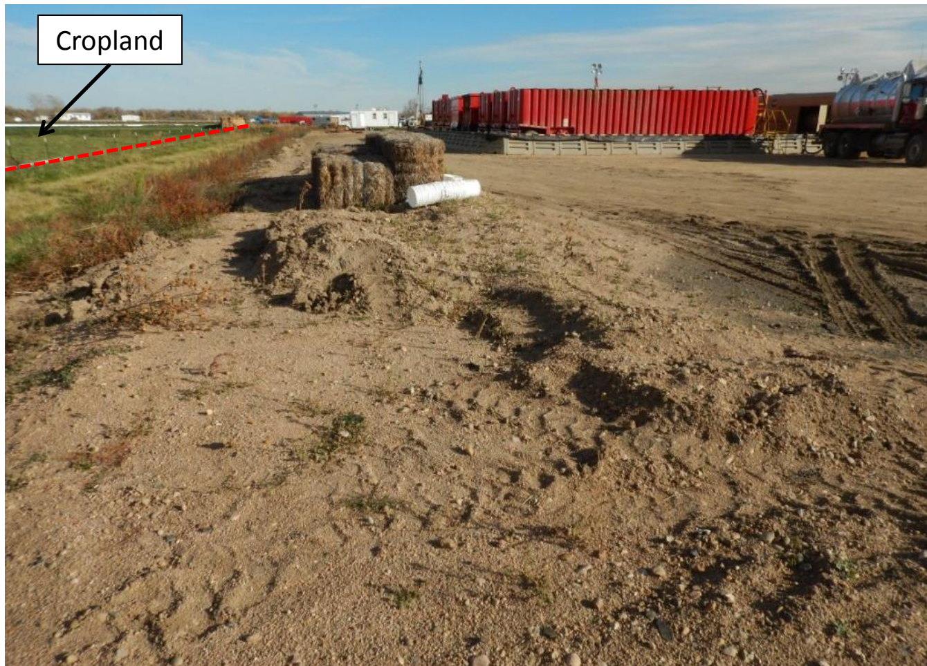
Photo 7. Photo taken from northeast location, facing West. Note the Kochia ( Kochia sp. ) and Russian thistle ( Salsola sp. ) in the photo. Weed maintenance is needed to prevent invasion of undesirable species and noxious weeds upon adjacent lands.