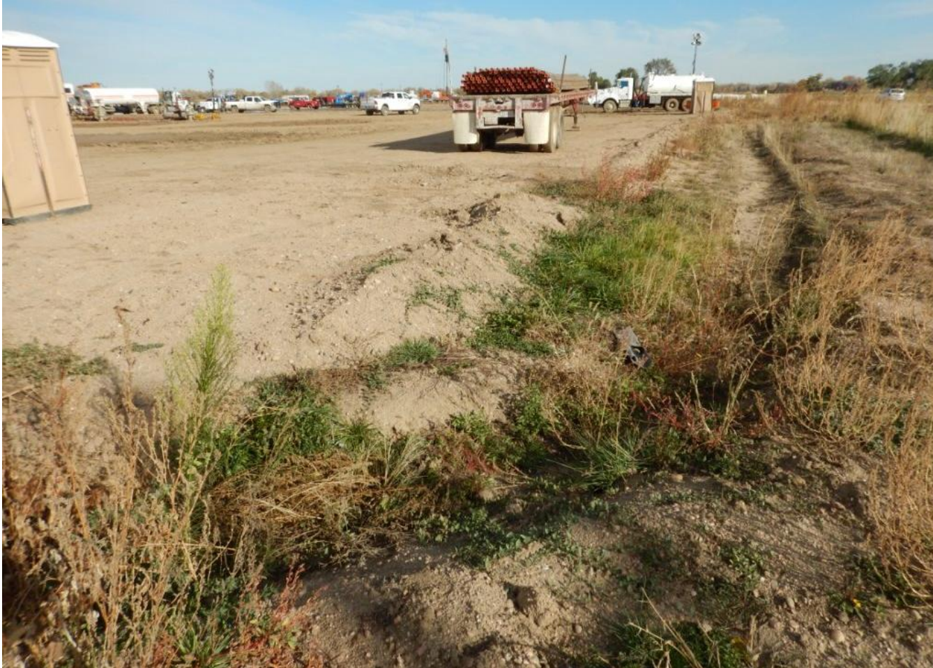
Photo 1. Photo taken from southwest location, facing East. Note the Kochia ( Kochia sp. ) and Russian thistle ( Salsola sp. ) in the photo. This is weed debris and will break off and encroach upon adjacent lands. When interim reclamation starts, this area shall be reclaimed and minimized where production or facilities are no longer necessary.