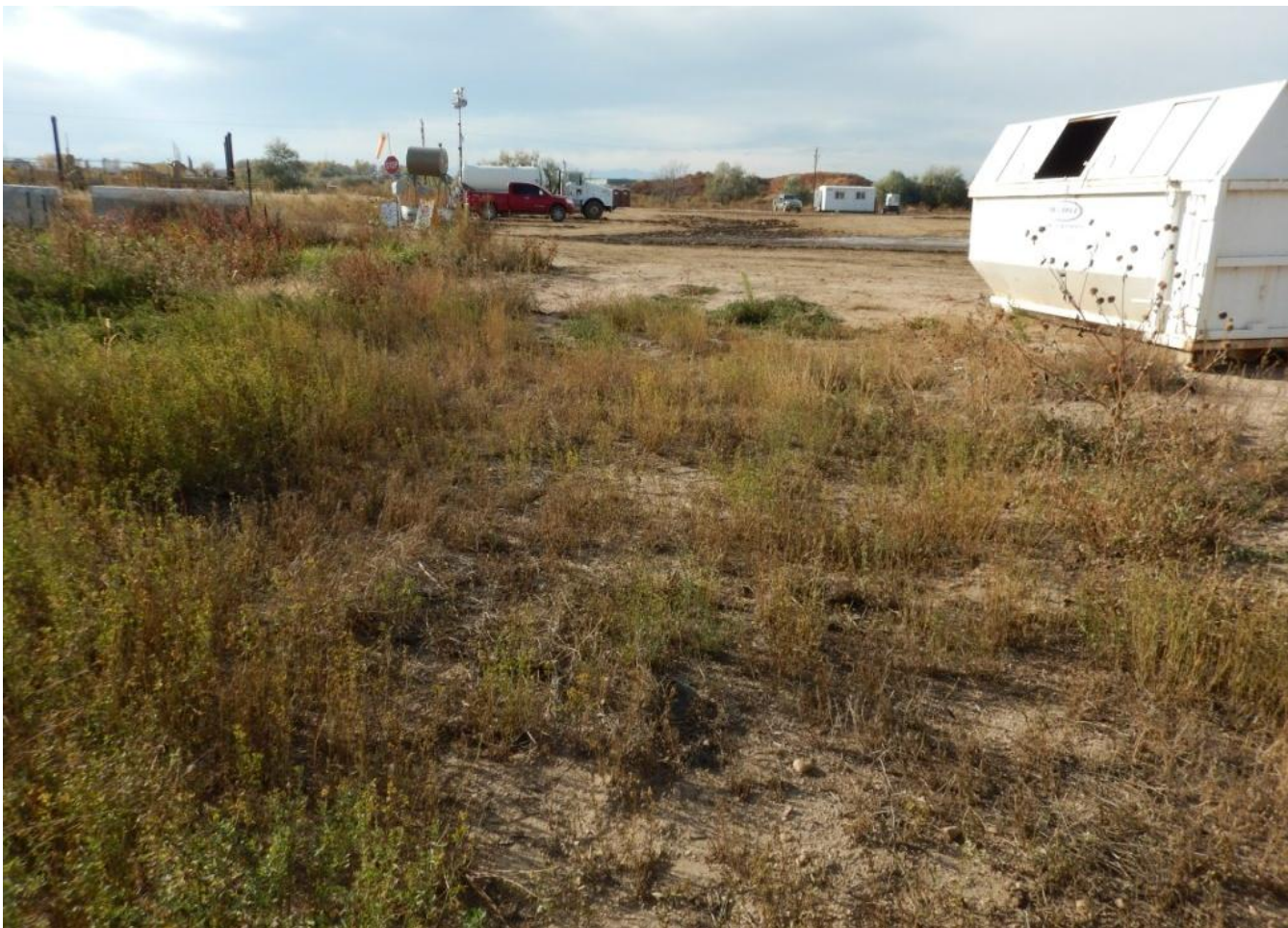
Photo 3. Photo taken from southeast location, facing West. Note the Kochia ( Kochia sp. ), Russian thistle ( Salsola sp. ) and Canada thistle ( Cirsium arvense ) in the photo. Weed maintenance is needed.