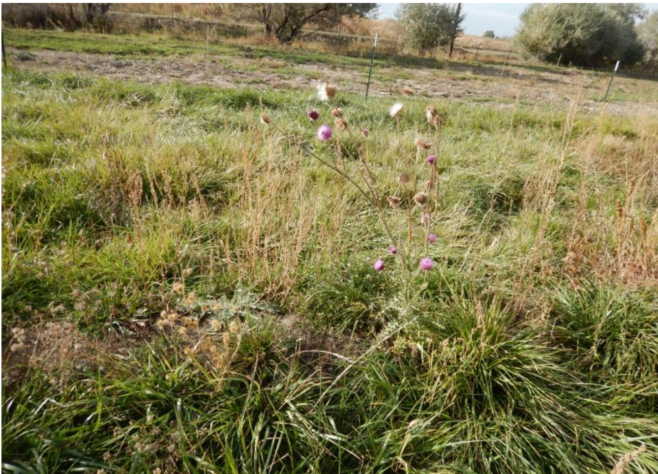
Photo 11. Musk thistle ( Carduus nutans ) observed throughout location. Weed maintenance is needed to prevent invasion of undesirable species and noxious weeds upon adjacent lands.