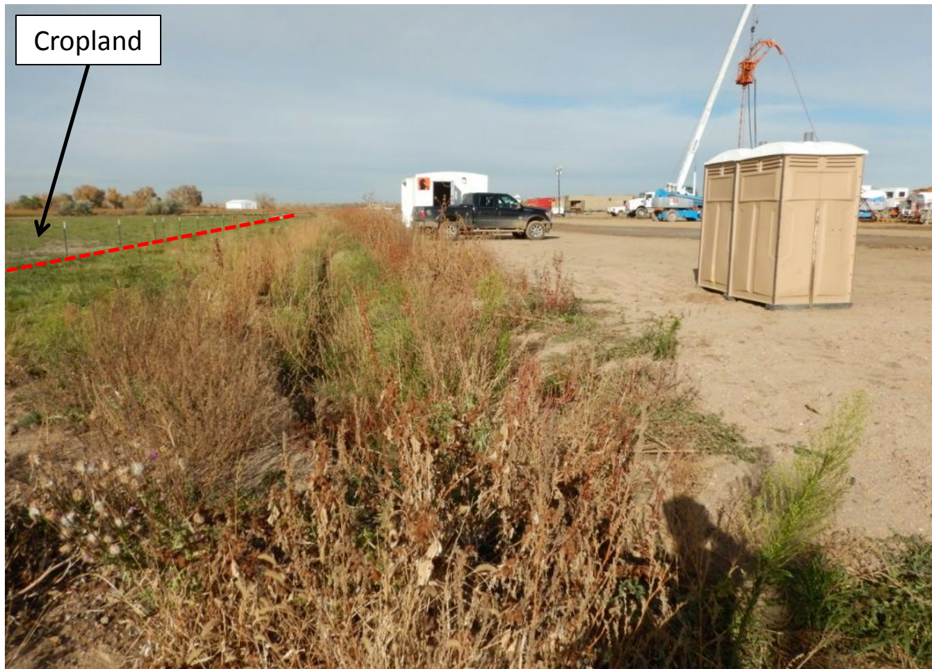
Photo 2. Photo taken from southwest location, facing North. Note the Kochia ( Kochia sp. ), Russian thistle ( Salsola sp. ) and Canada thistle ( Cirsium arvense ) in the photo. Weed maintenance is needed to prevent invasion of undesirable species and noxious weeds upon adjacent lands.