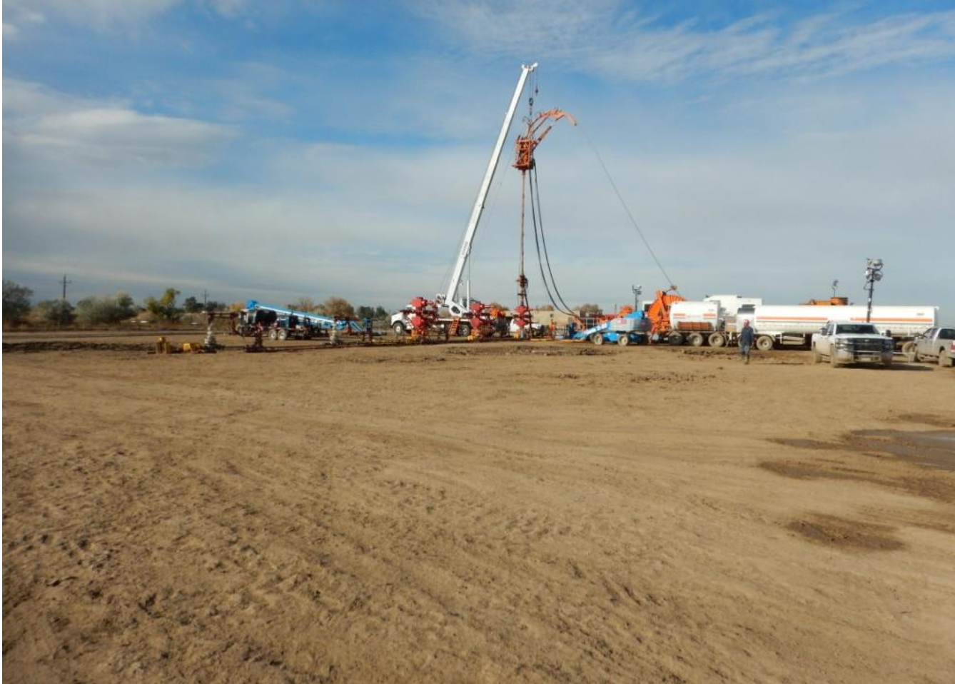
Photo 10. Photo taken from south entrance, facing North. When interim reclamation starts, this area shall be reclaimed and minimized where production or facilities are no longer necessary.