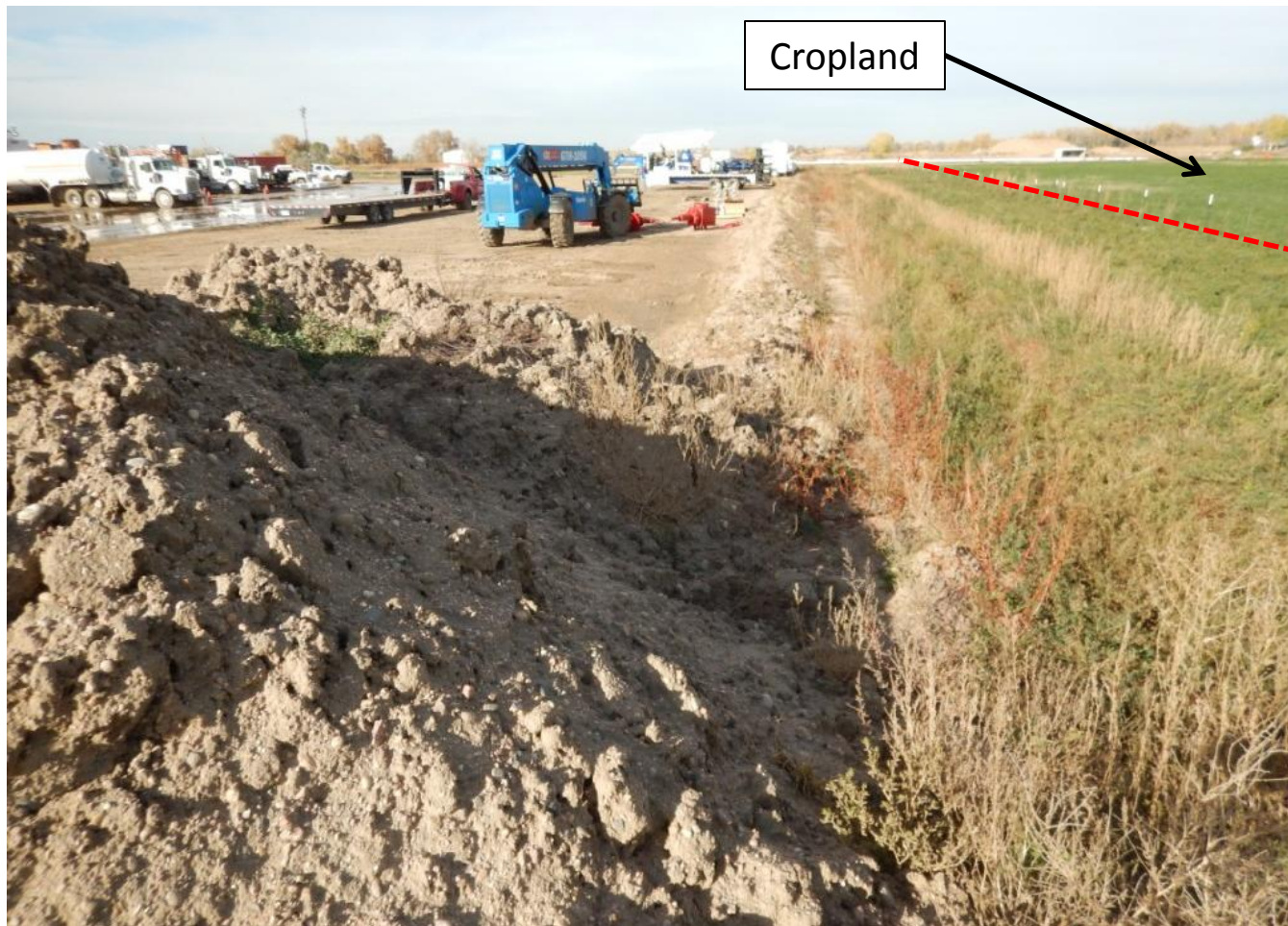
Photo 4. Photo taken from southeast location, facing West. Note the Kochia ( Kochia sp. ), Russian thistle ( Salsola sp. ) and Canada thistle ( Cirsium arvense ) in the photo. Weed maintenance is needed to prevent invasion of undesirable species and noxious weeds upon adjacent lands.