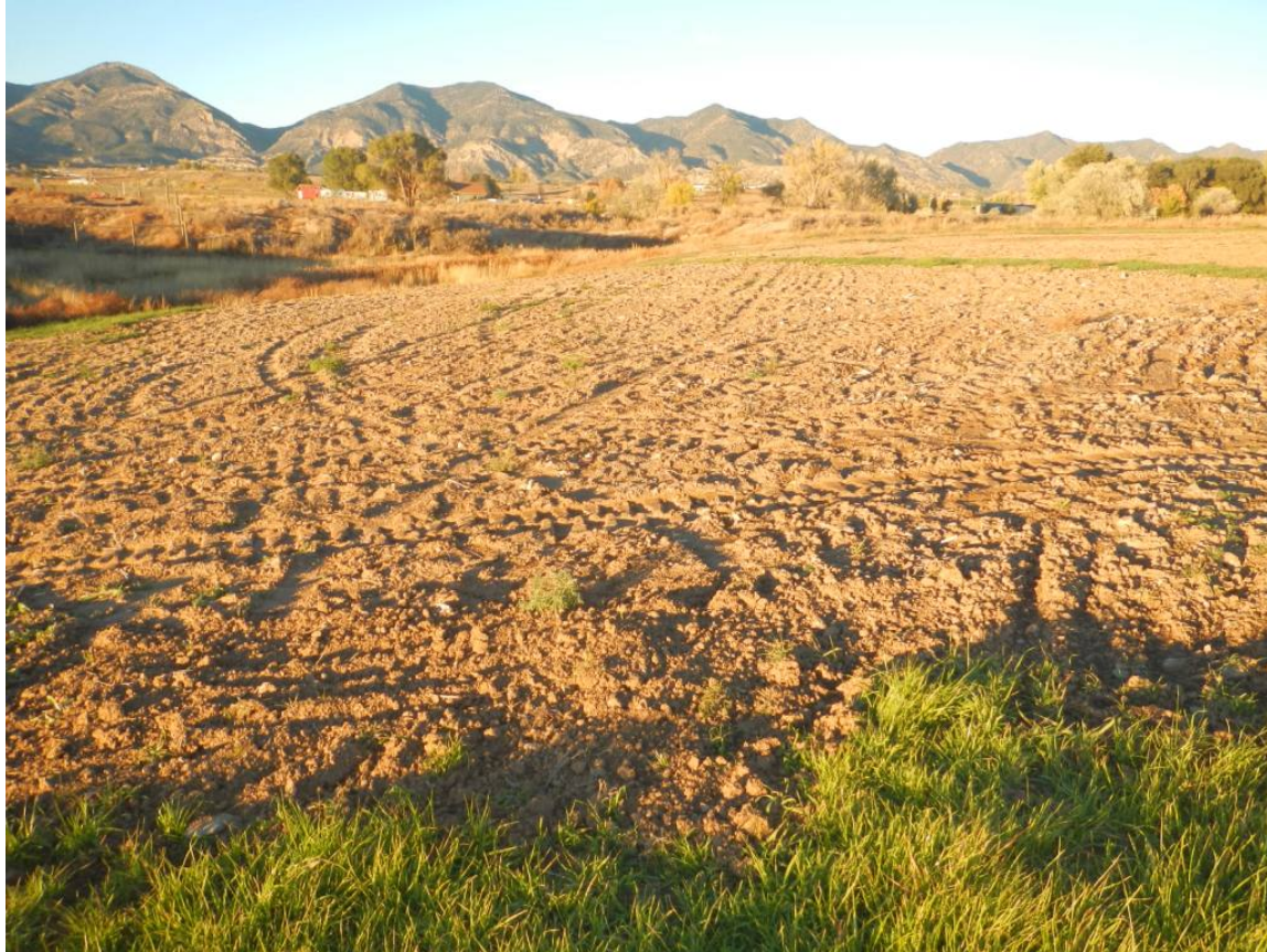
Photo#3: End of Irrigated Field surrounding Location on NE border.