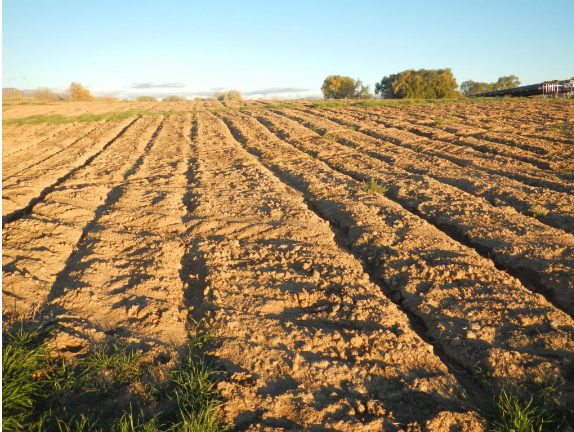
Photo#1: Irrigation furrows for Gated Pipe system running from East to West where they meet edge of Location