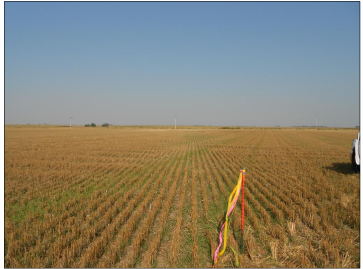
LOOKING EAST AUGUST 24, 2015