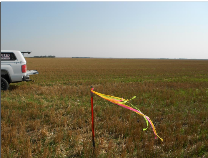
LOOKING SOUTH AUGUST 24, 2015