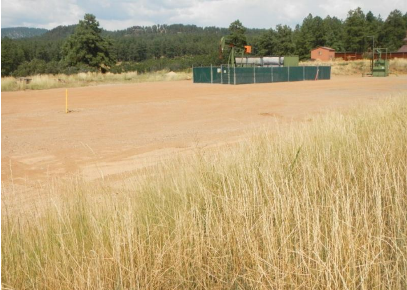
Photo 5. View of project area from southwestern corner facing center.