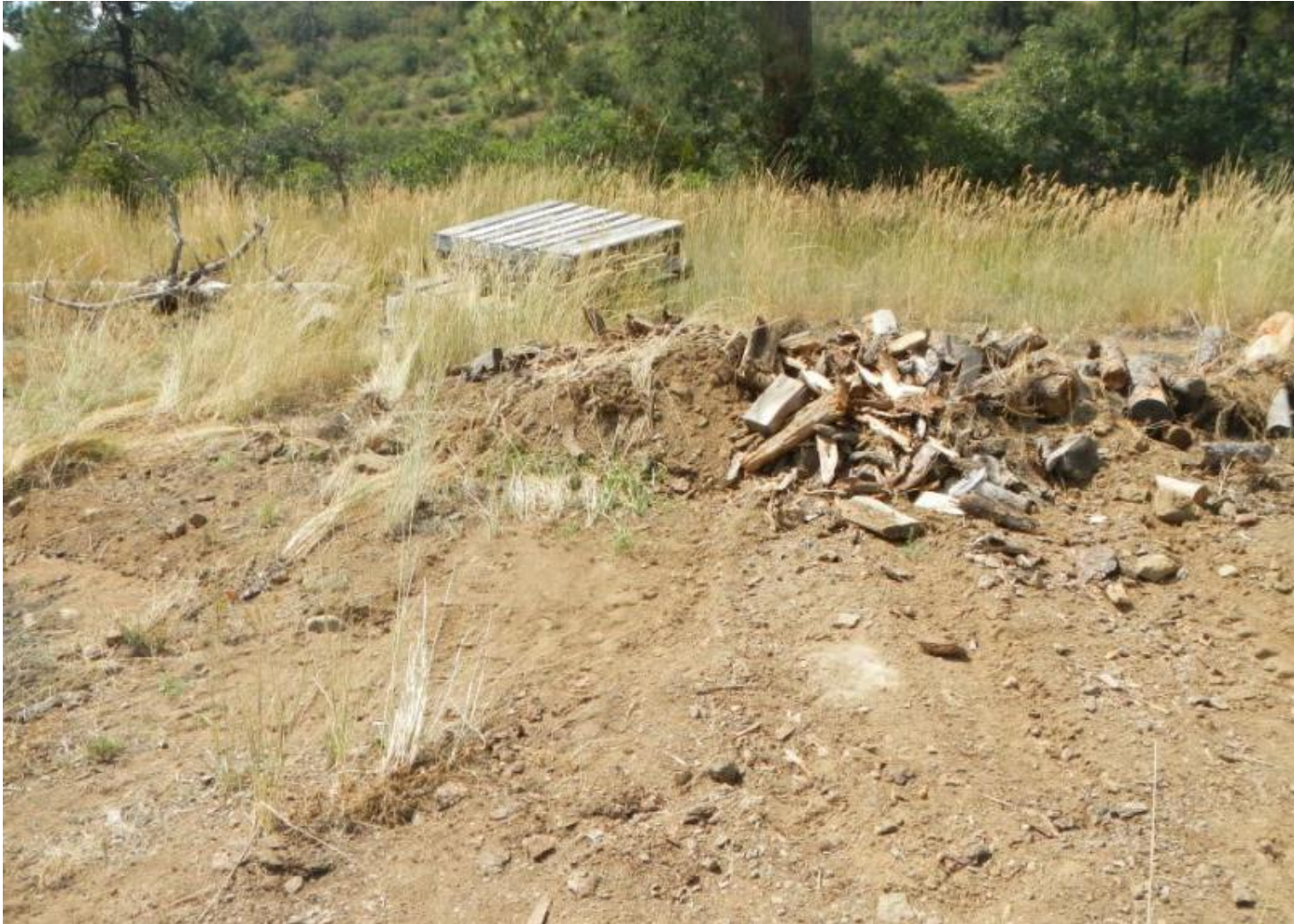
Photo 1. View of junk and debris within the northern portion of the project area.