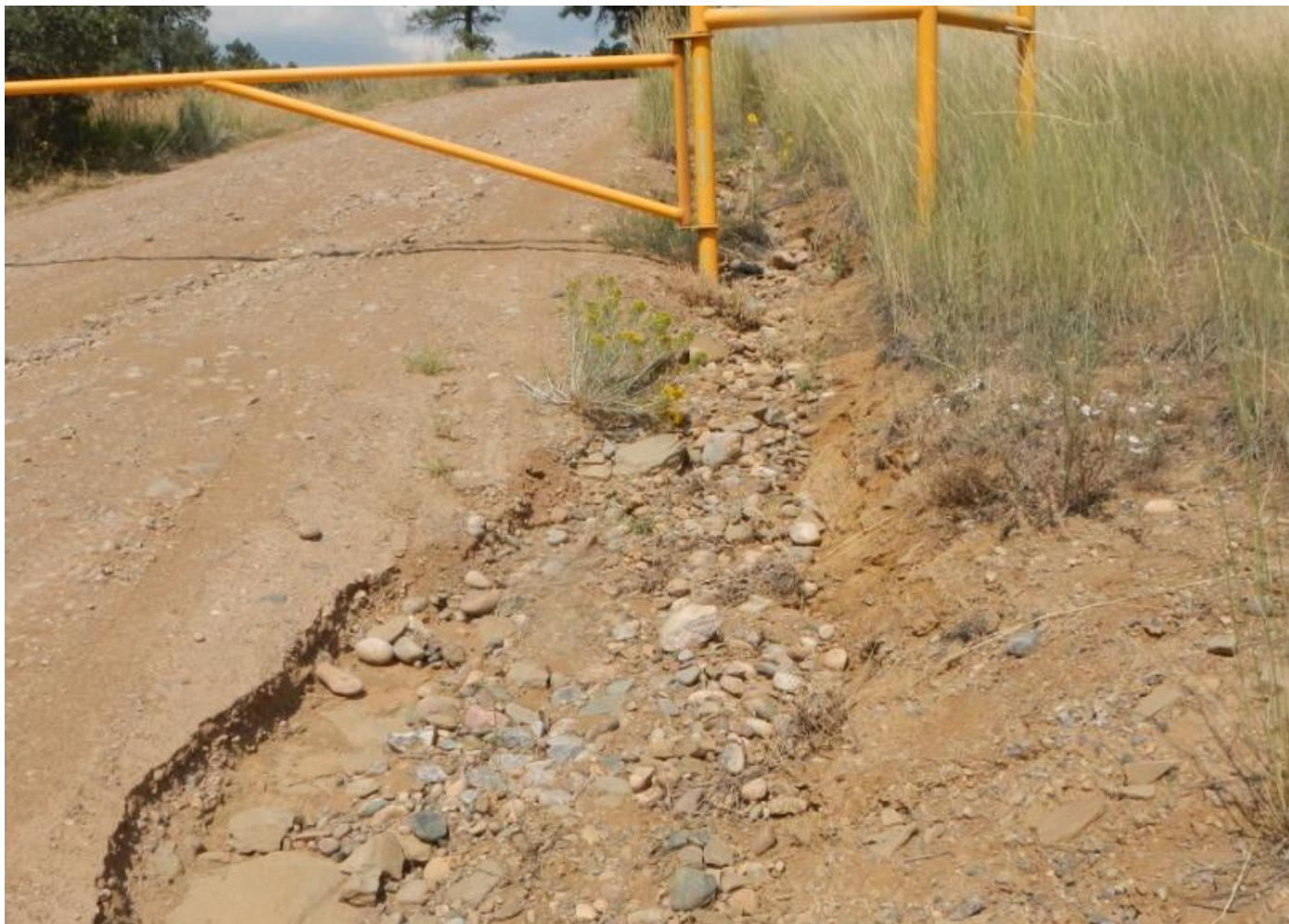
Photo 3. View of erosional channel approximately 3 to 4 feet wide and 1.5 feet deep along access road. Stormwater BMPs are needed to de-energize flows along the access road.