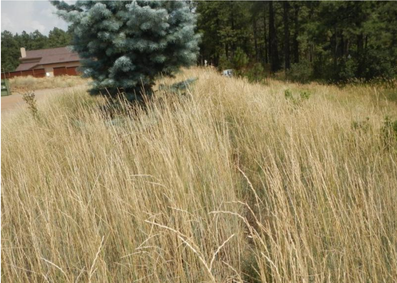
Photo 4. View of southern portion of the project area from southwestern corner facing eastward. Vegetation such as intermediate wheatgrass ( Thinopyrum intermedium ), western wheatgrass ( Pascopyrum smithii ), and white fir ( Abies concolor ) are becoming established here.