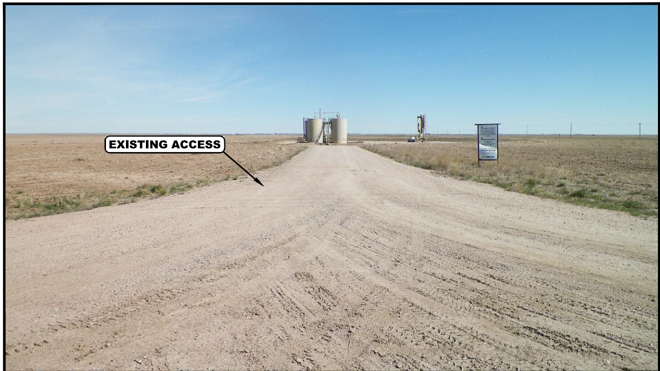
PHOTO: VIEW OF EXISTING ACCESS