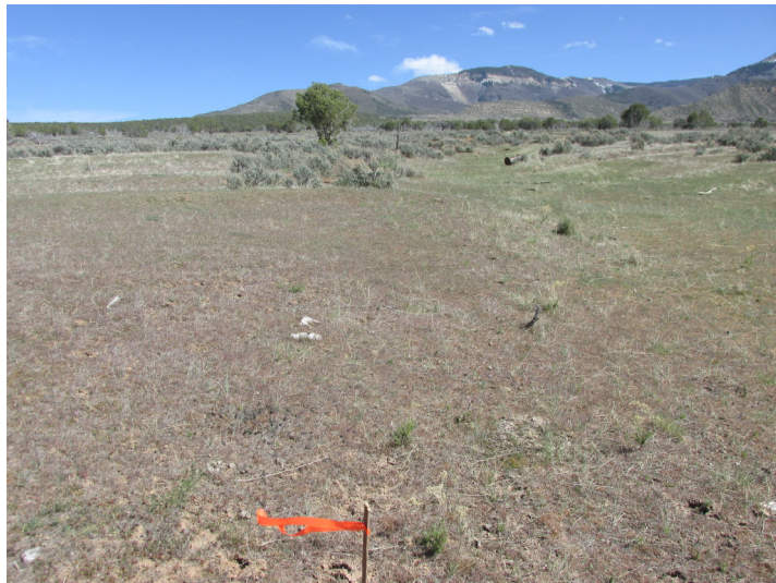
Monument Ridge B Pad 4/6/15 Looking East