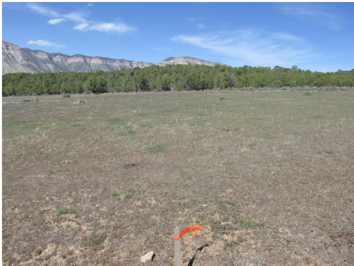
Monument Ridge B Pad 4/6/15 Looking North