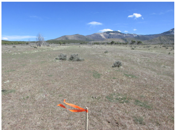
Monument Ridge B Pad, 4/6/15 Looking East