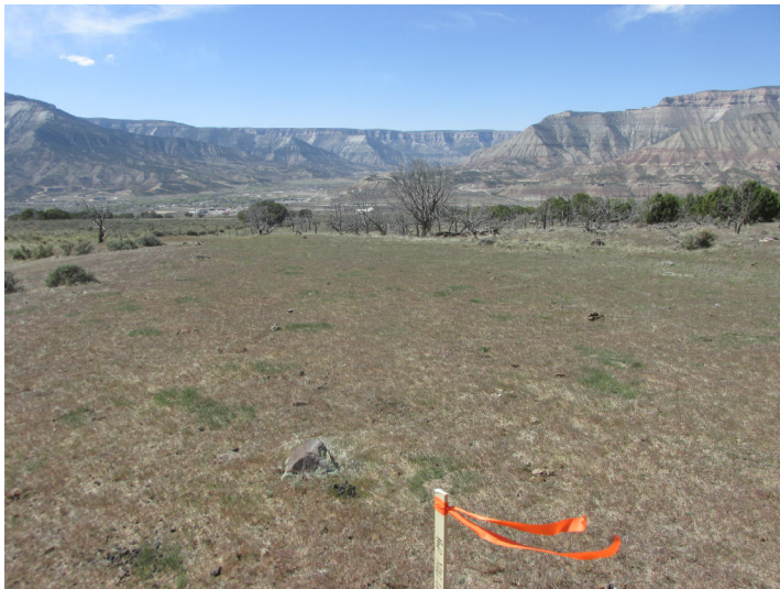
Monument Ridge B Pad, 4/6/15 Looking West