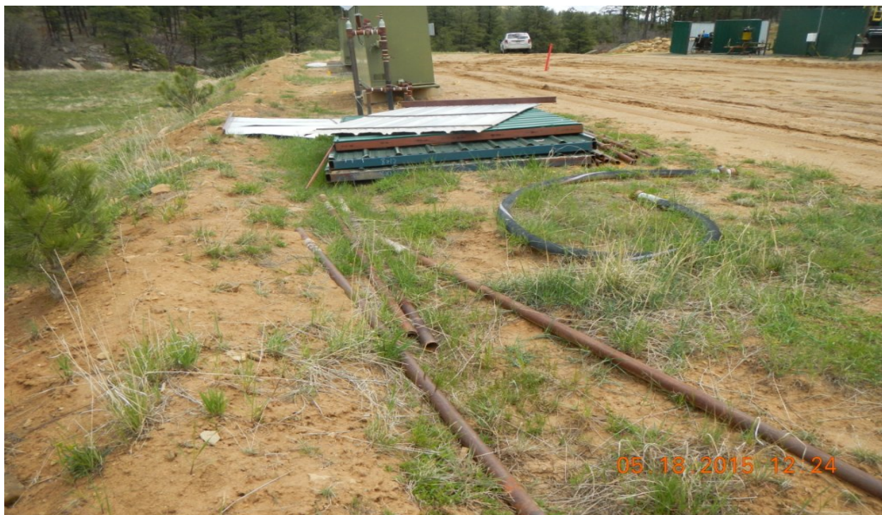
photo 3: North side of the location. Unused pipe and metal panels remain on the location.