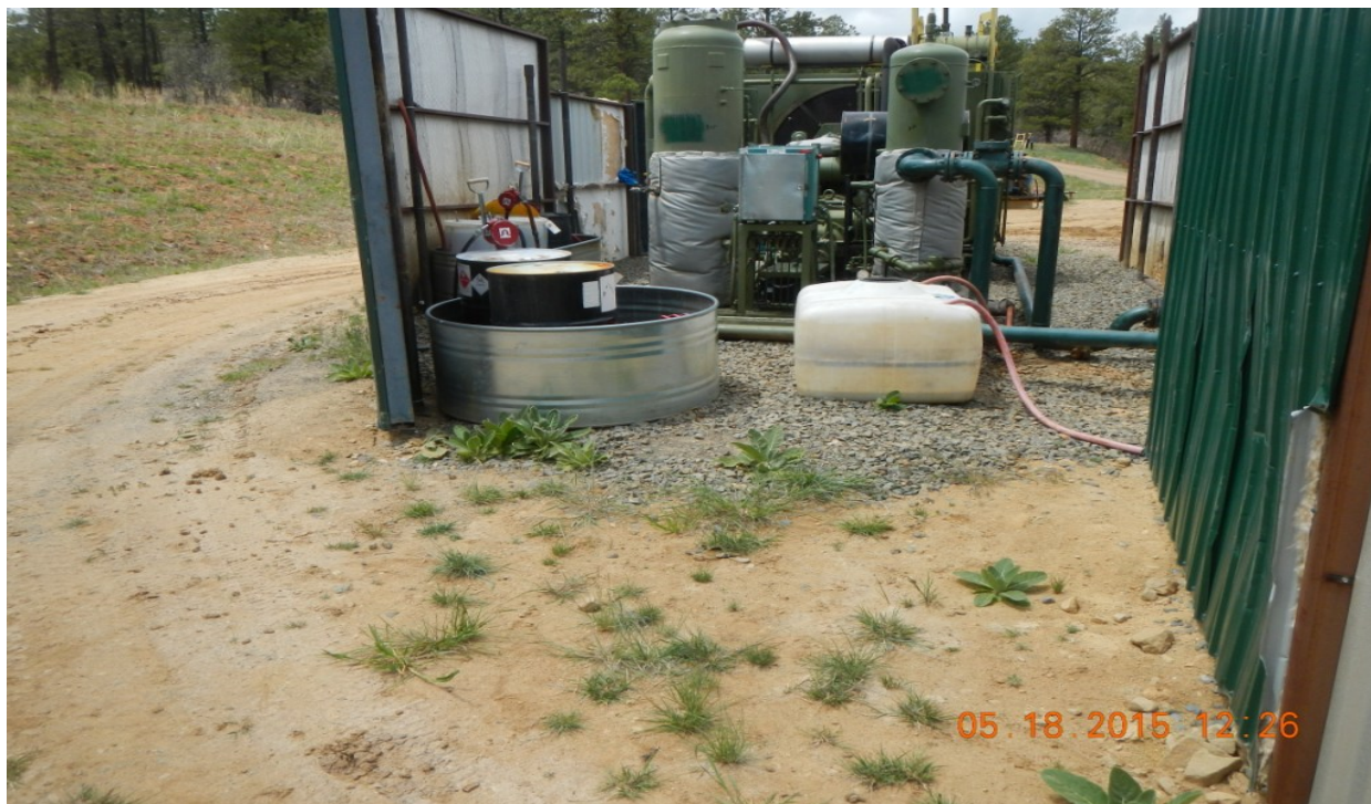
photo 6: Common mullien (list c noxious weed) growing near the equipment.