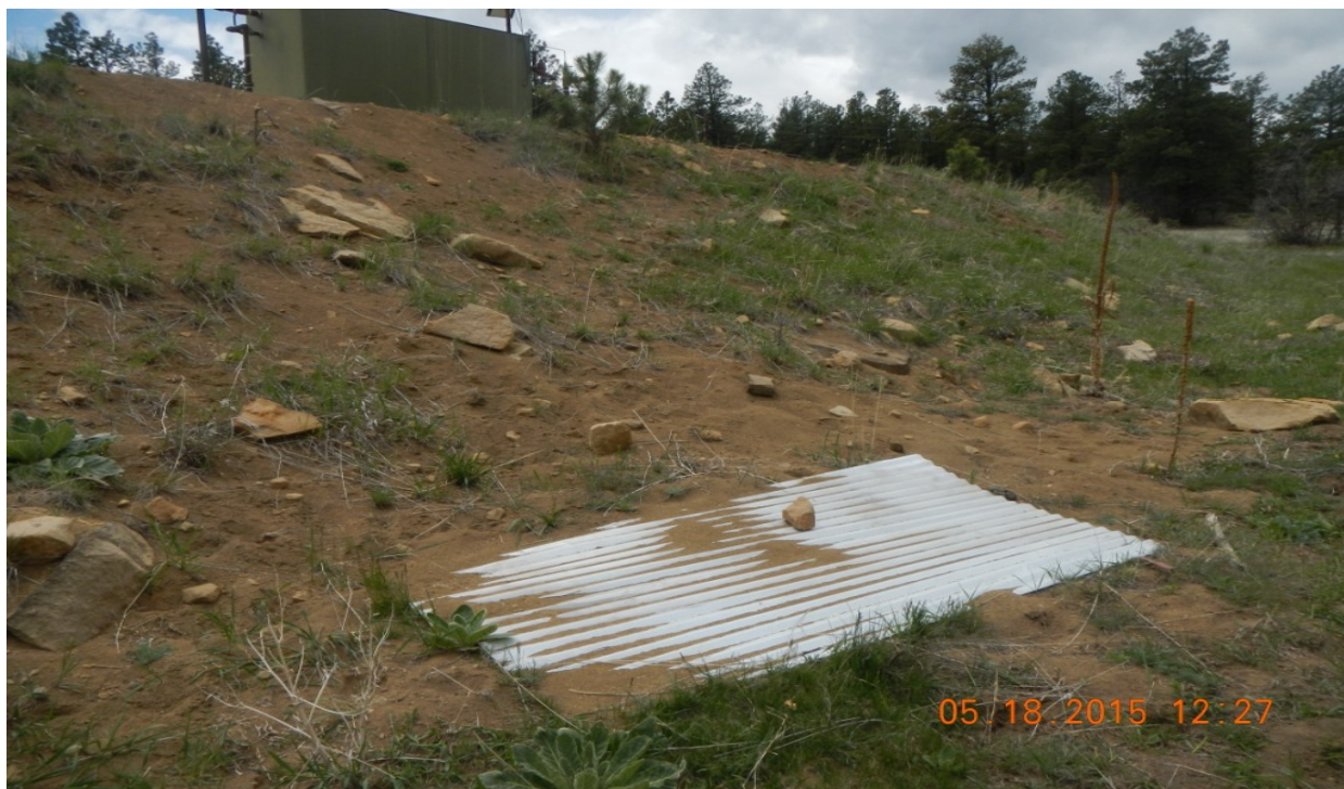
photo 5: Metal tin debris found at the north side of the location.