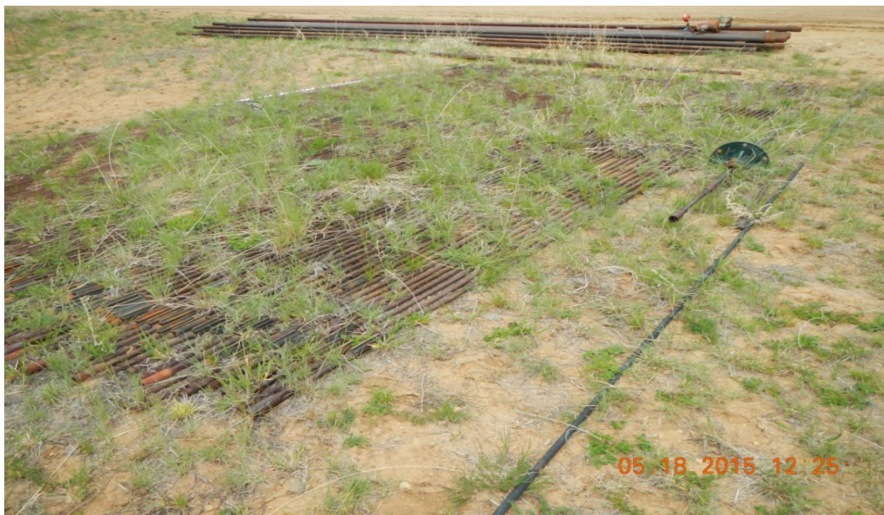
photo 4: South side of the location. Unused metal pipe and rods remain on the location.