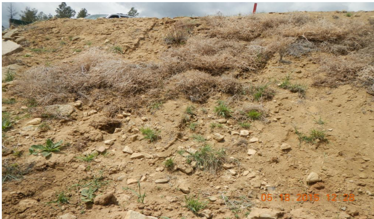
photo 5: East side of the location. Erosion channels have formed transporting sediment off the pad.