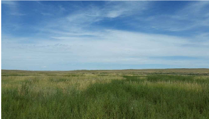
REFERENCE CENTER FACING NORTH

SONIC STAR 1-12-8-60 PAD LAT: N40.667400° LONG: W104.049260°