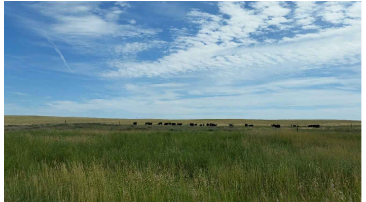
REFERENCE CENTER FACING EAST