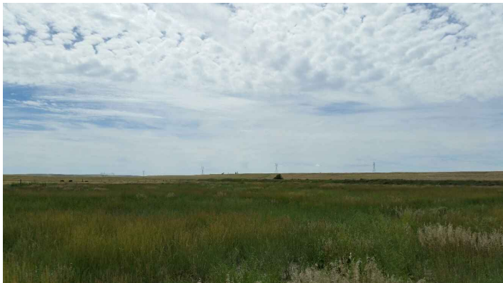
REFERENCE CENTER FACING SOUTH