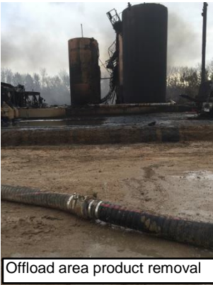
Offload area product removal