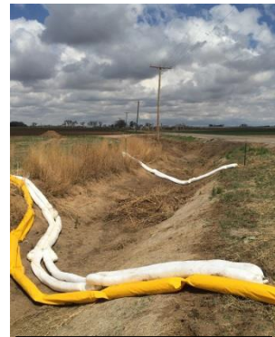
Last set of booms