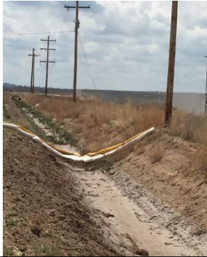
Between 2nd and 3rd booms