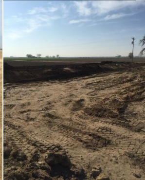
Cleaned pond area.