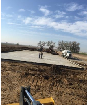
Cleaned Containment area