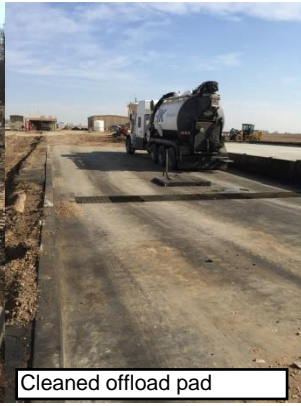
Cleaned offload pad