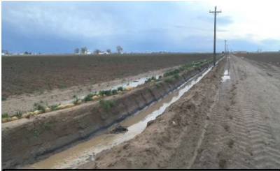
Staining on side of ditch as water level dropped.