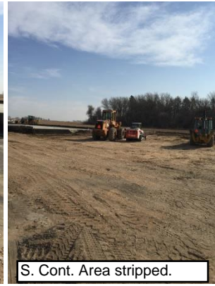
S. Cont. Area stripped.