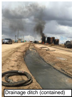
Drainage ditch (contained)