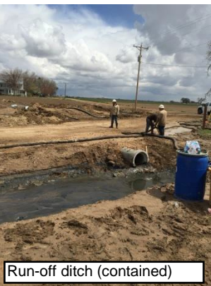
Run-off ditch (contained)