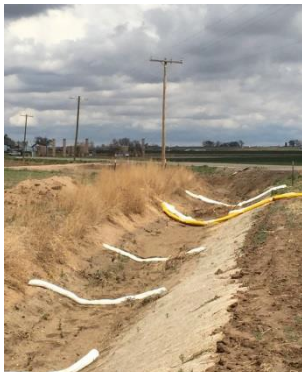
Between 2nd and 3rd booms

Booms were also placed strategically along the county ditch (Note the water had been sucked out at this point) Pictures take 4/18/2015: