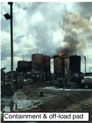
Containment & off-load pad

On Saturday, we were able to begin assessment of the affected areas: