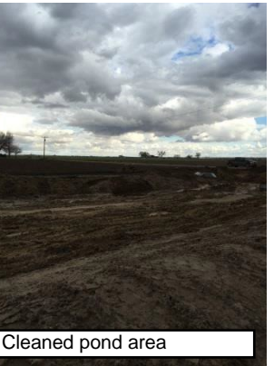
Cleaned pond area