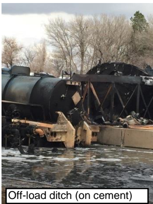
Off-load ditch (on cement)