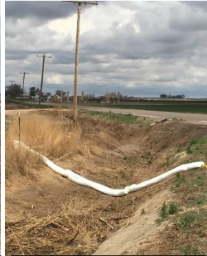
2nd set of booms