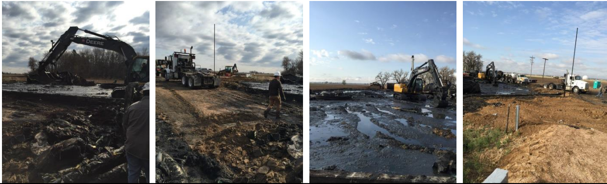
Infrastructure removal from containment

4/20-21/2015- Damaged Structures removed. Cleanup of pad site continued.