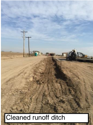
Cleaned runoff ditch