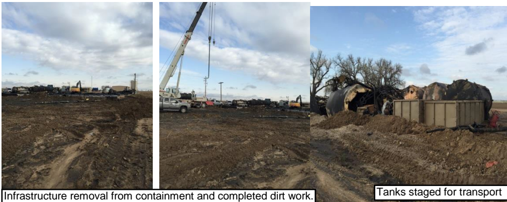
Infrastructure removal from containment and completed dirt work.