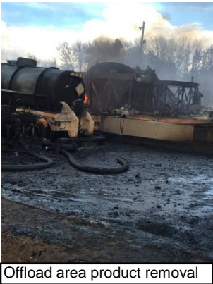
Offload area product removal