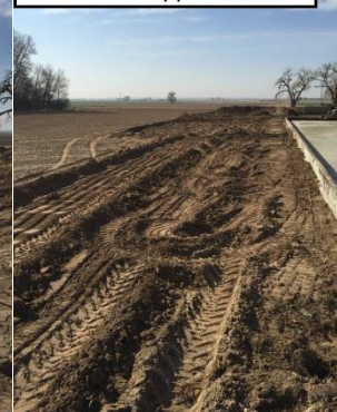
Farm field stripped.