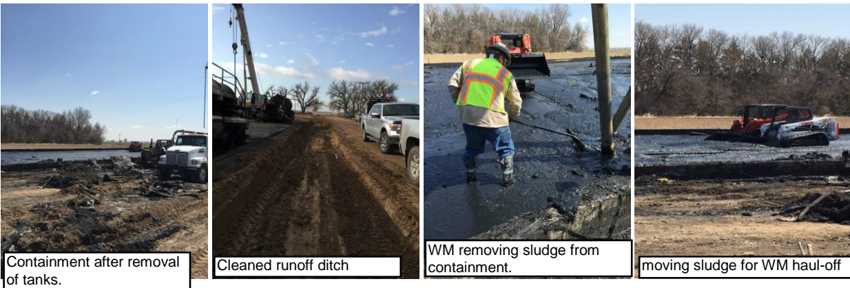
Containment after removal of tanks.