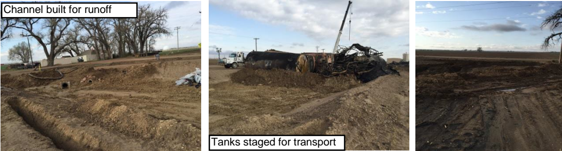
Channel built for runoff