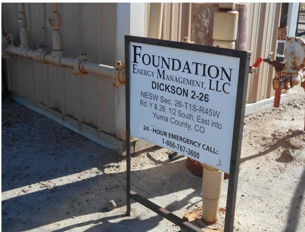
Dickson 2-26 Well Location Sign