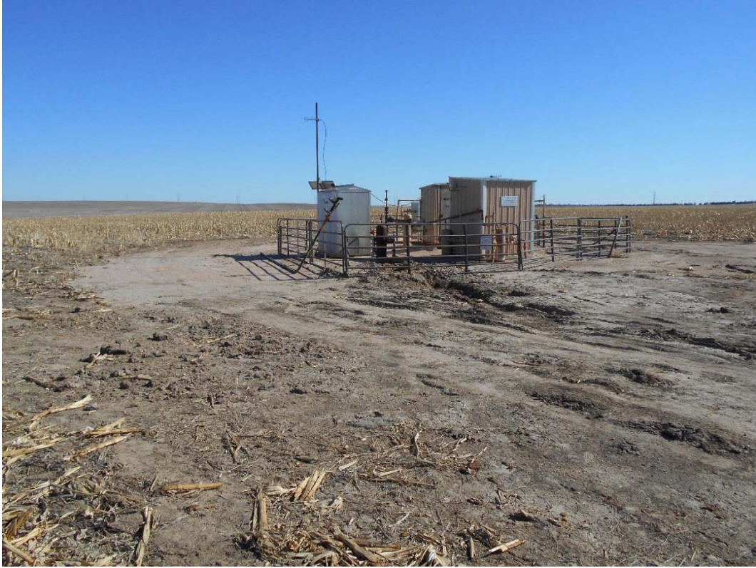
Dickson 2-26 West of well looking east