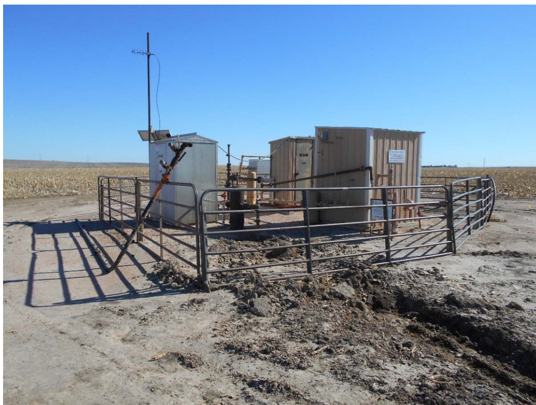
Dickson 2-26 West of well looking east