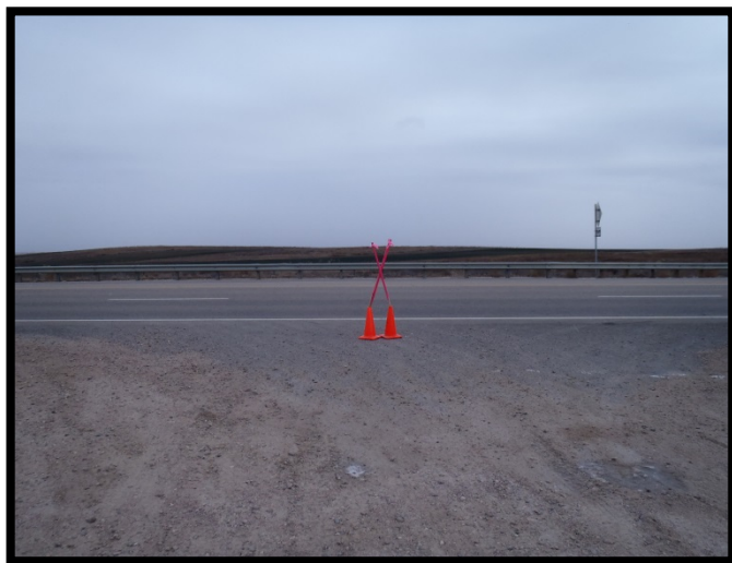
Looking from the access to the roadway