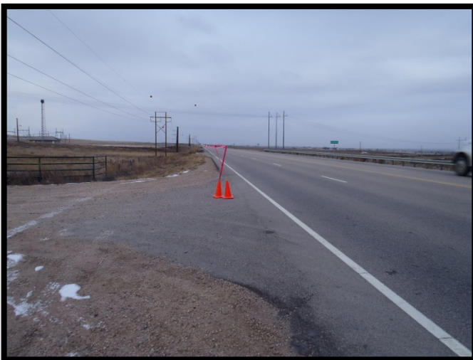
Looking down the roadway to the left of the access