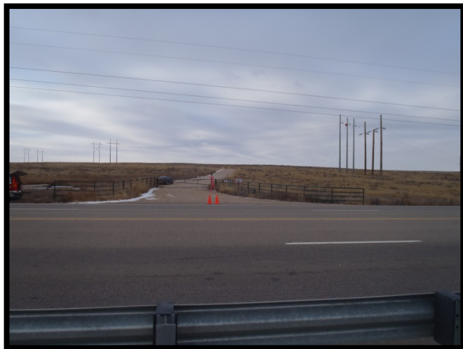
Looking from the roadway into the access location