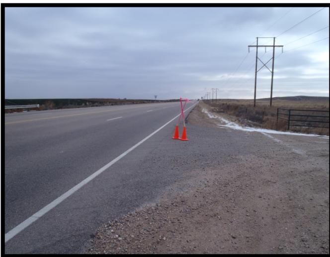
Looking down the roadway to the right of the access