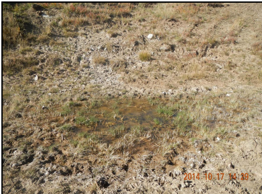
Little water at the bottom of the pond. No hydrocarbon odor or sheen.