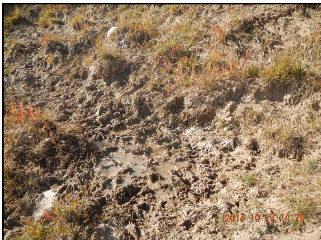
Seeps on the northwest side of the pond. Some white mineral deposition.