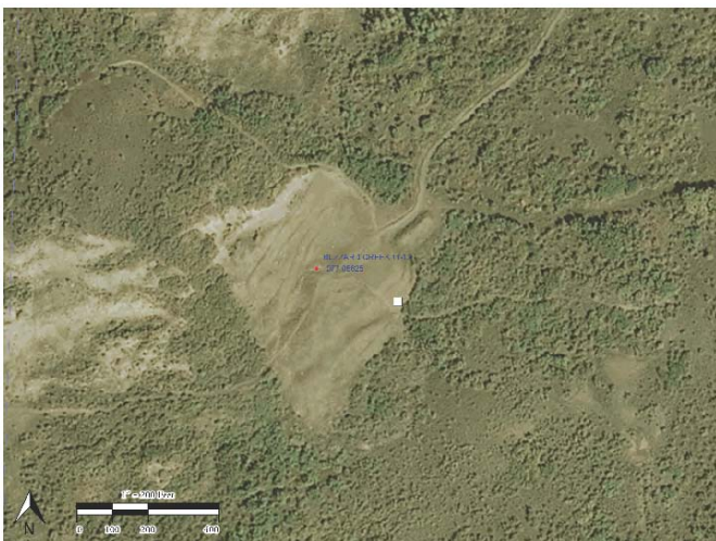
Aerial view. Well location as built.

Approximately 90 feet between well location (as built coordinates) and pond. Pond is lower by about 9 feet than the well ground surface .