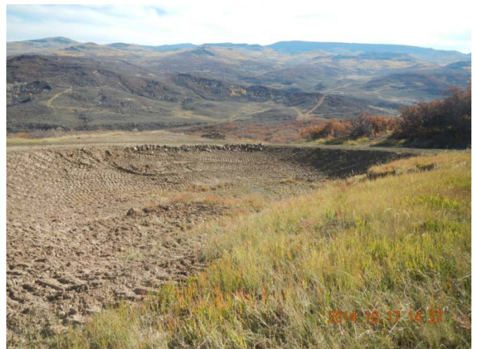
View of the pond, on the western side of the pad.