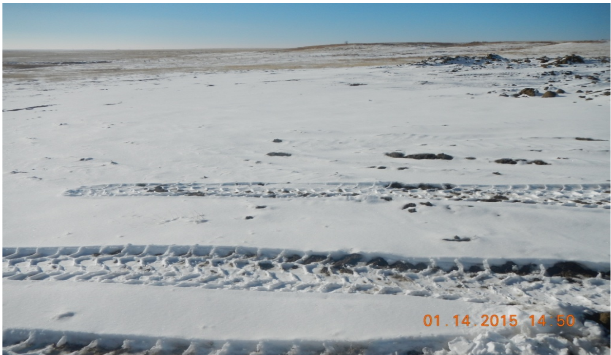
photo 6: South side of the location. No stormwater controls were present.