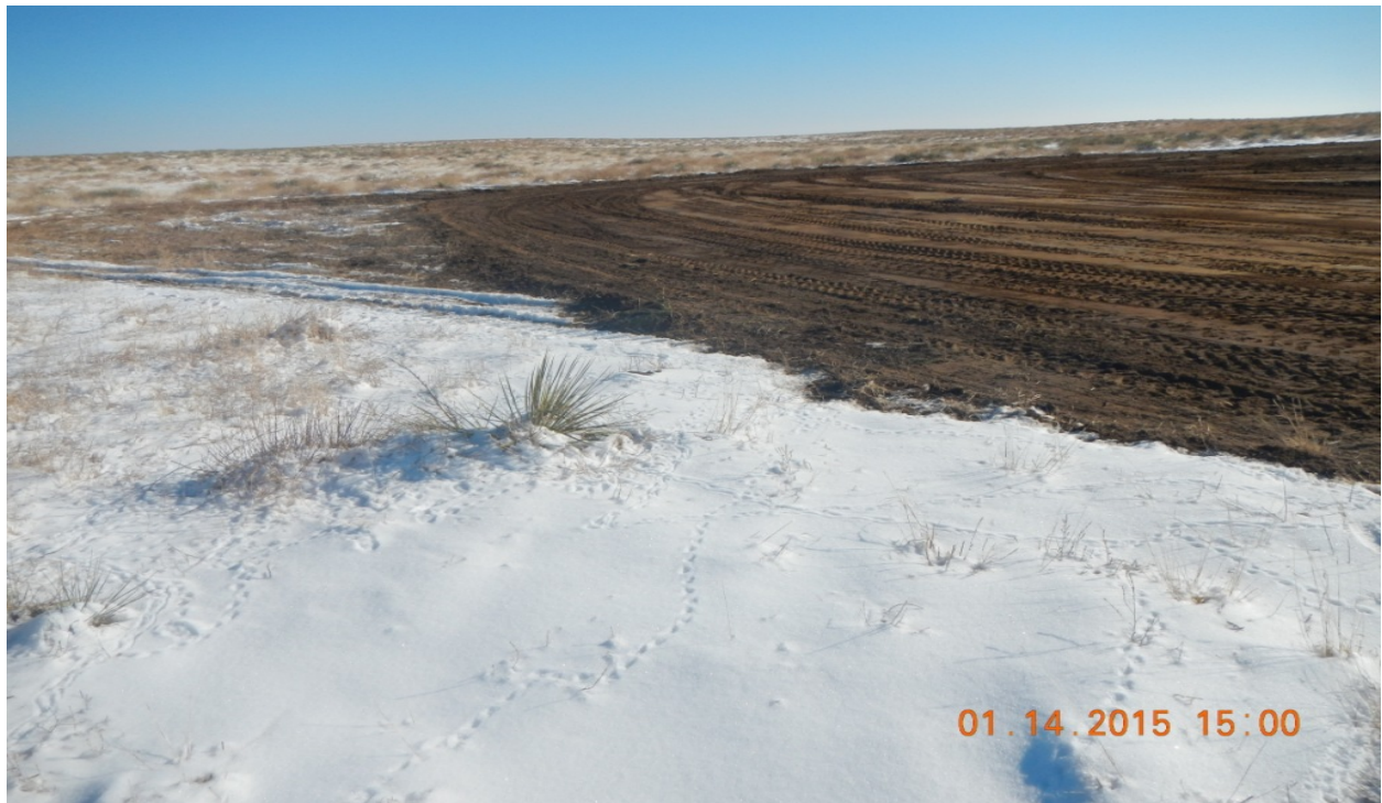
photo 5: Northeast side of location. No stormwater controls present.