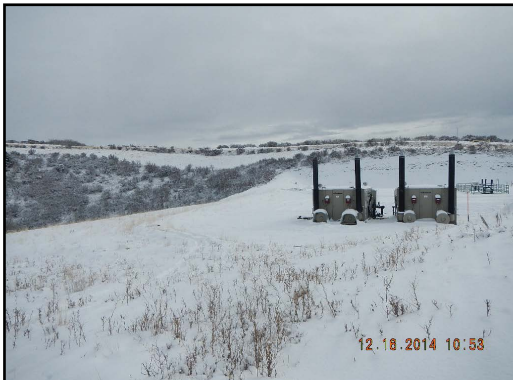
From the Northwest corner of the pad, looking East. Separators and fenced wells (behind the separators, to the right). See natural drainage to the North (left).