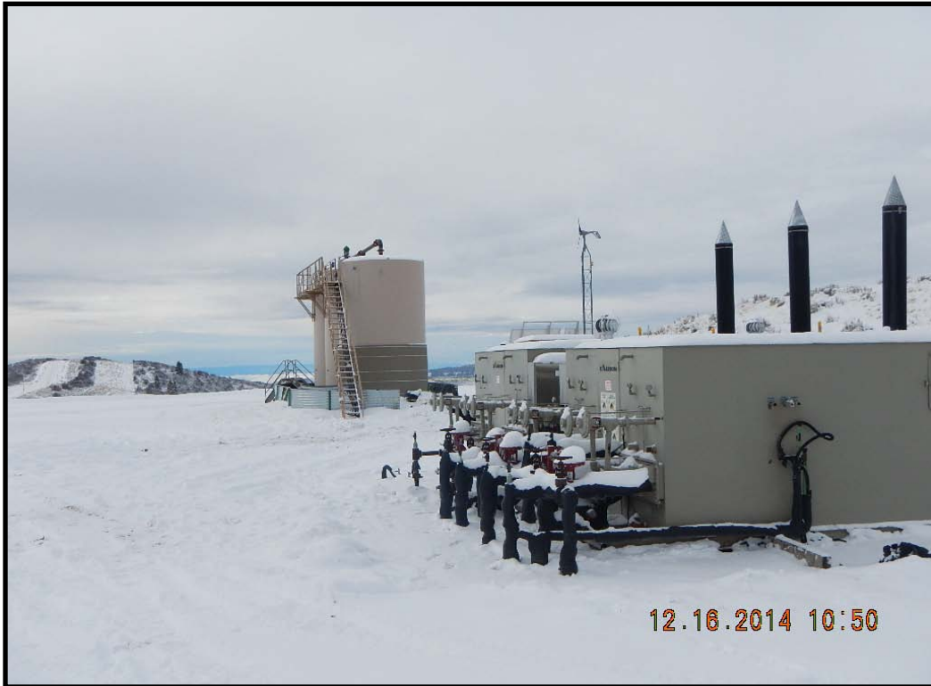
From the Northwest corner of the pad, looking South. Separators and tanks.