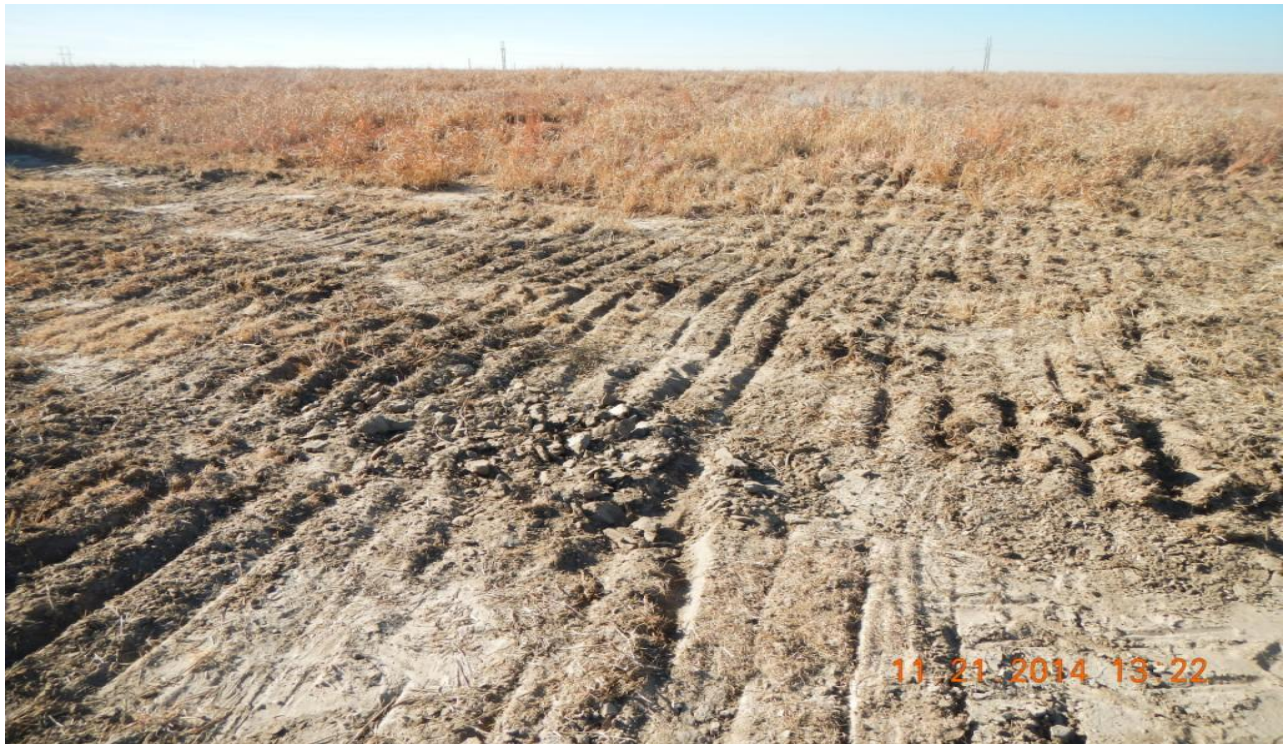
photo 4: Ground had recently been ripped on location and in the surrounding pasture.