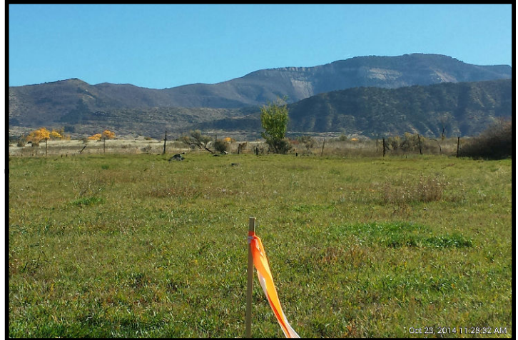
Yater Looking East