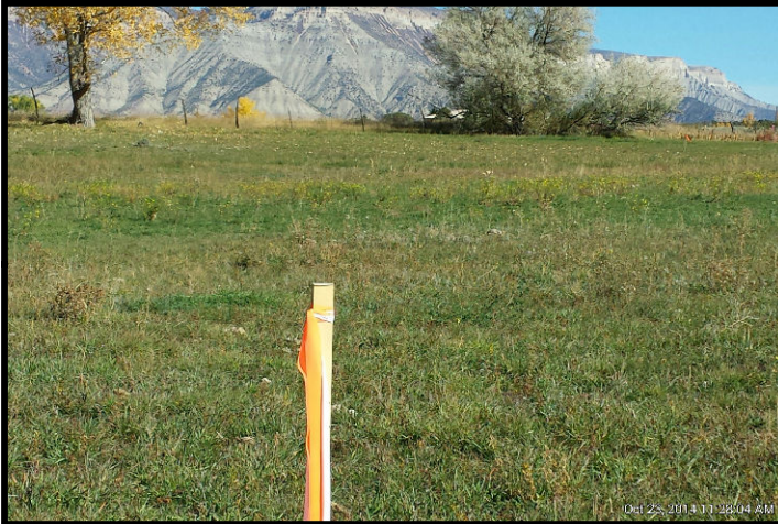
Yater Looking North