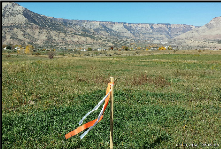
Yater Looking West