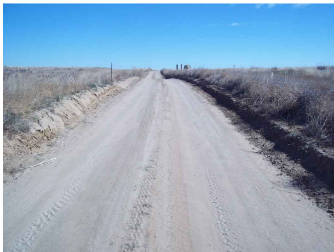
VIEW EAST (CR 58)