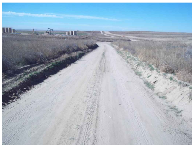
VIEW WEST (CR 58)