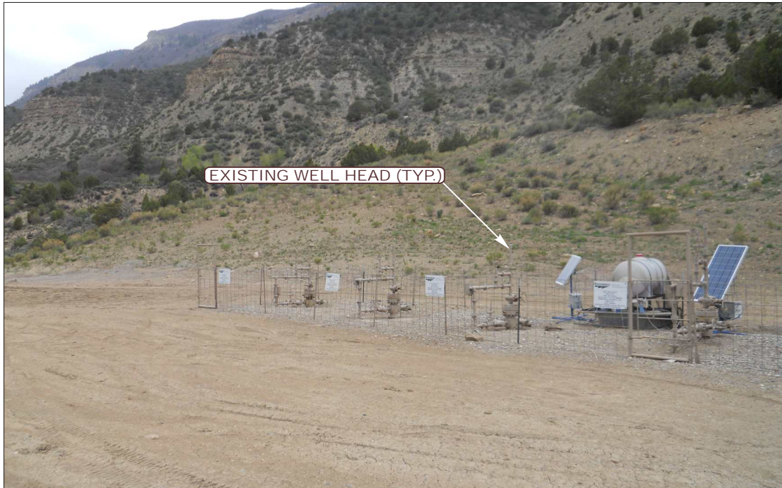
PHOTO: VIEW OF EXISTING WELLS