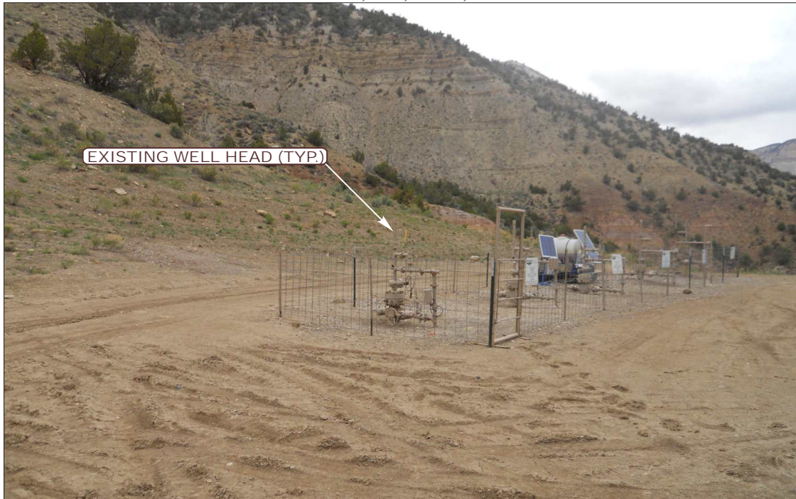
PHOTO: VIEW OF EXISTING WELLS