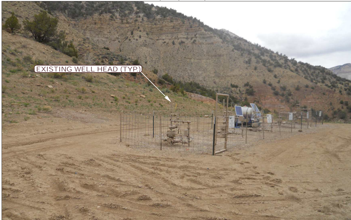
PHOTO: VIEW OF EXISTING WELLS