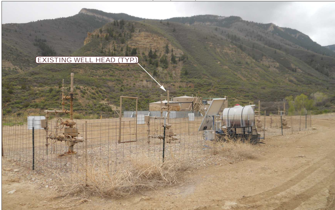
PHOTO: VIEW OF EXISTING WELLS