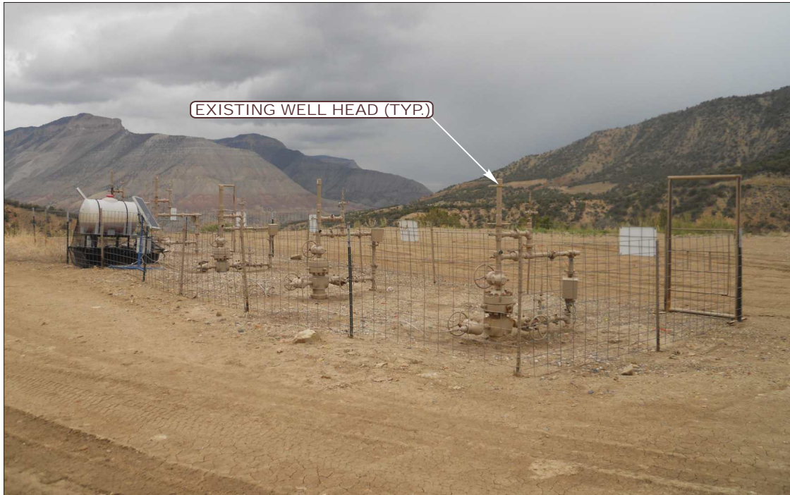
PHOTO: VIEW OF EXISTING WELLS