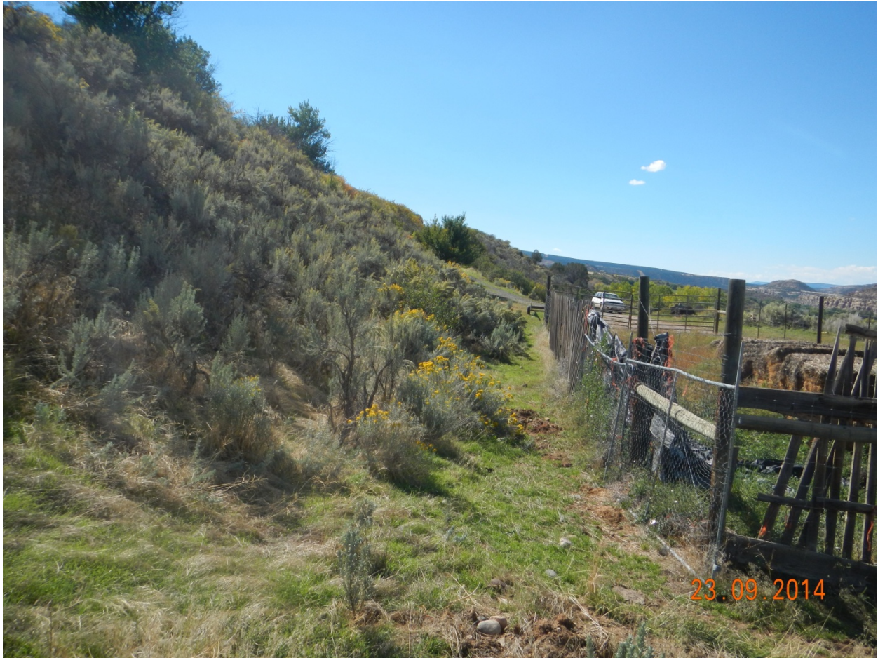
8. Looking West from SE corner (2).