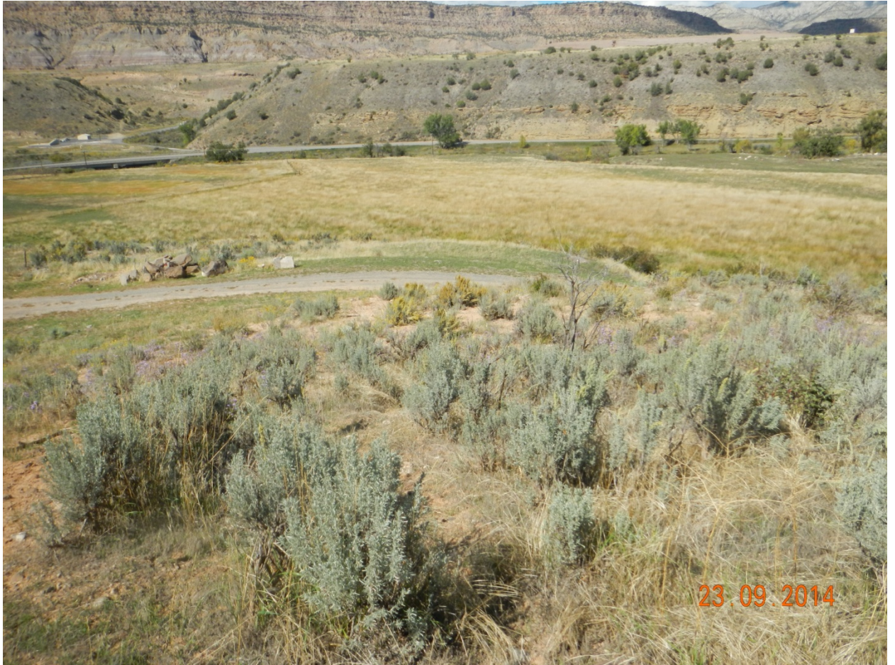
6. Looking North from NE corner.