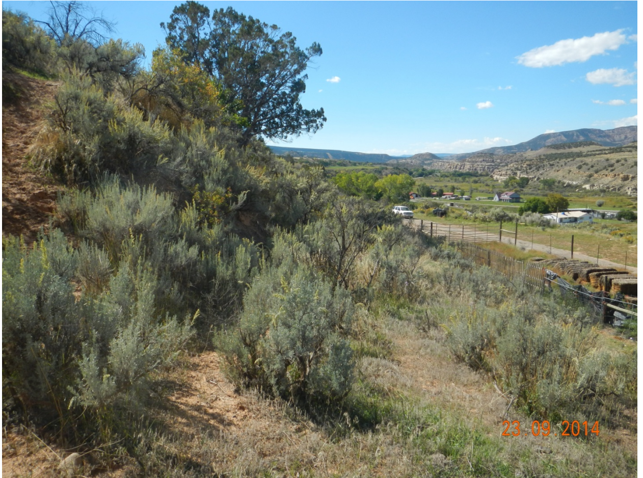
7. Looking West from SE corner (1).