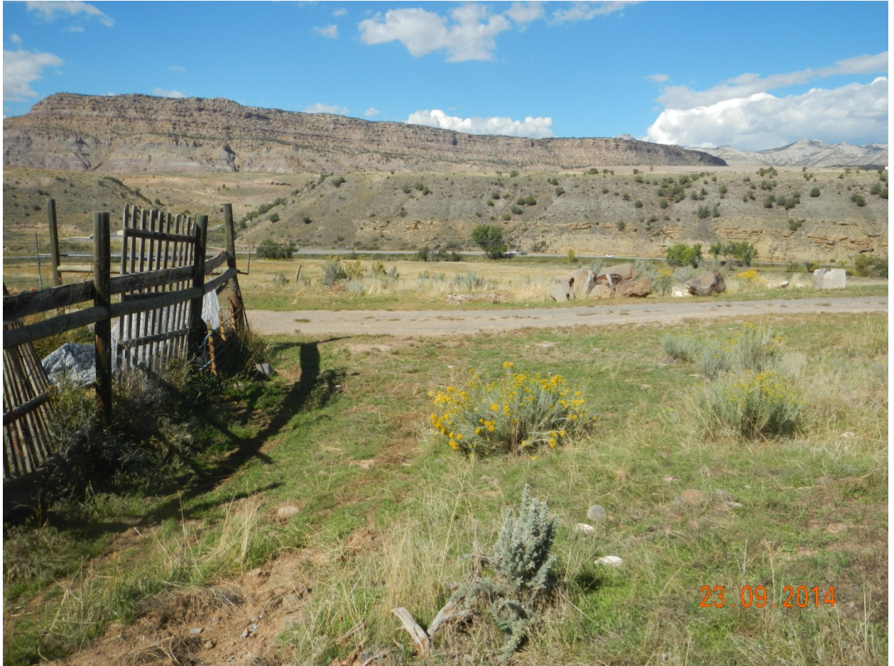
9. Looking North from SE corner.