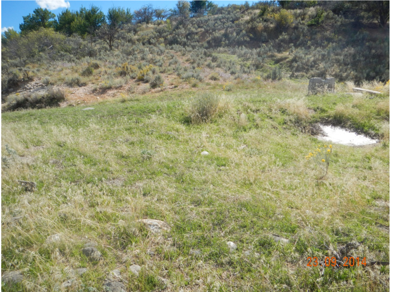
3. Looking South from NE corner.