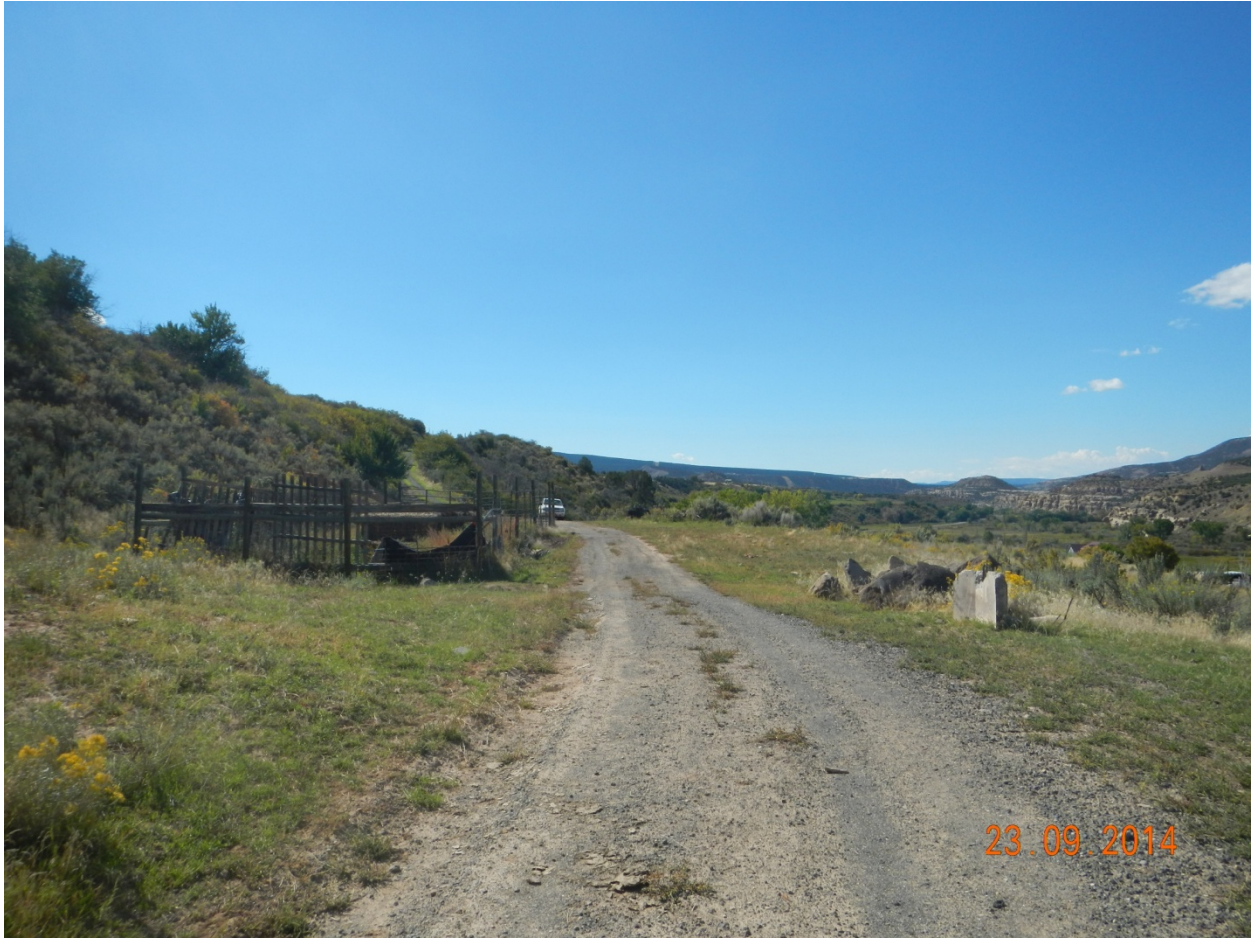
4. Looking East from NE corner.