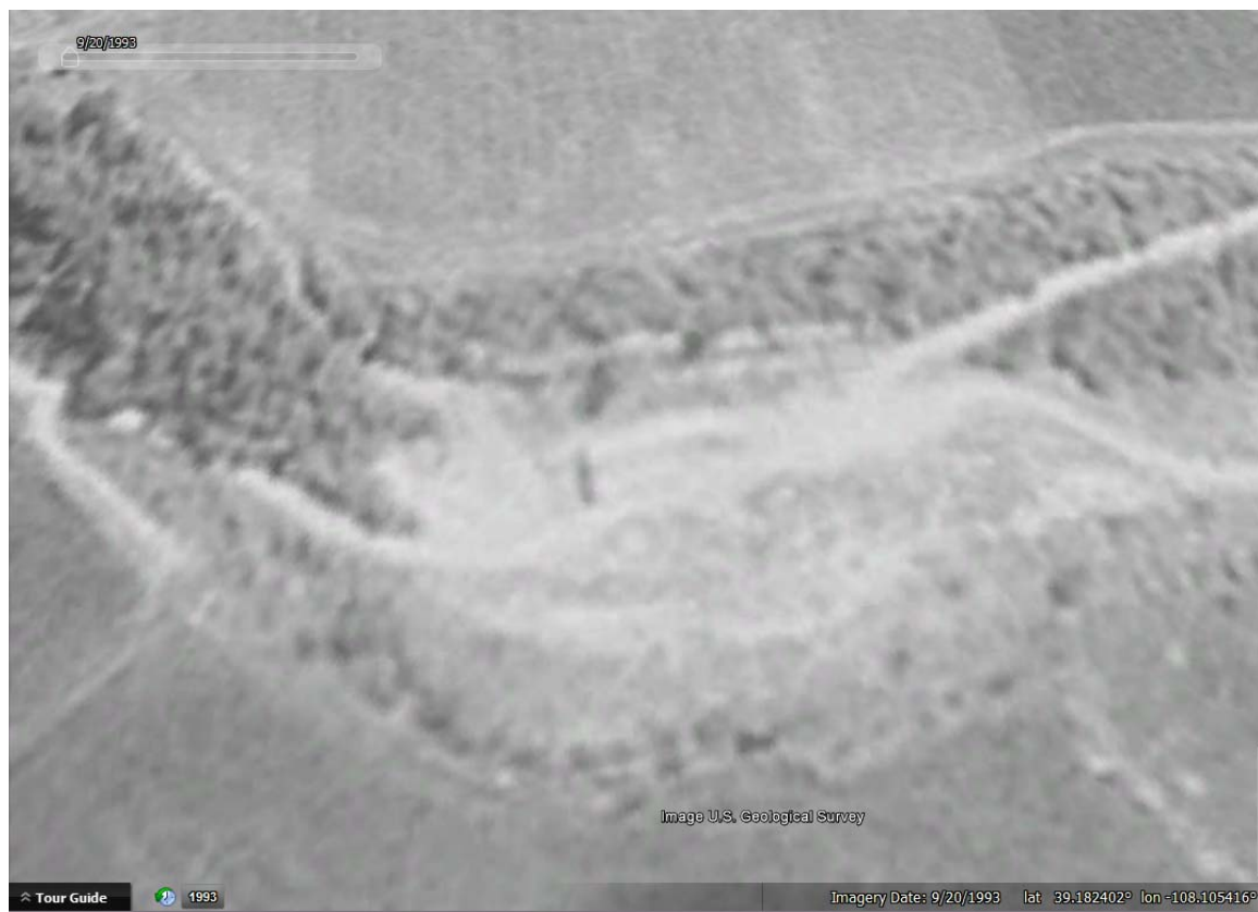
4. Ortho-photo of Location from Google Earth 1993.