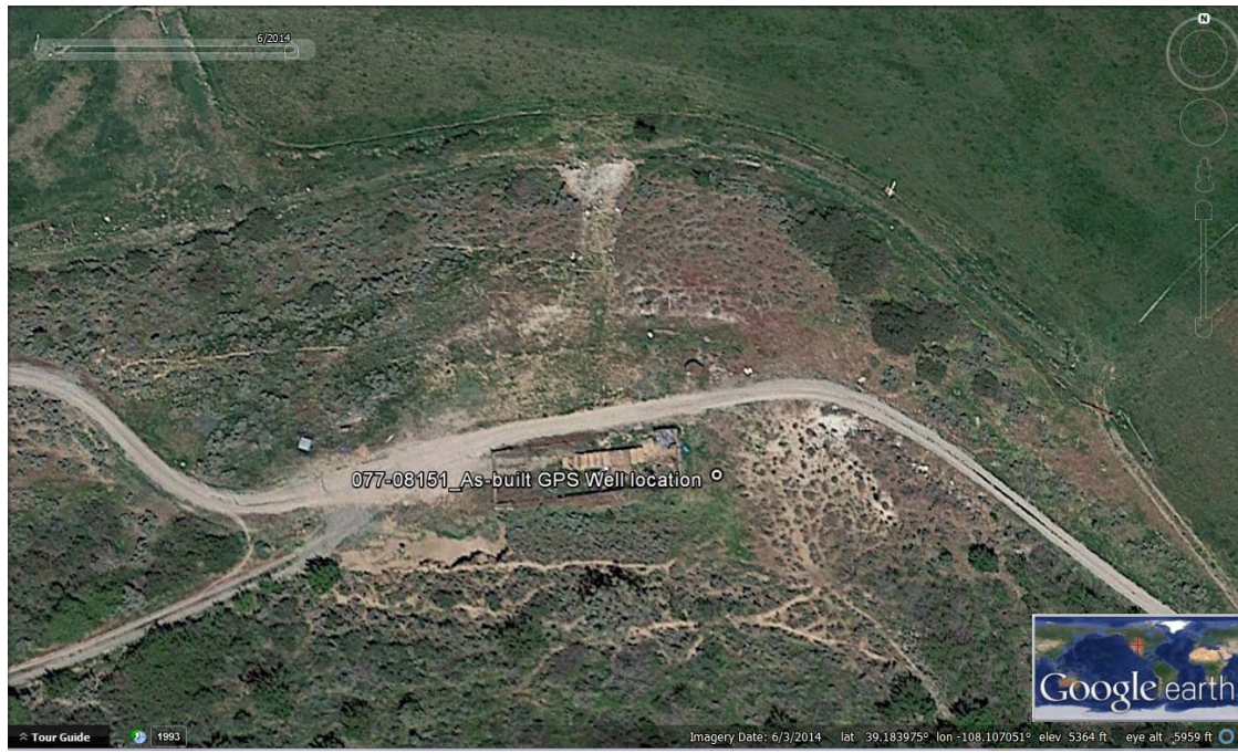
1. Ortho-photo of Location from Google Earth 2014 (1).