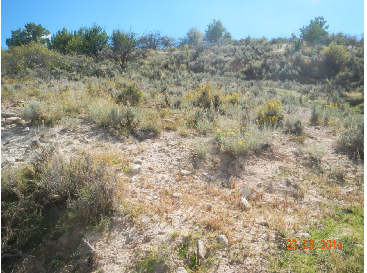
5. Looking South from NE corner.