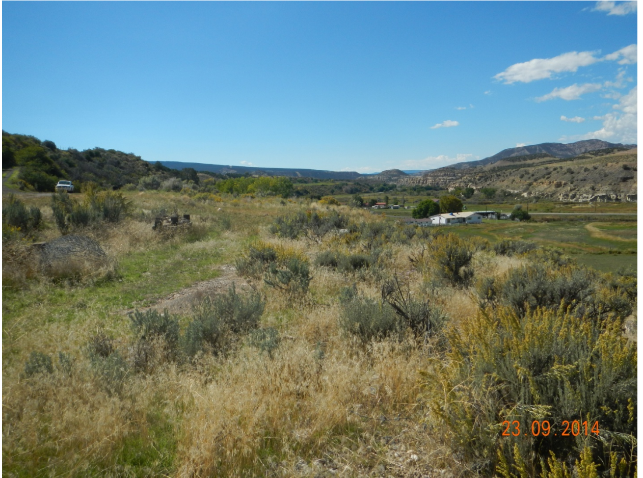
2. Looking West from NE corner.