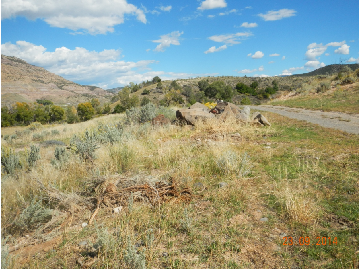
10. Looking East from North, center.