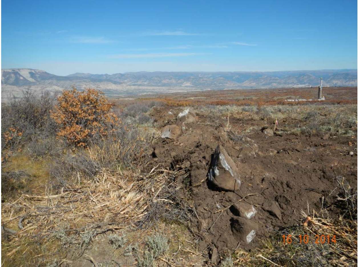
11. Location topsoil stripping on West perimeter, viewed North from SW corner.