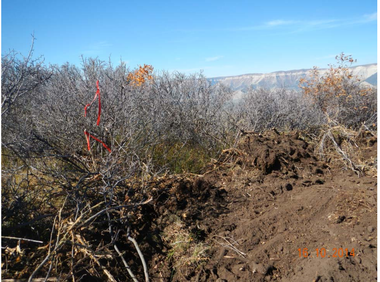
9. Location topsoil stripping on South perimeter, viewed West from SE corner..