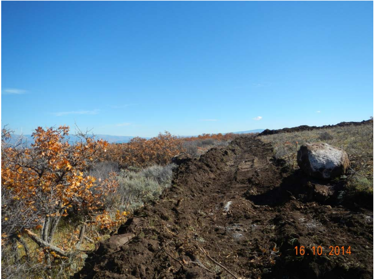
12. Location topsoil stripping on North perimeter, viewed East from NSW corner.