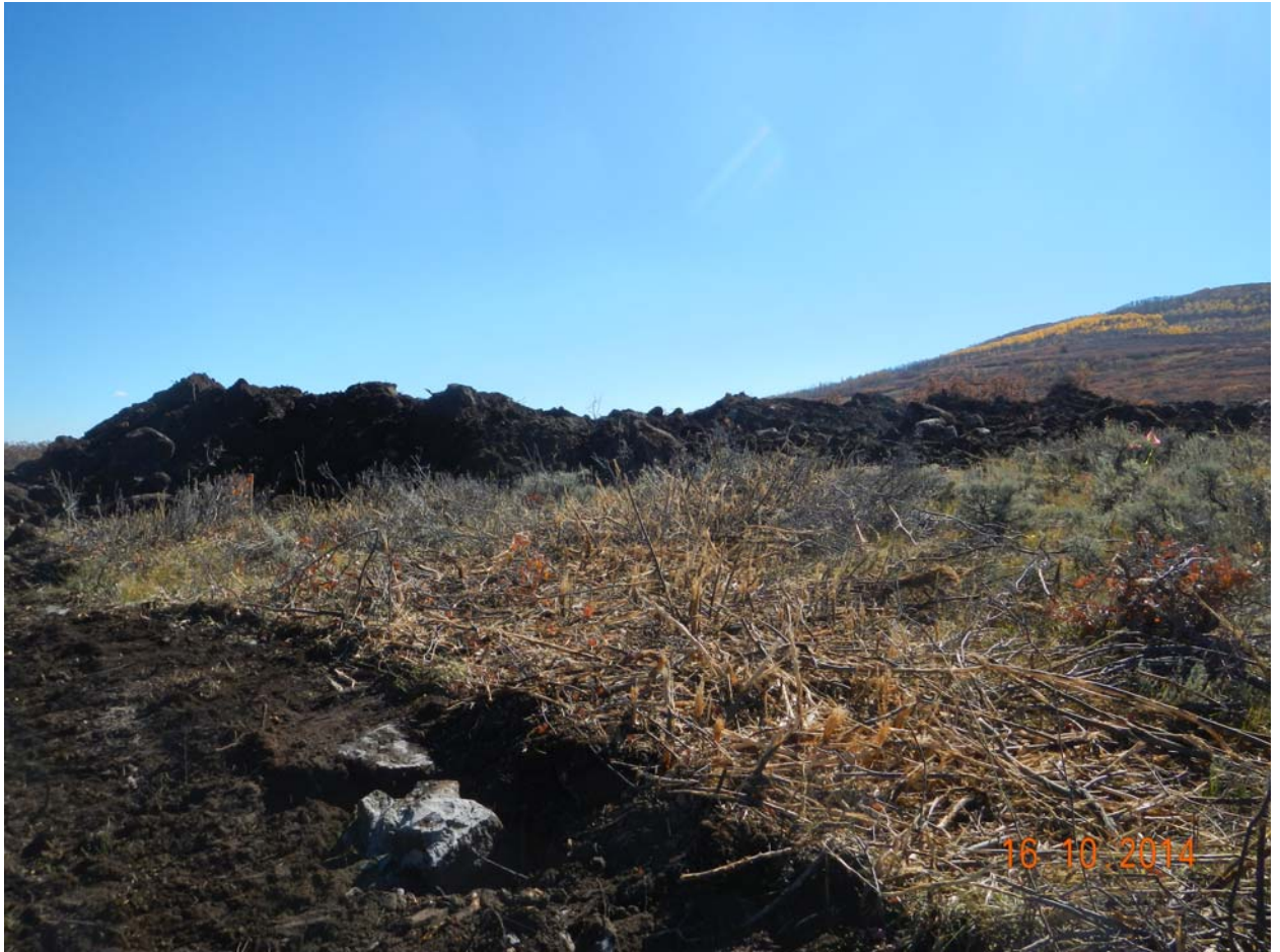
13. Location topsoil stockpile, viewed North from Western perimeter.