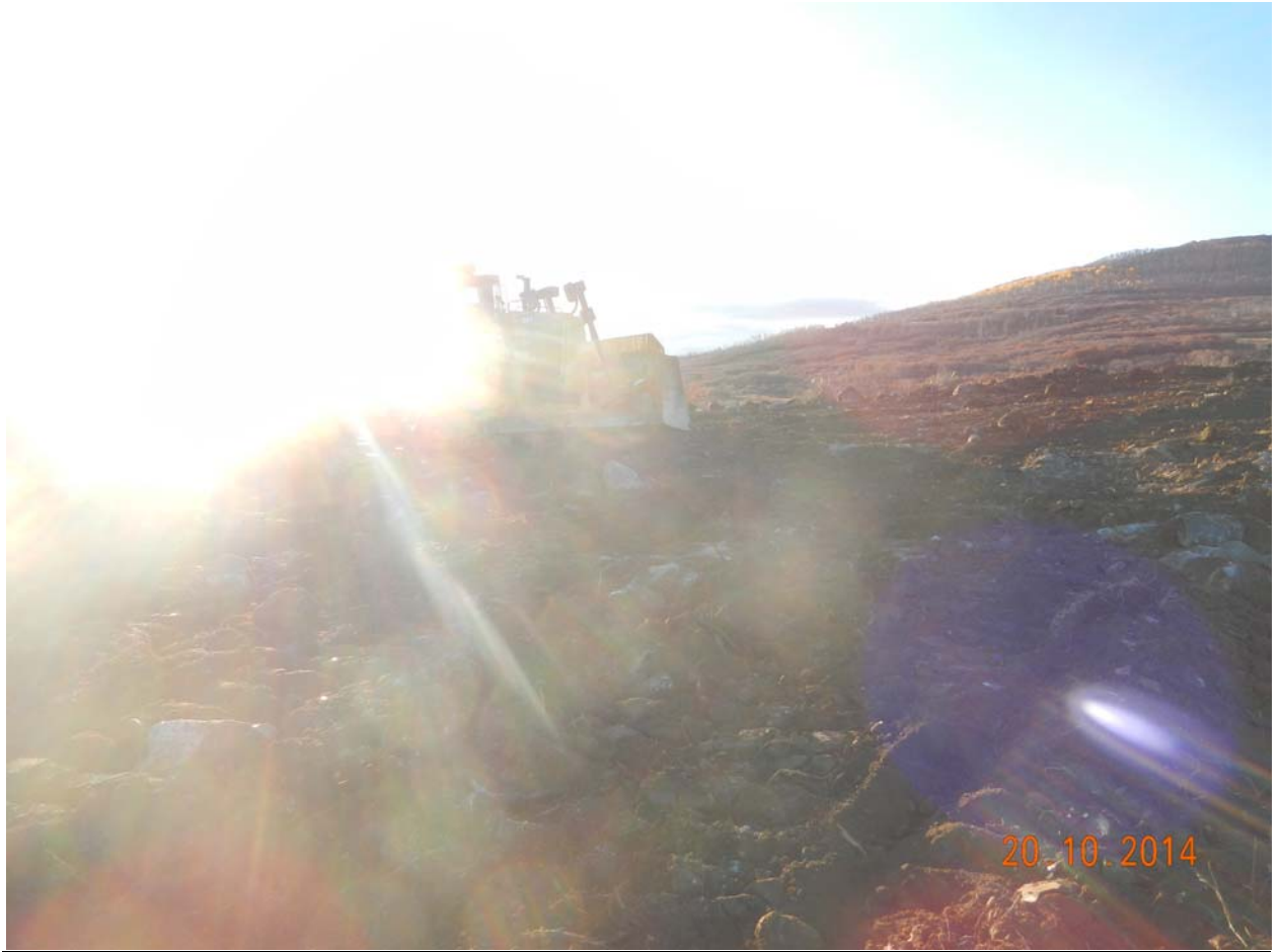
19. View from center of pad, looking East.