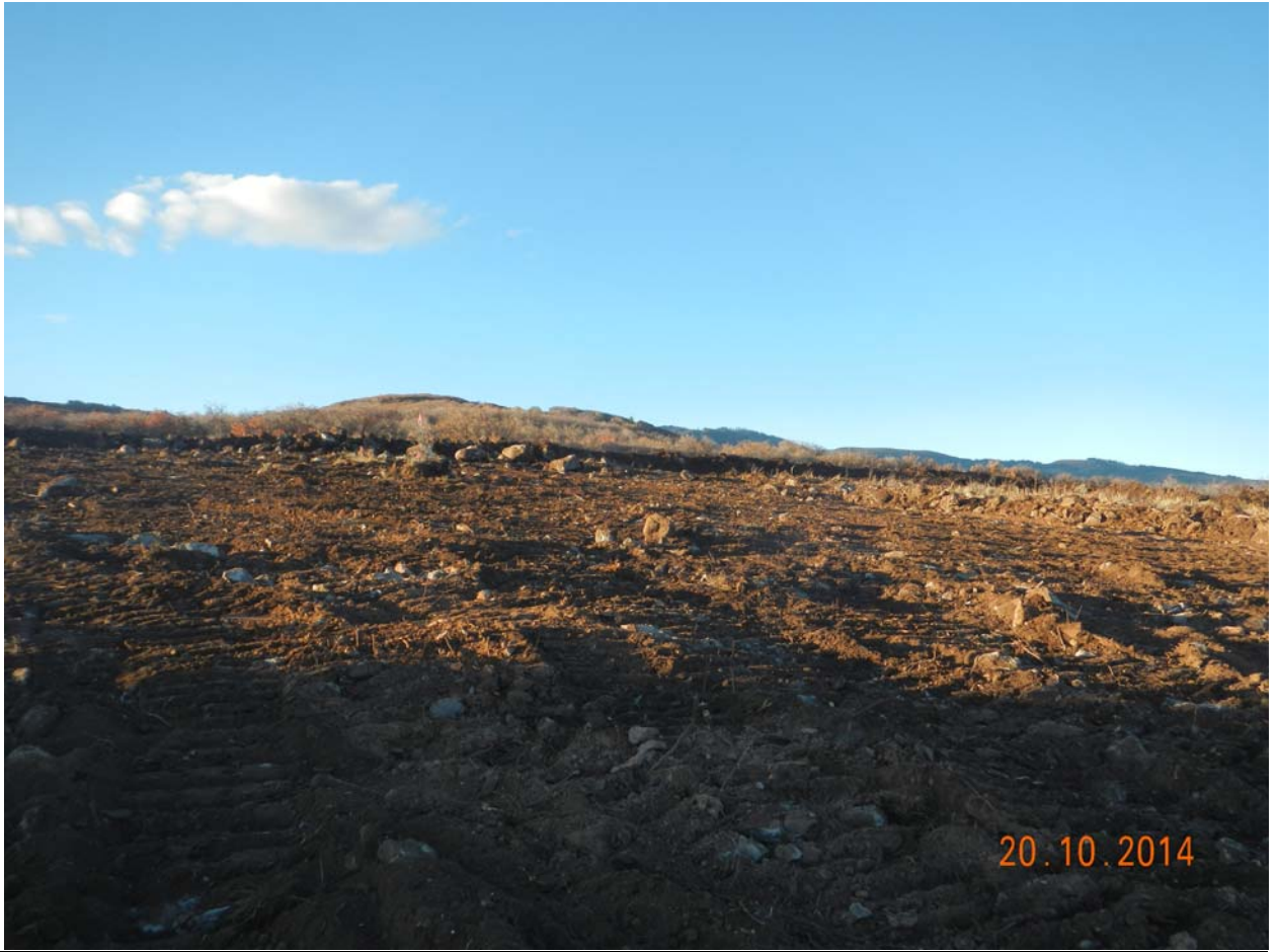
20. View from center of pad, looking South.