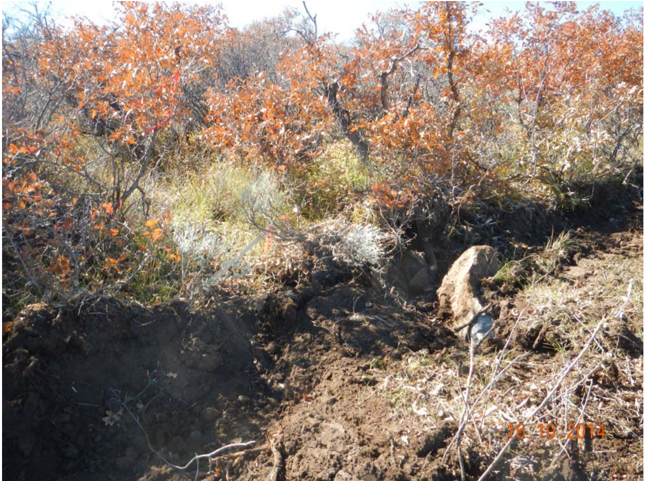
8. Location topsoil stripping at SE corner, viewed South.