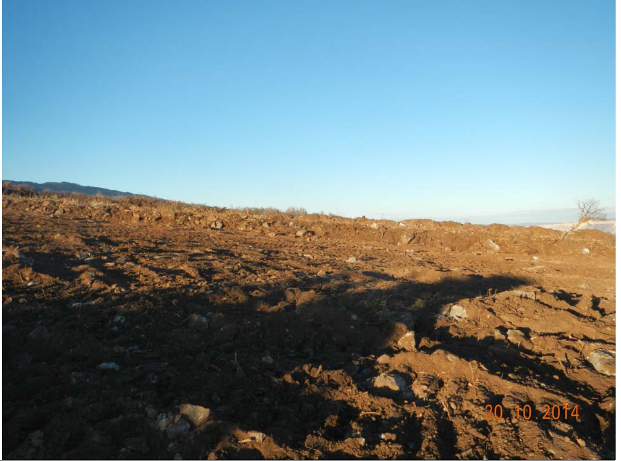
21. View from center of pad, looking West.