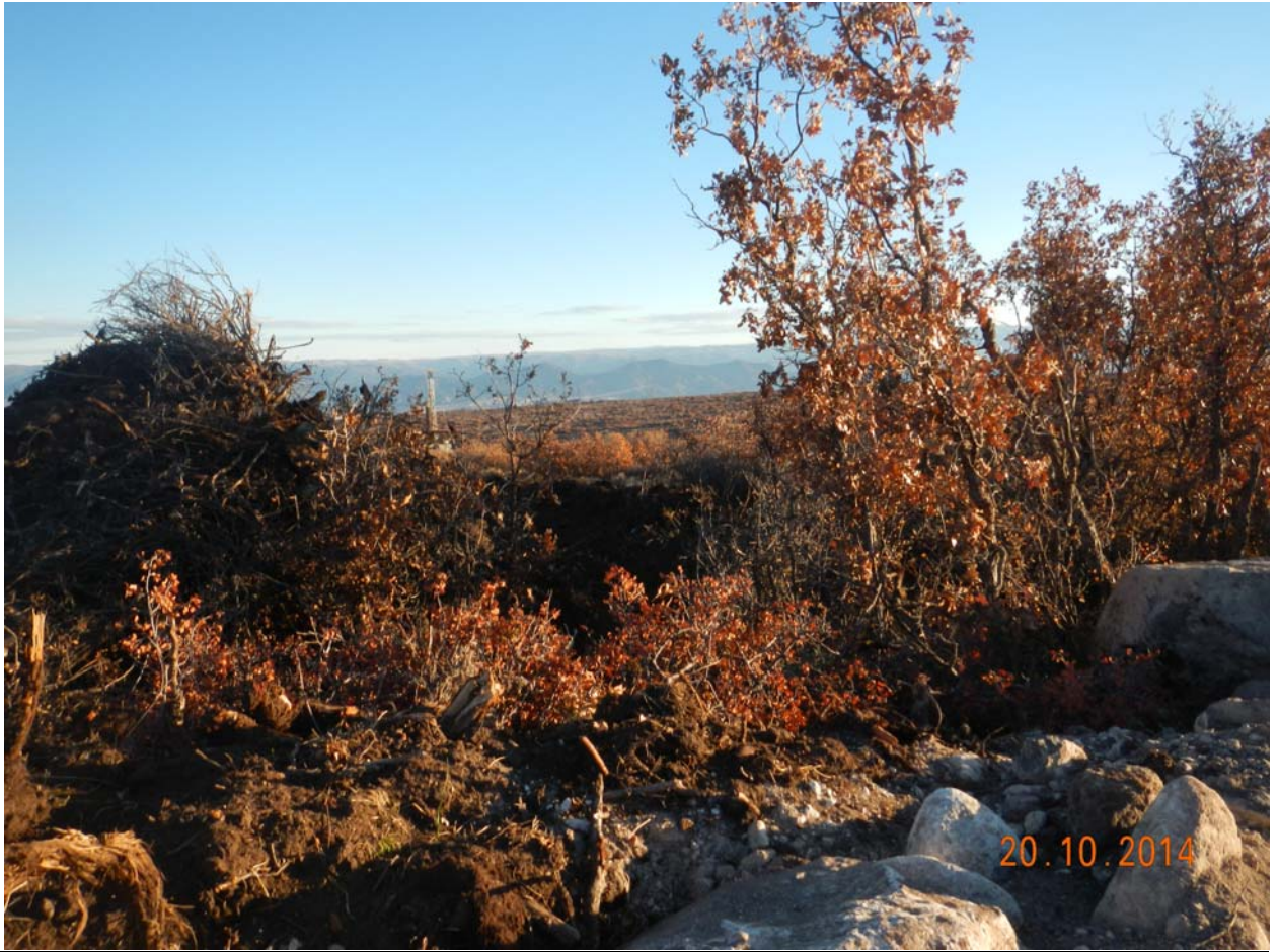
17. Pad eastern perimeter, viewed NE from entrance.