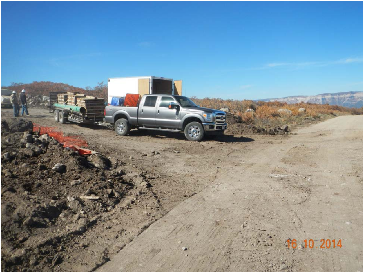
2. Location access road entrance, viewed NW from SE.