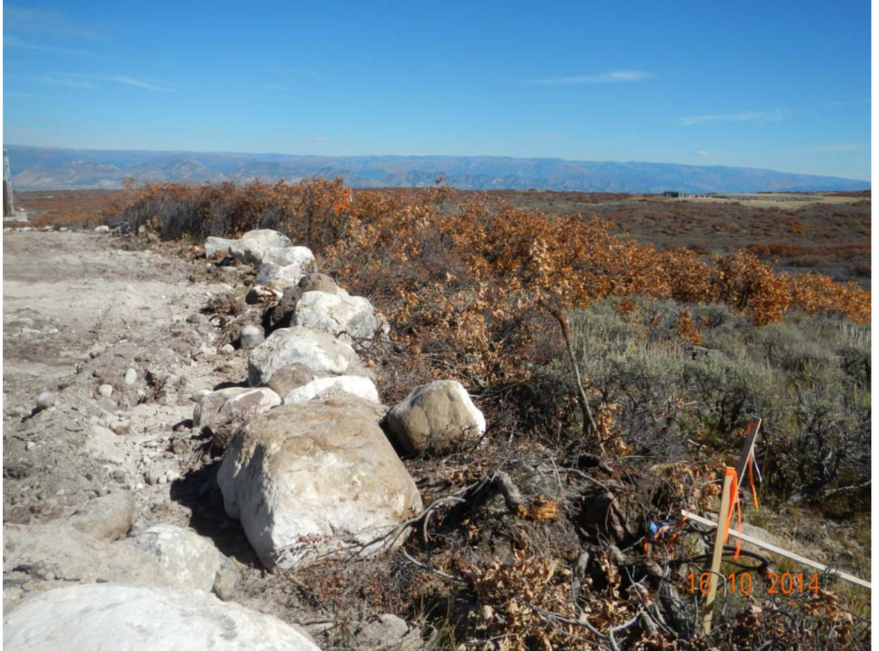
14. Location East perimeter, viewed North from South of entrance.