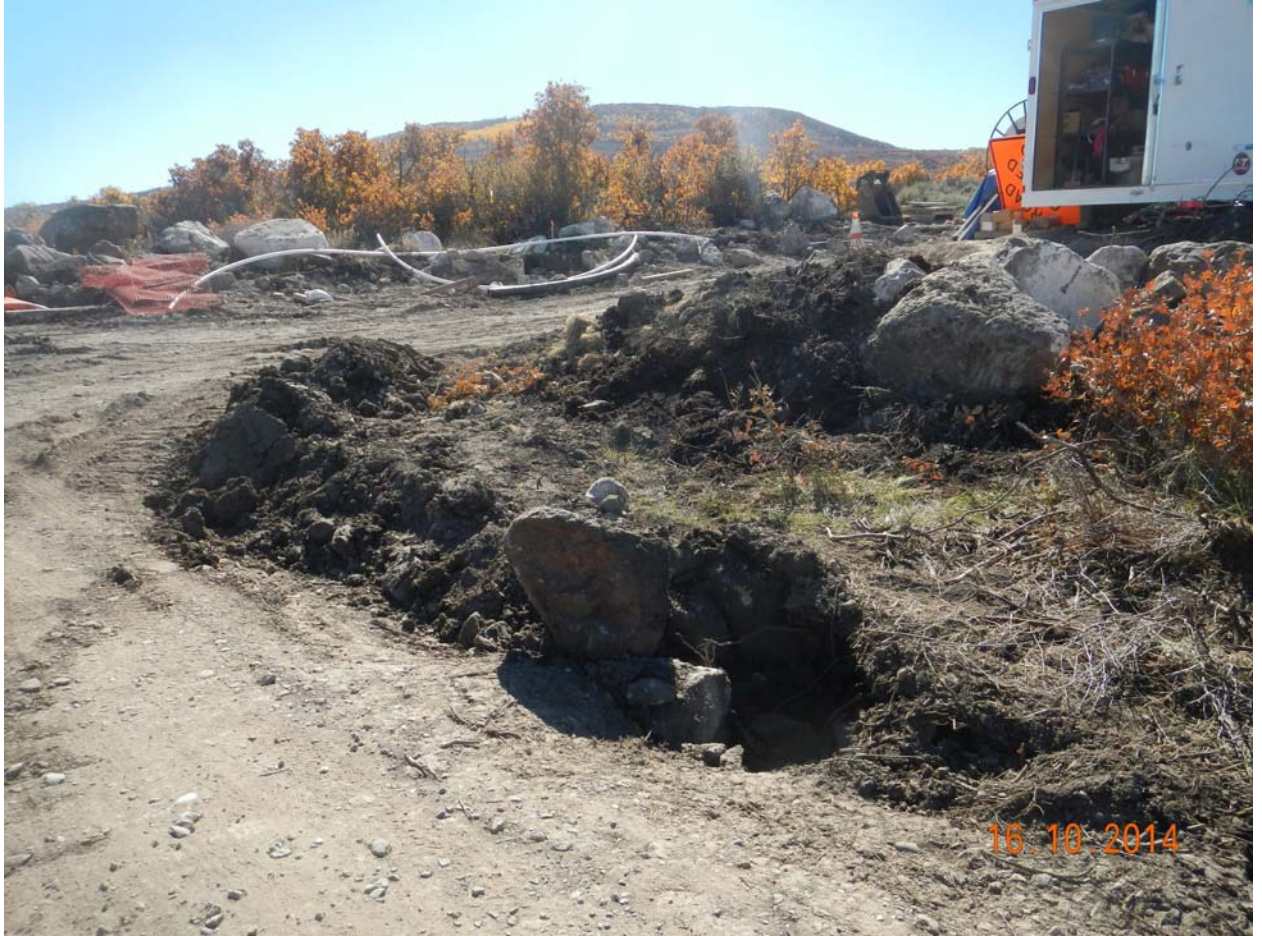
3. Location access road entrance, viewed SW from NE.