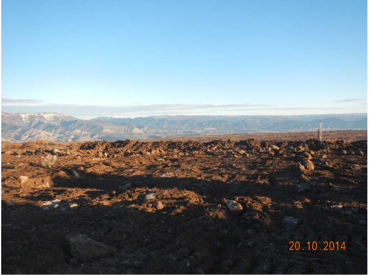
18. View from center of pad, looking North.