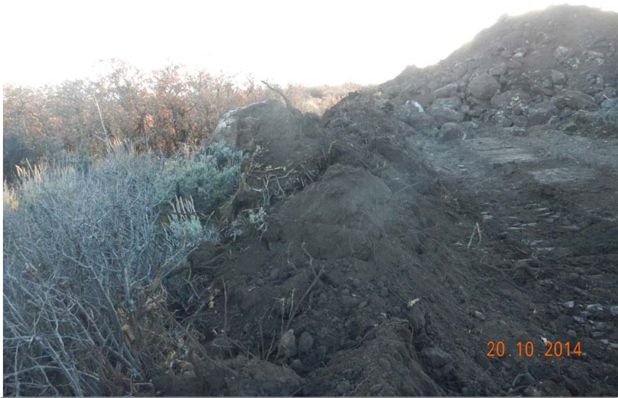
22. Northern perimeter and soil stockpile, viewed East from NW corner.