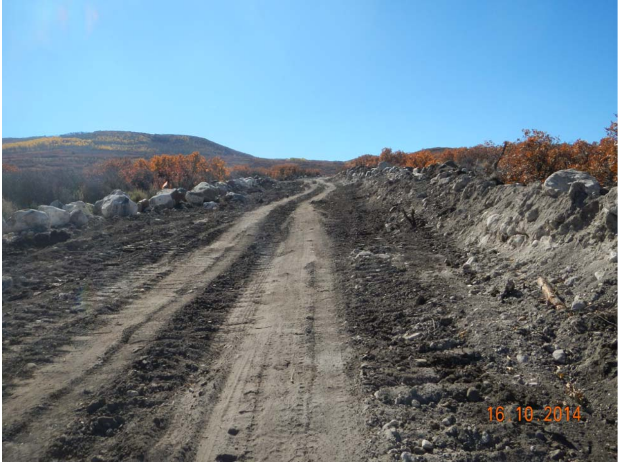
4. Location access road, viewed SW from NE.