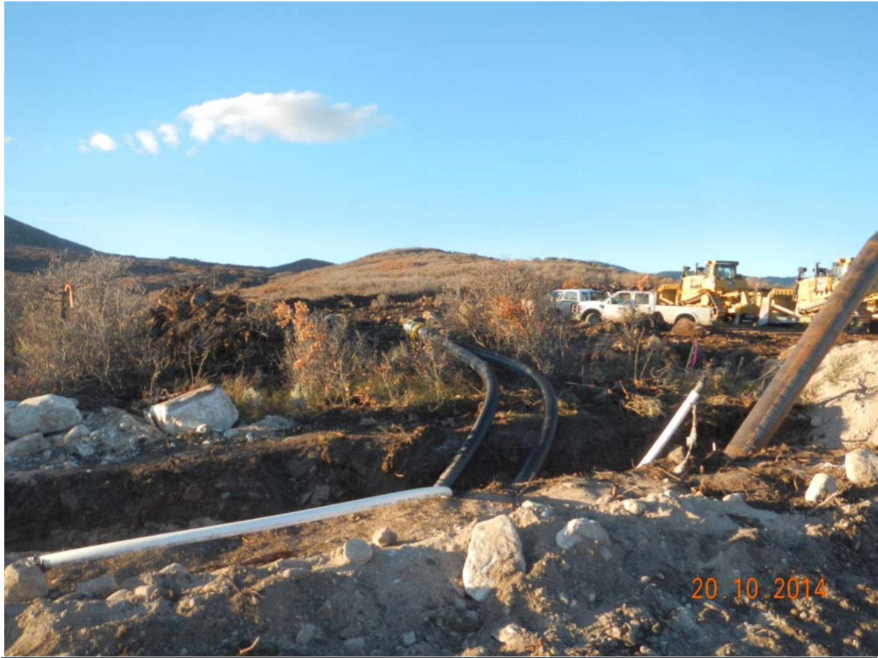
16. Pad eastern perimeter, viewed SW from entrance.