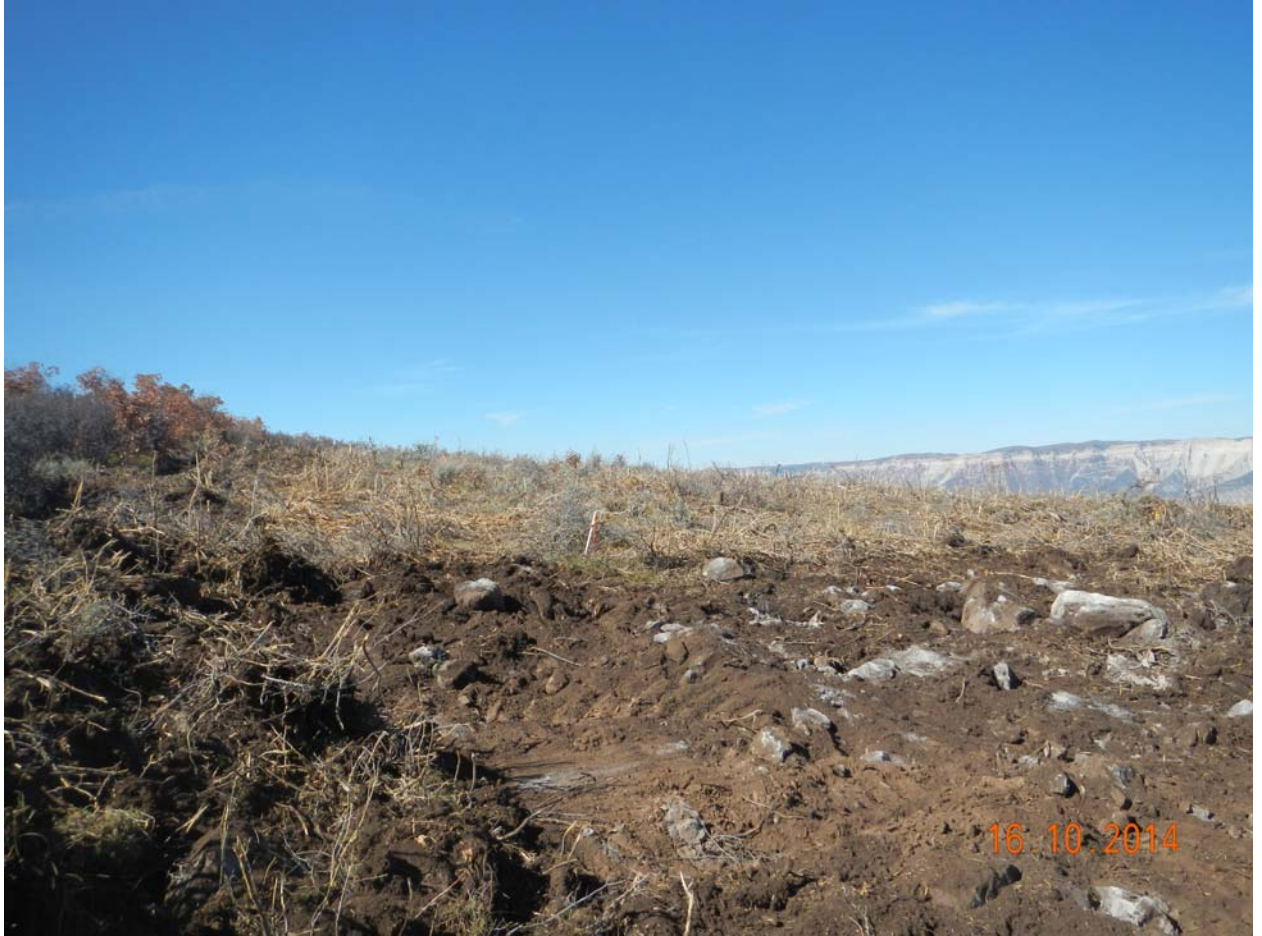
6. Location Eastern perimeter topsoil stripping, viewed South from South side of entrance.