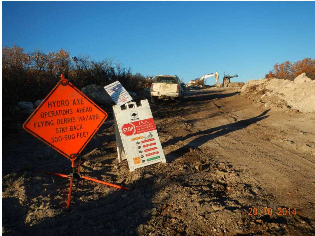
15. Pad entrance, viewed NE from SW.