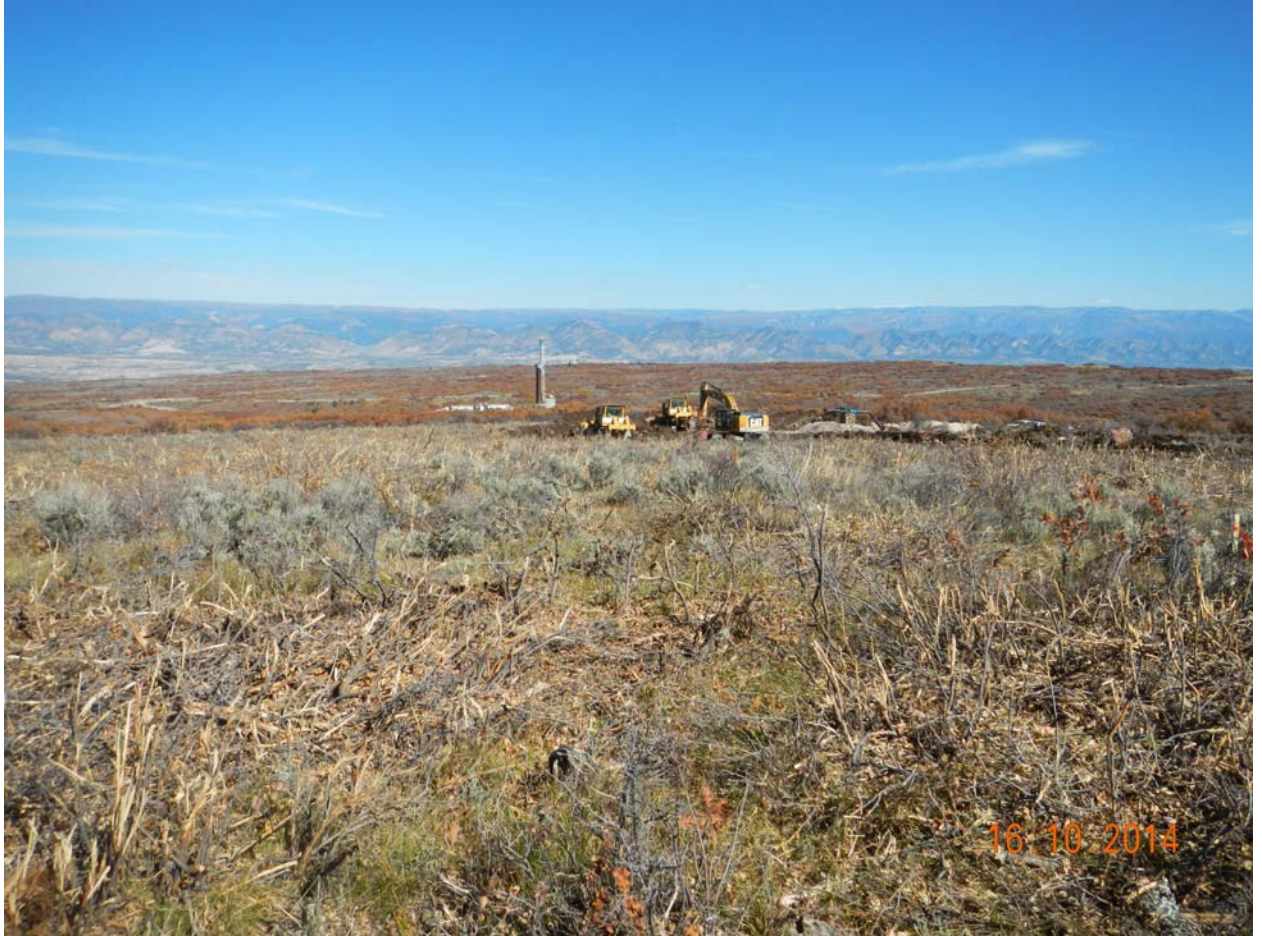
10. Location and brush hogging, viewed North from SE perimeter center.