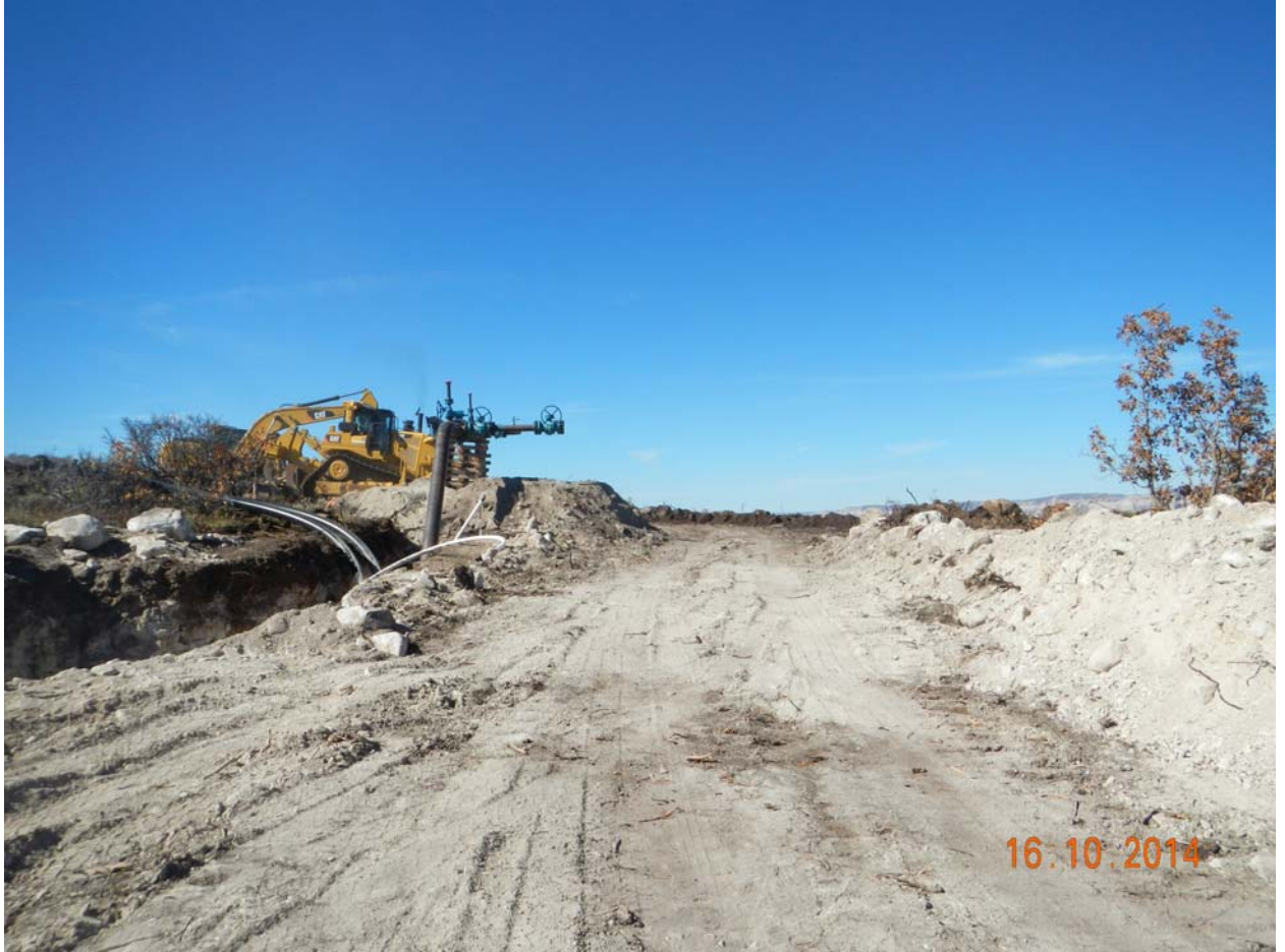
5. Location entrance, viewed West from East.