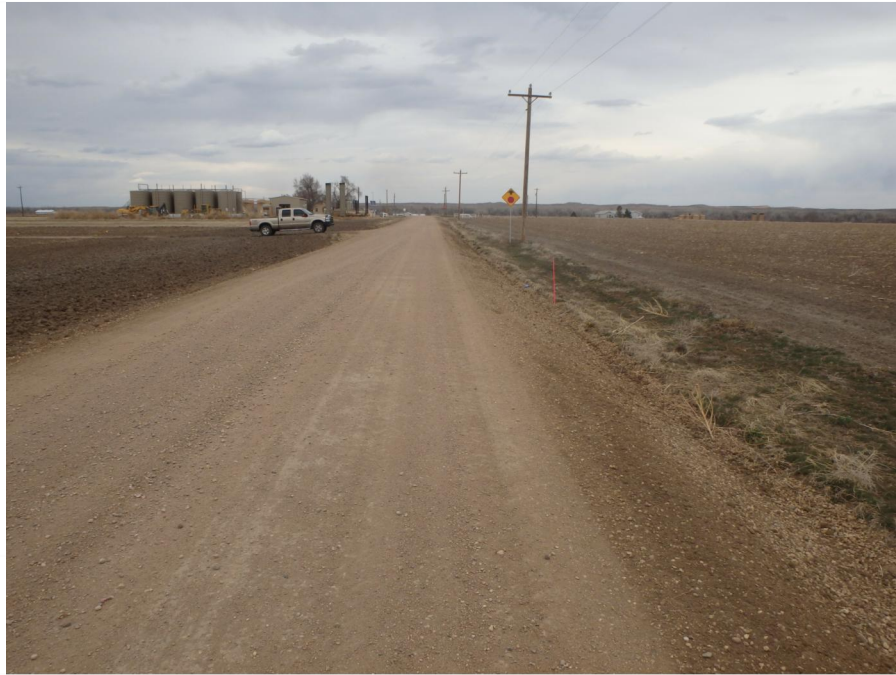
PHOTOGRAPH OF NORTH PLATTE A-33 PROPOSED ACCESS ROAD - CAMERA ANGLE NORTH