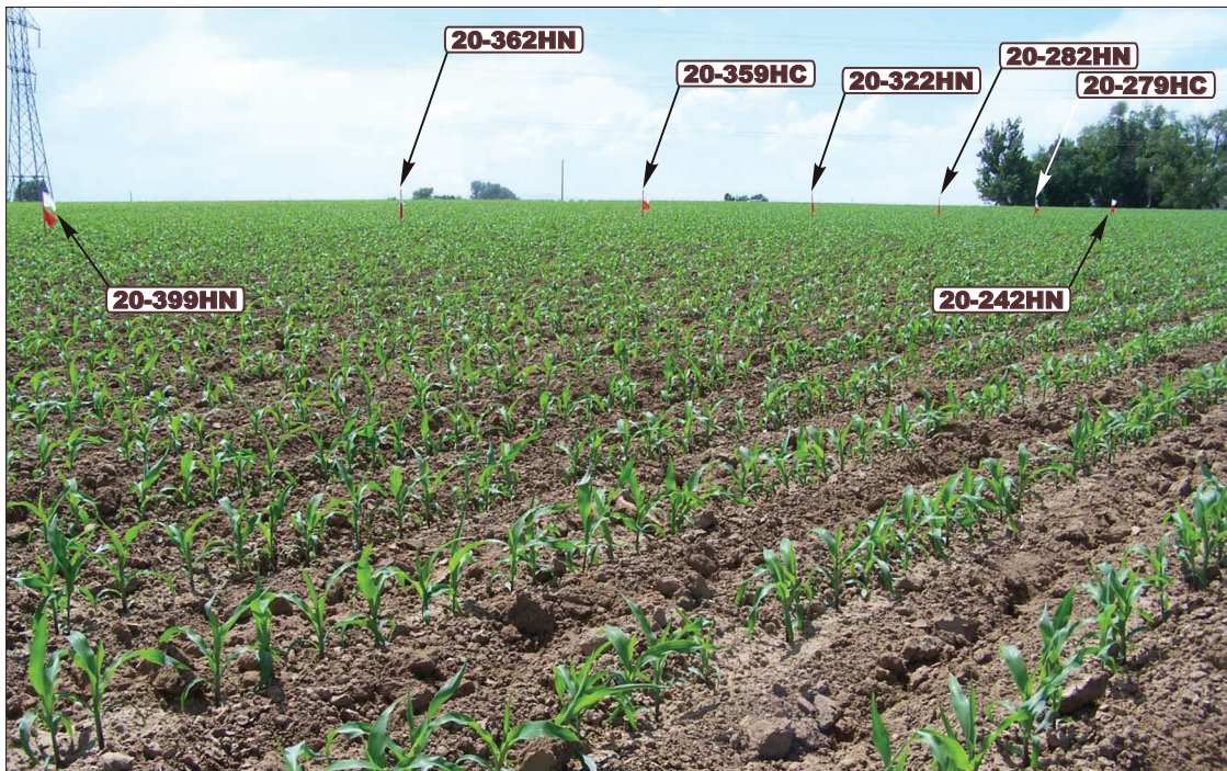
PHOTO: VIEW OF LOCATION STAKES