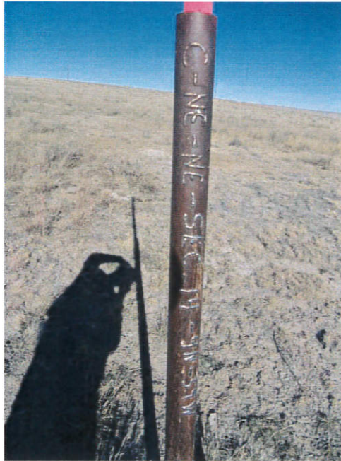
MARKER DETAIL (VIEW NORTH)