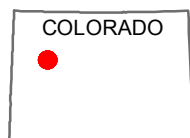
FIGURE 1 SITE LOCATION MAP EPPERLY 14C-23 GARFIELD COUNTY, COLORADO