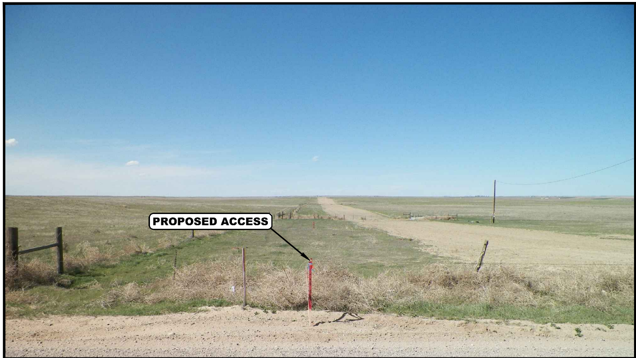
PHOTO: VIEW FROM BEGINNING OF PROPOSED ACCESS