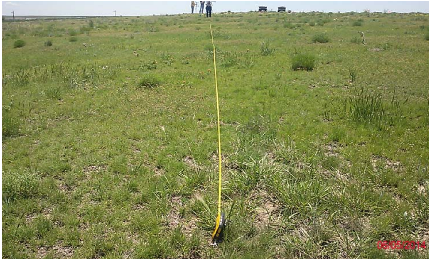
Outside Transect End view