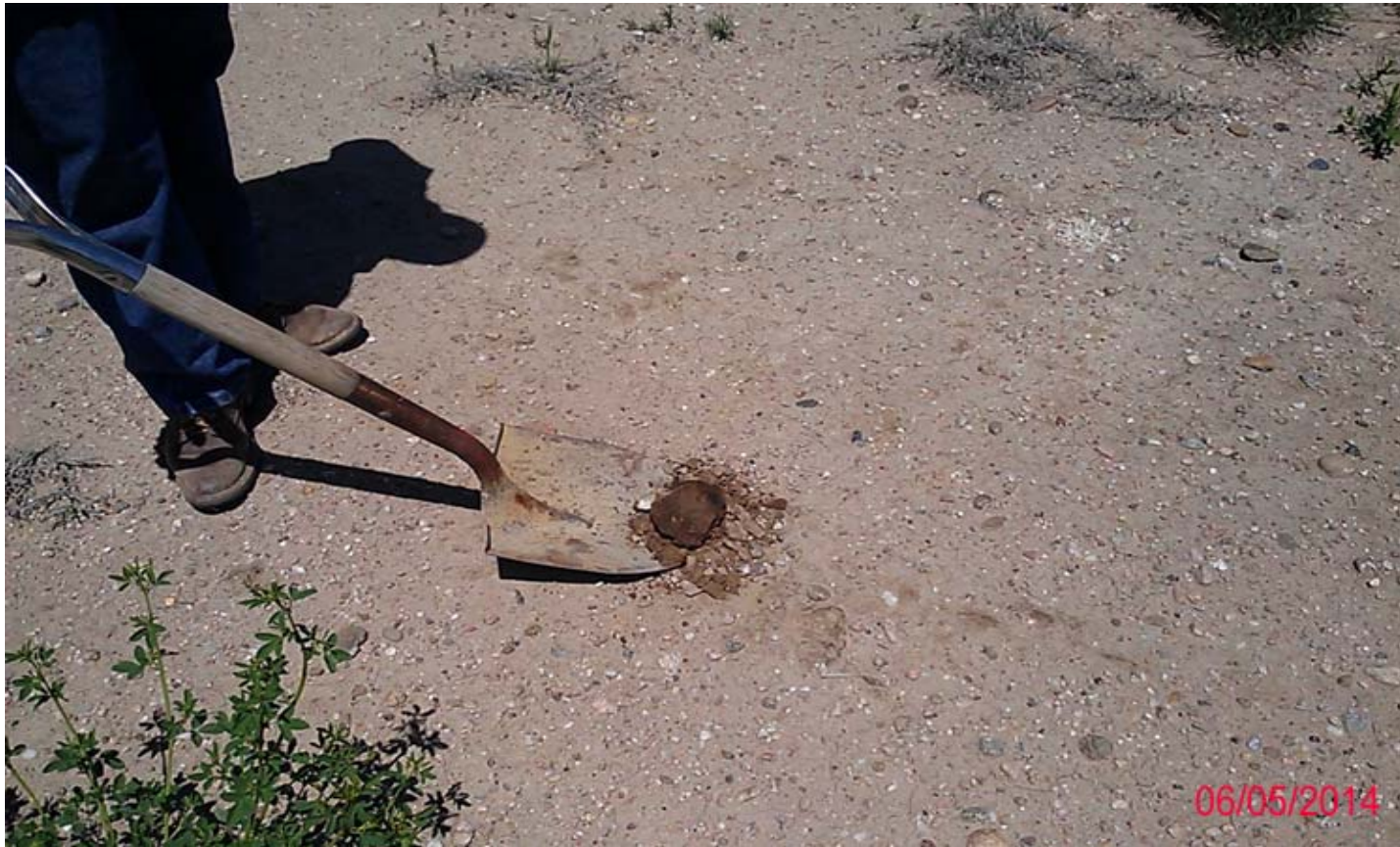
Oil soaked soil (5'x5' area approximately) view 1