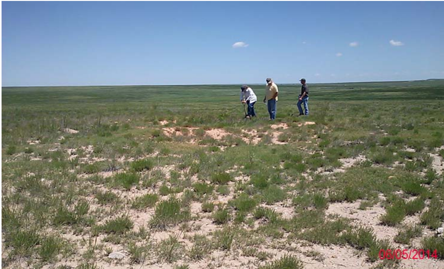
Discolored soil (12' 12' area approximately)