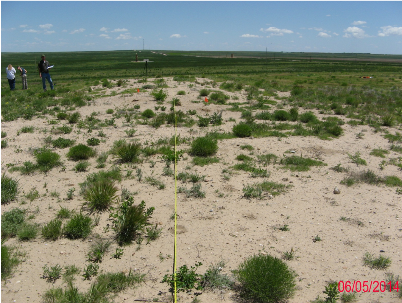
Inside Transect Midpoint Perpendicular view 1