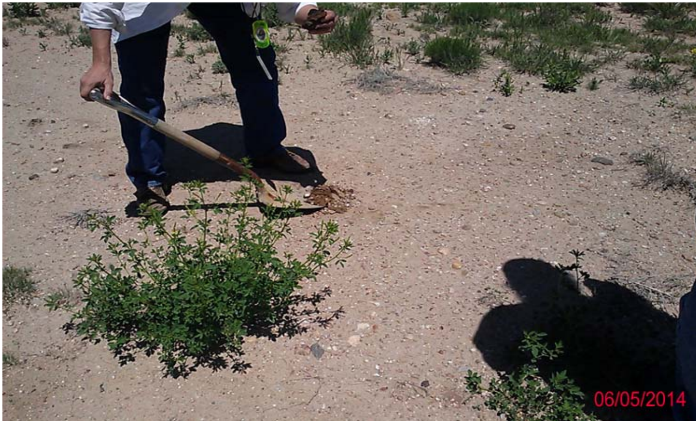
Oil soaked soil (5'x5' area approximately) view 1