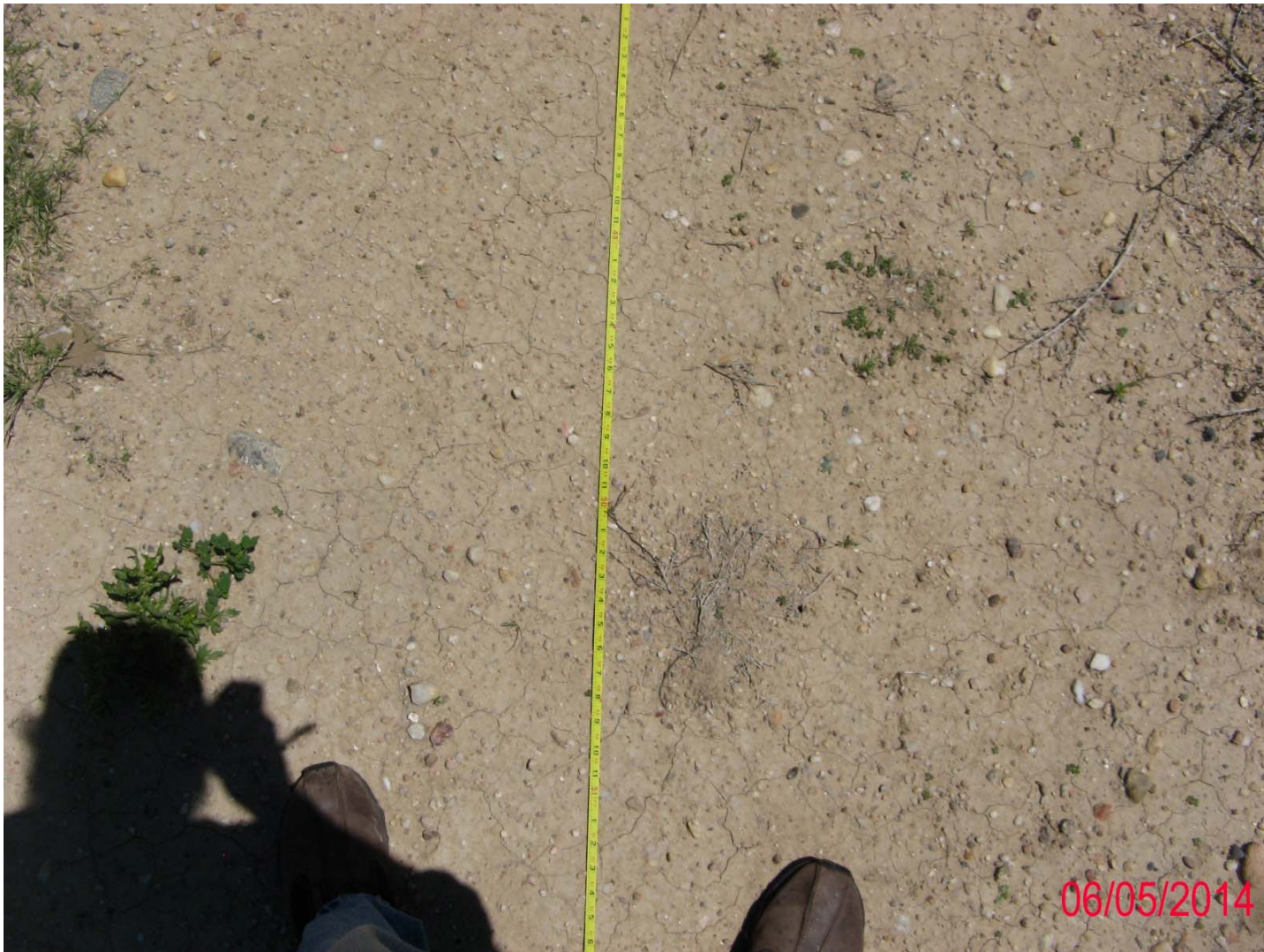
Inside Transect Midpoint ground cover