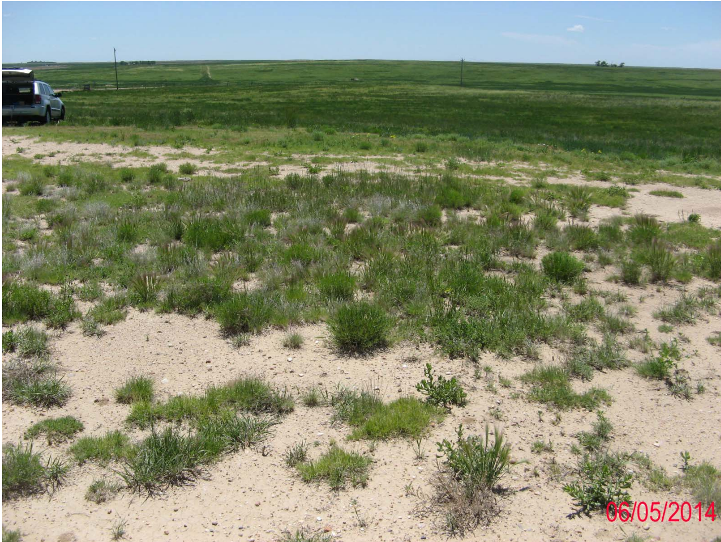
Inside Transect Midpoint Perpendicular view 2