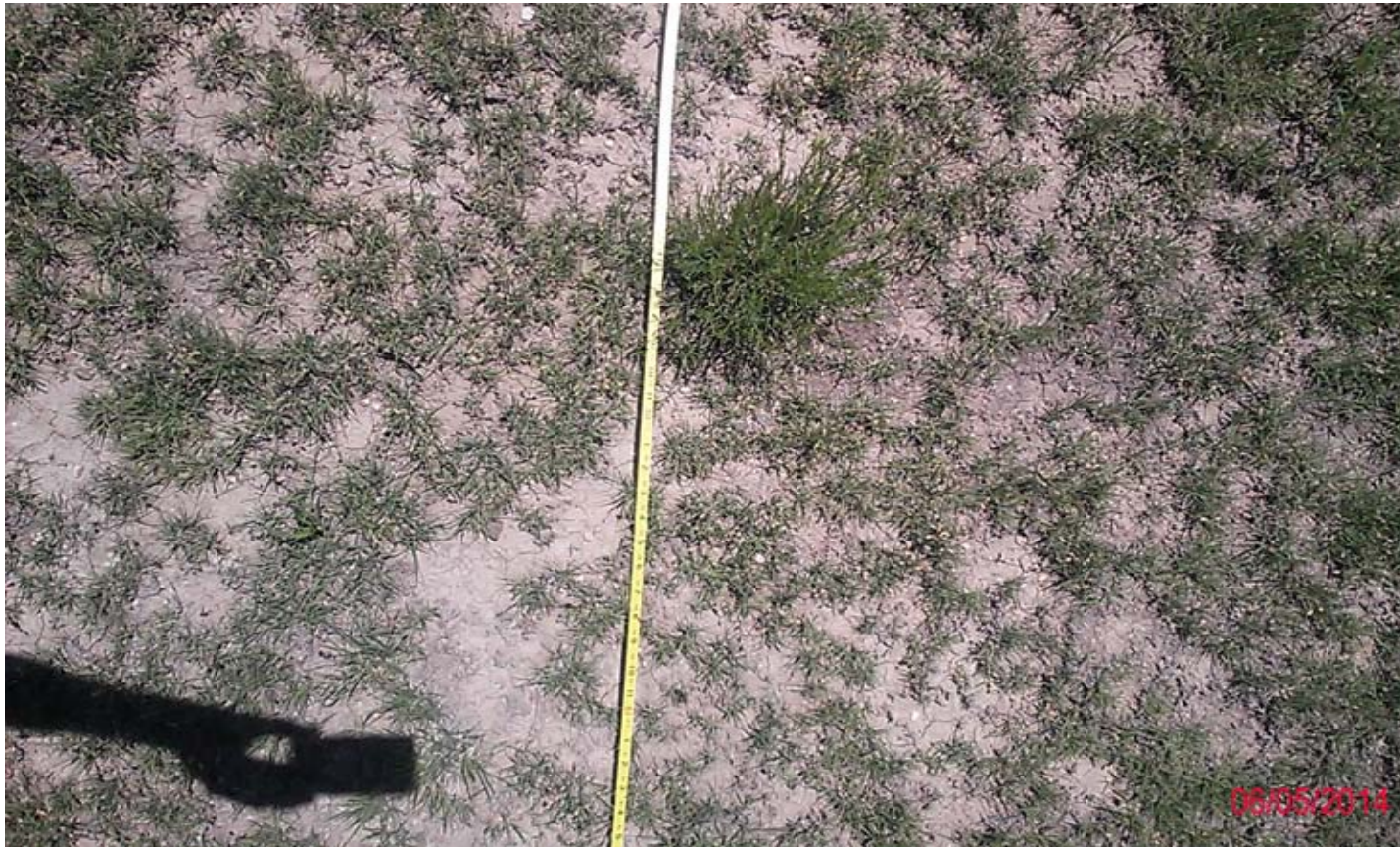
Outside Transect Midpoint groundcover