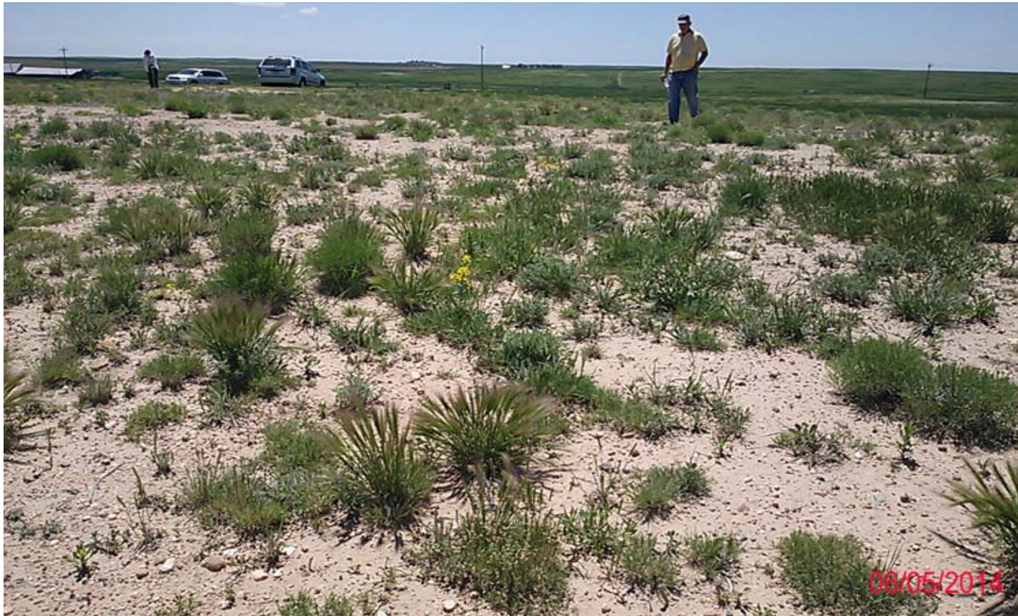
View of reclaimed pad