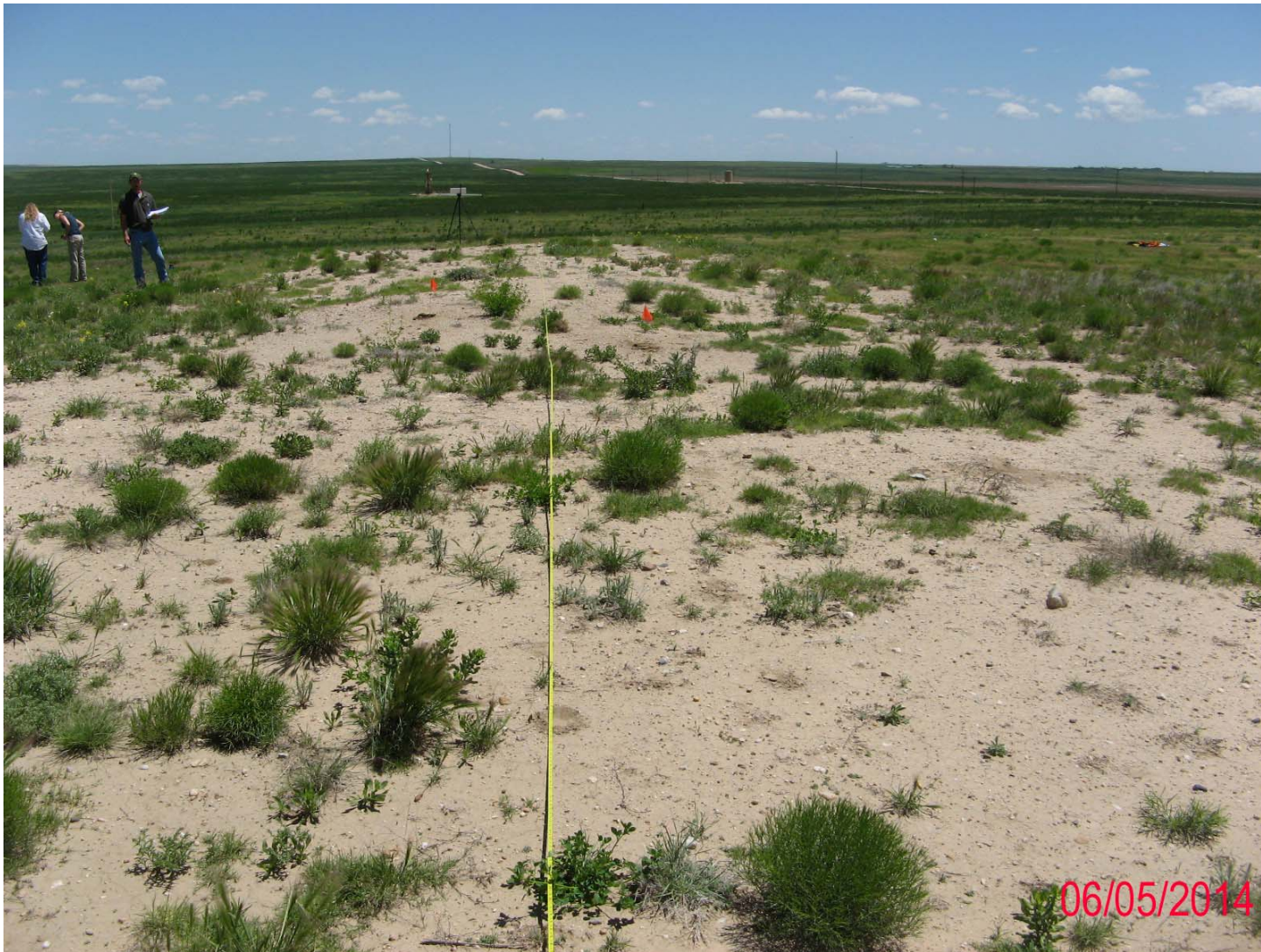
Inside Transect End view