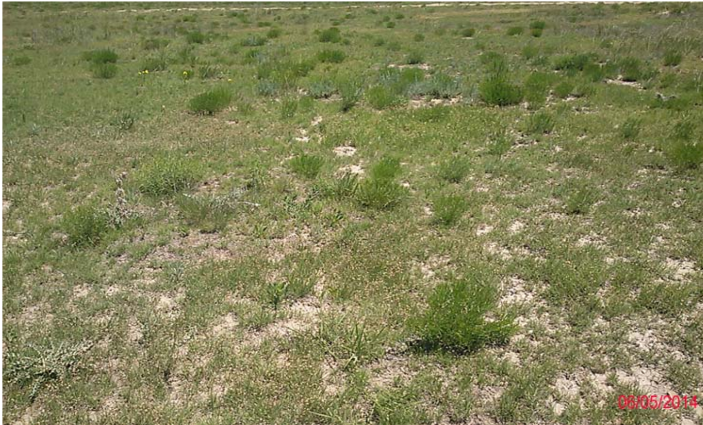
Outside Transect Midpoint parallel view 2