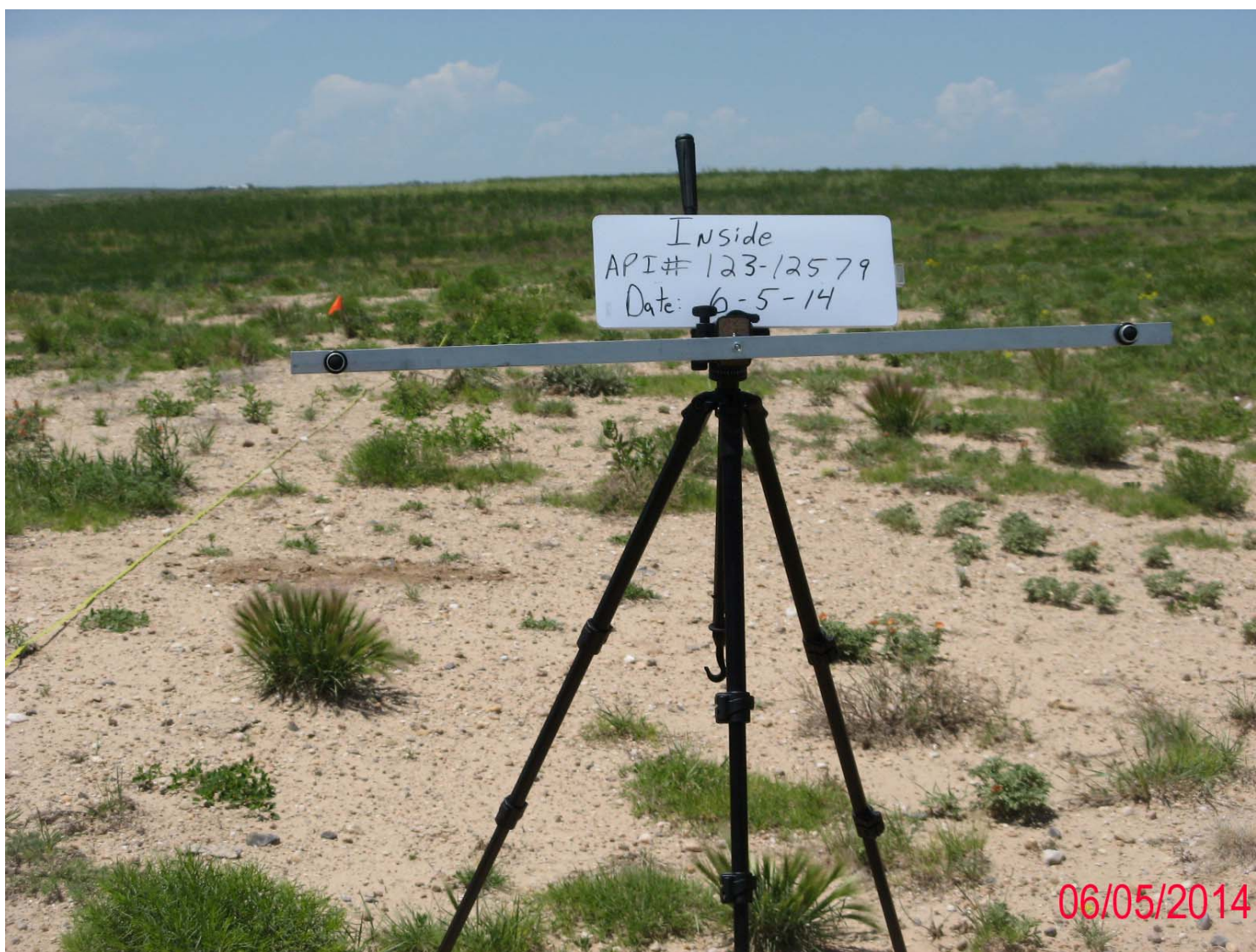
Inside Transect Beginning