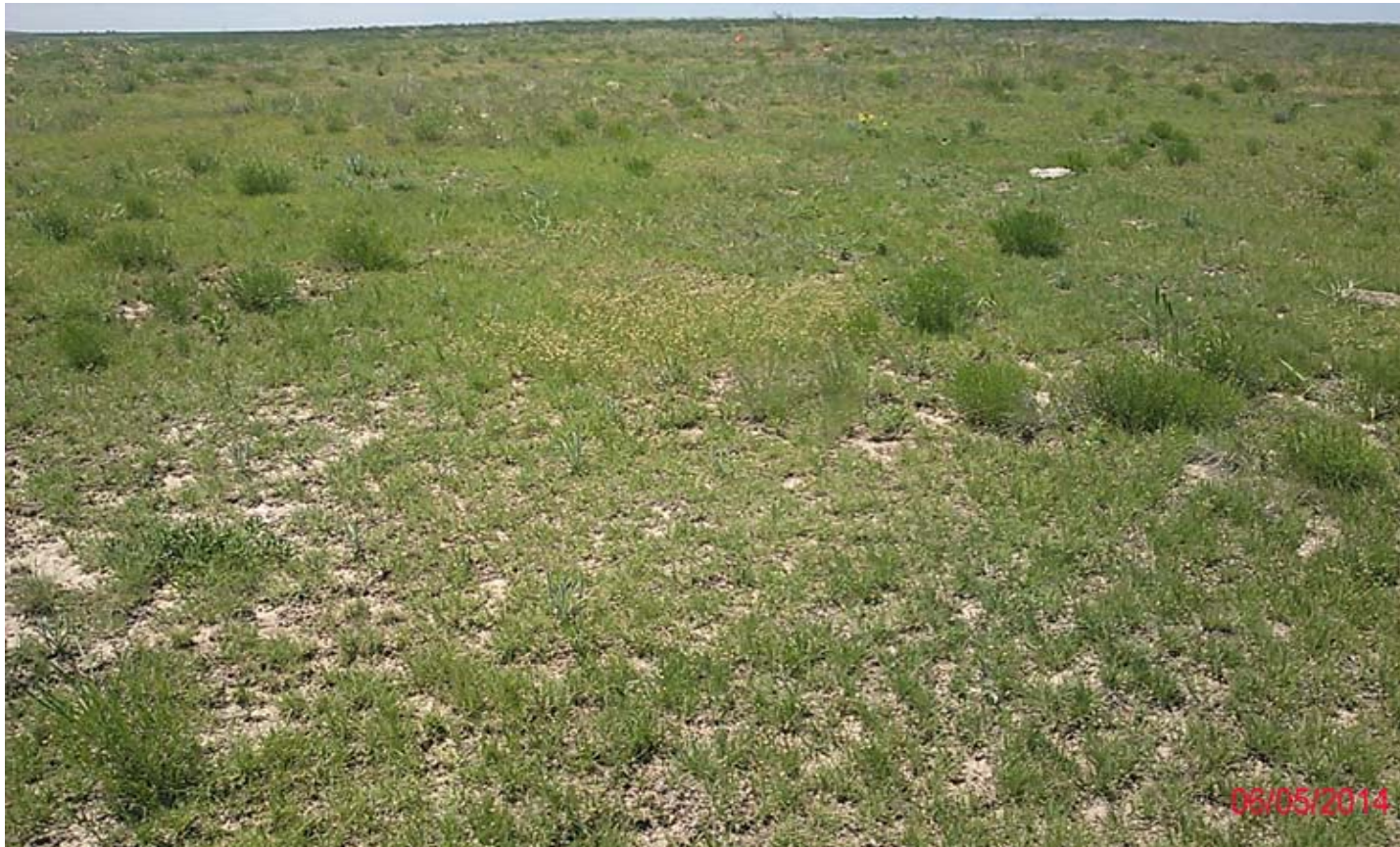
Outside Transect Midpoint parallel view 1