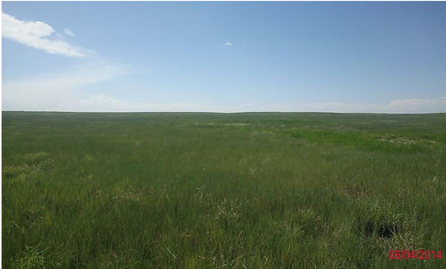
Outside Transect Midpoint Facing West