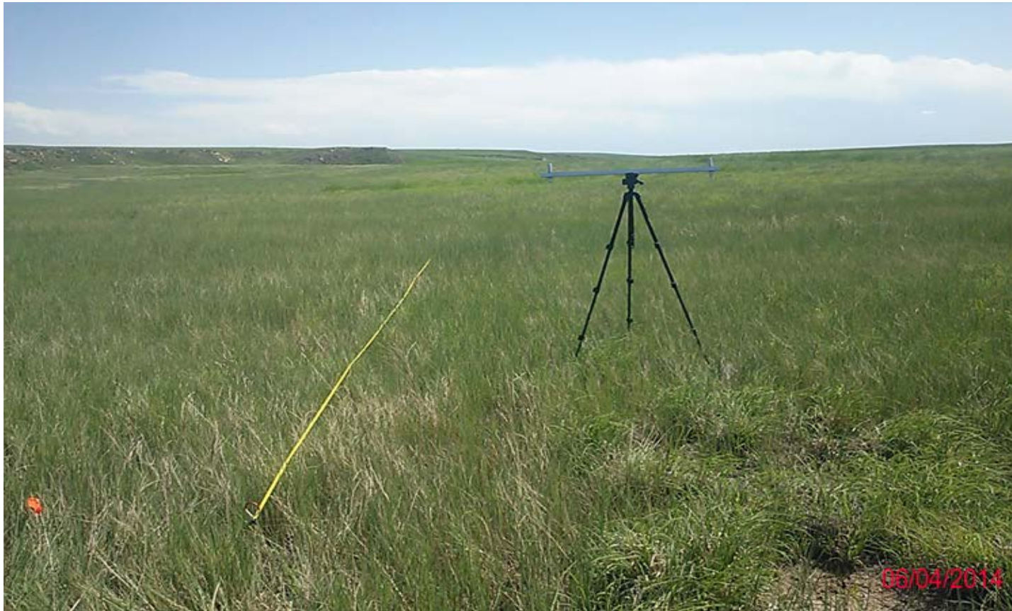
Outside Transect Beginning View Facing South