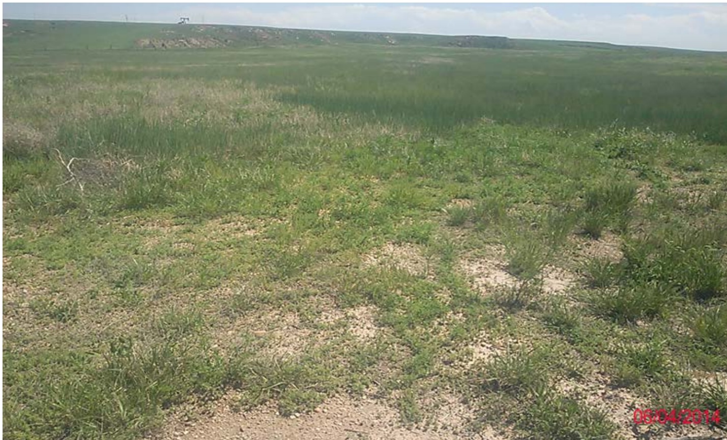
View of Reclaimed Pad (1)