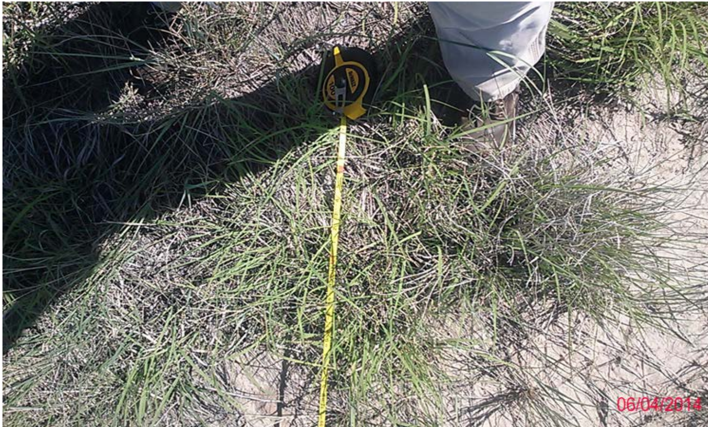
Inside Transect End View Groundcover