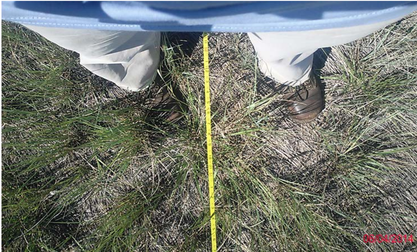
Outside Transect Midpoint Groundcover