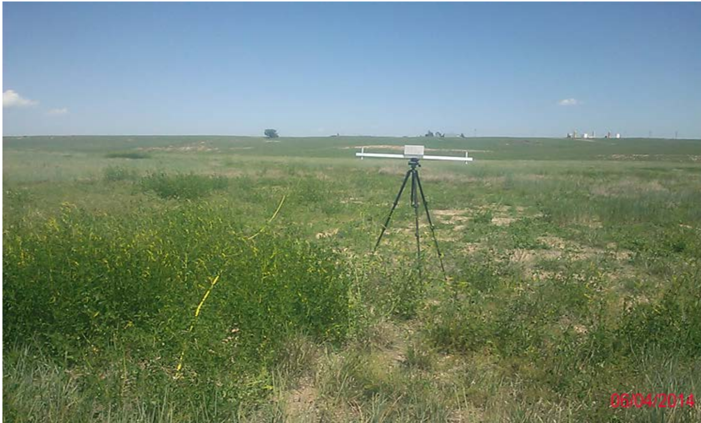
Inside Transect Beginning View Facing East