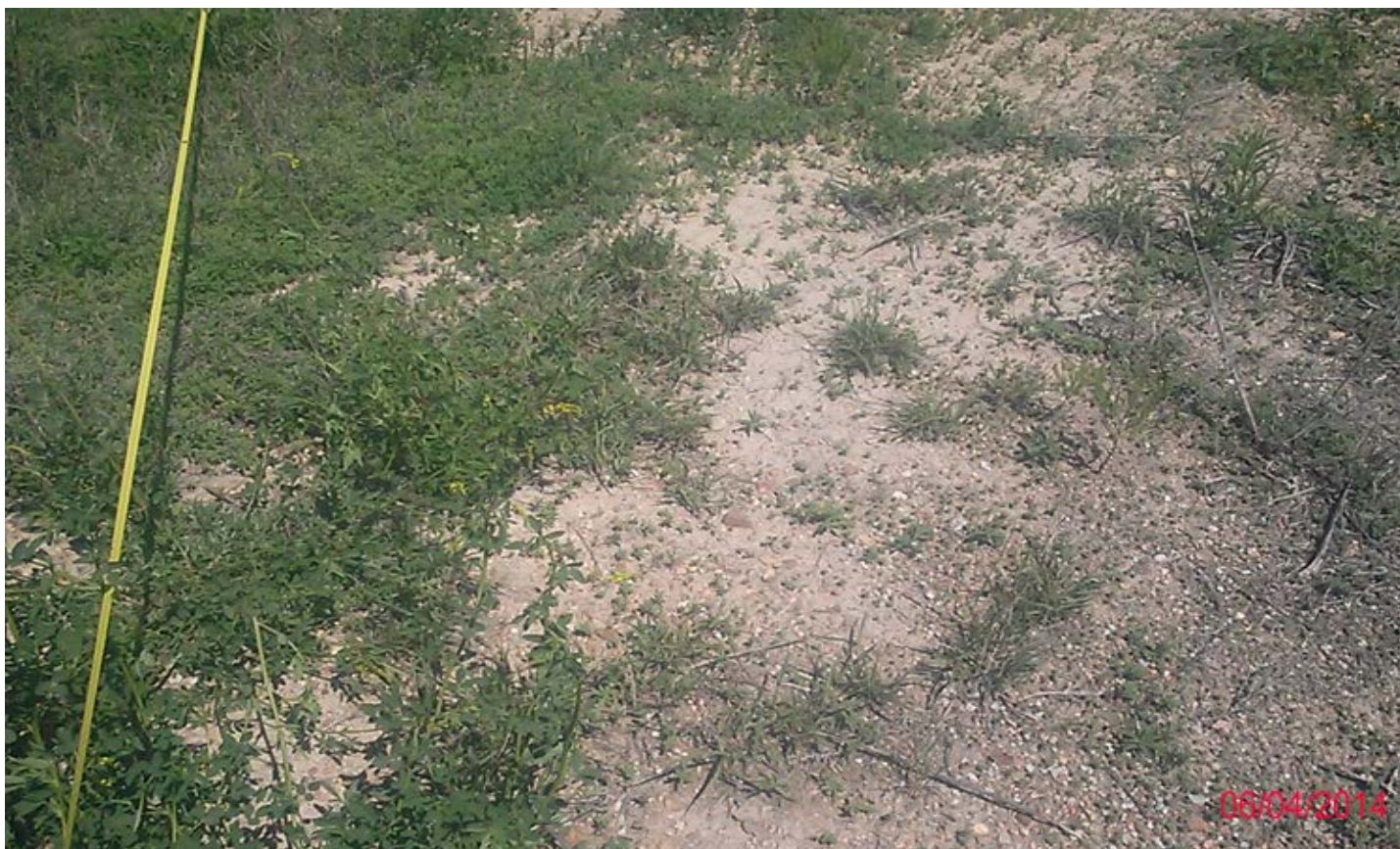
Inside Transect Midpoint Groundcover