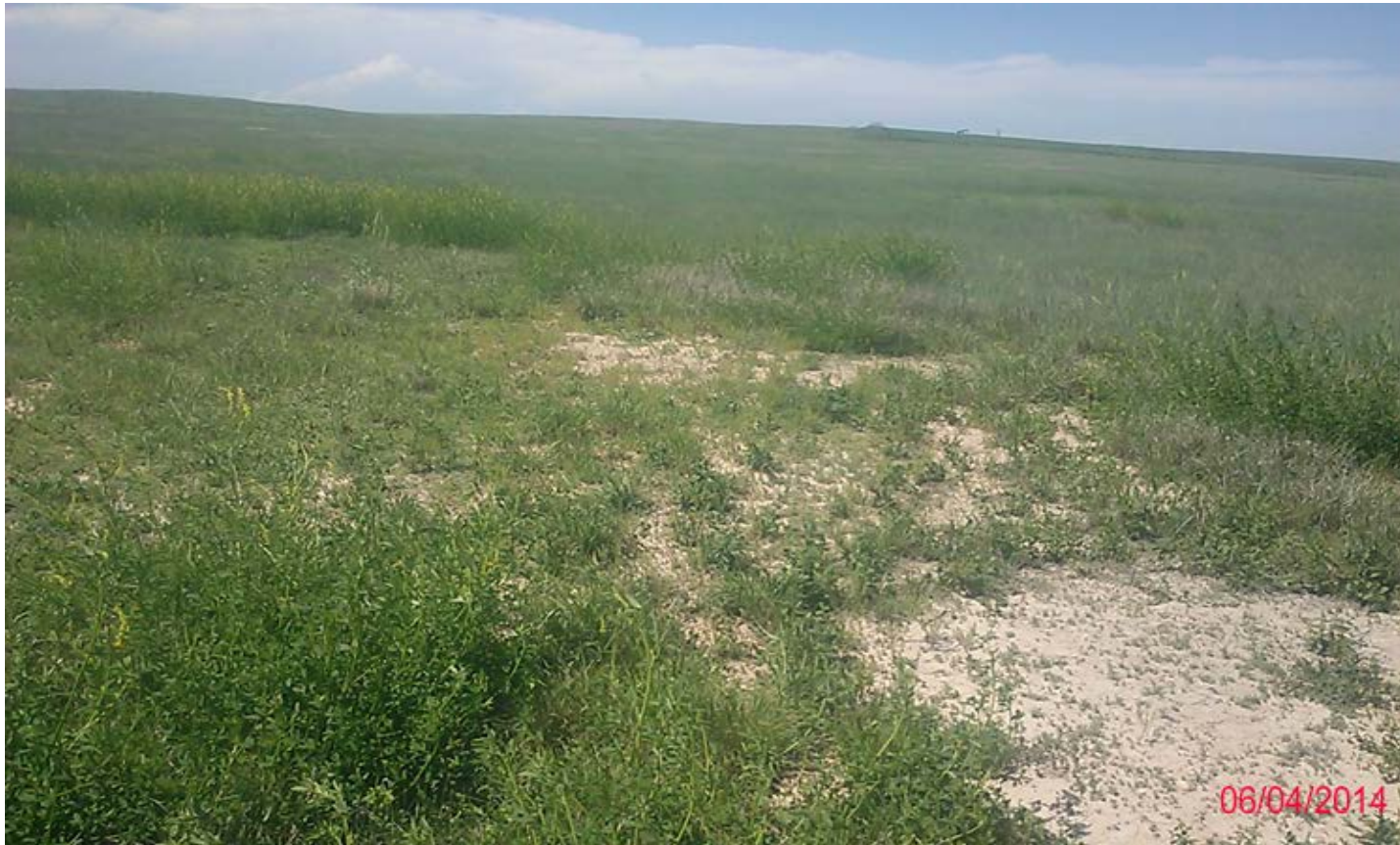
View of Reclaimed Pad (2)