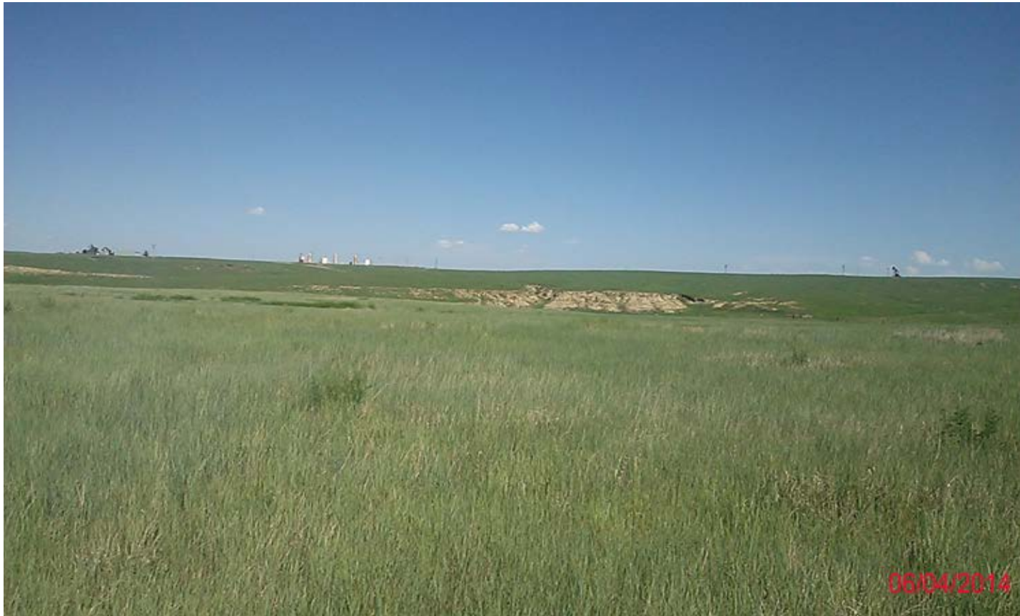
Outside Transect Midpoint Facing East