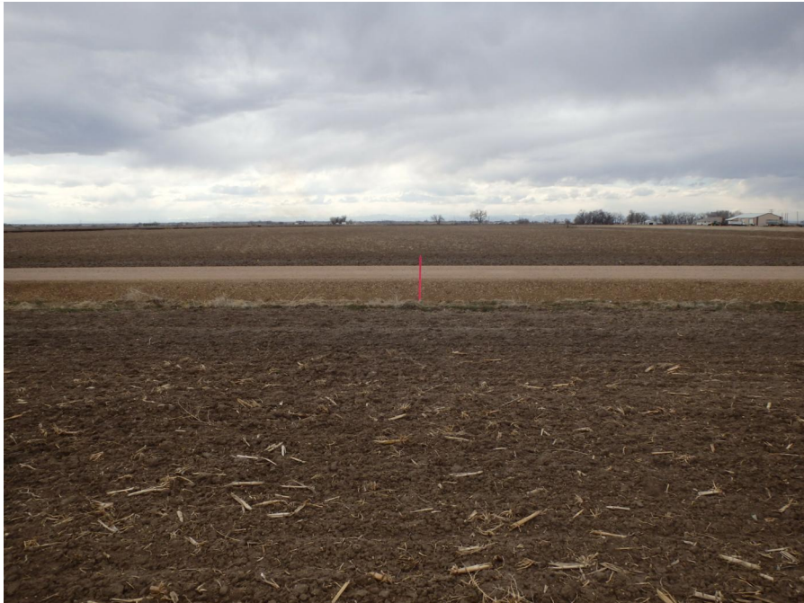
PHOTOGRAPH OF NORTH PLATTE A-33 PROPOSED ACCESS ROAD - CAMERA ANGLE WEST