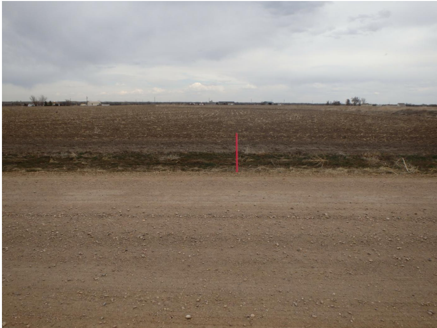
PHOTOGRAPH OF NORTH PLATTE A-33 PROPOSED ACCESS ROAD - CAMERA ANGLE EAST