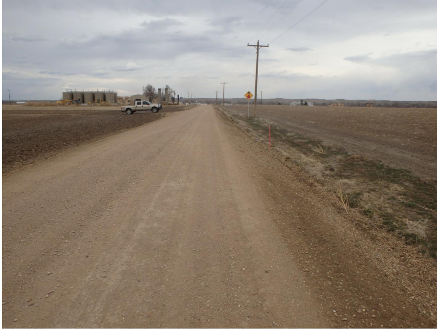
PHOTOGRAPH OF NORTH PLATTE A-33 PROPOSED ACCESS ROAD - CAMERA ANGLE NORTH