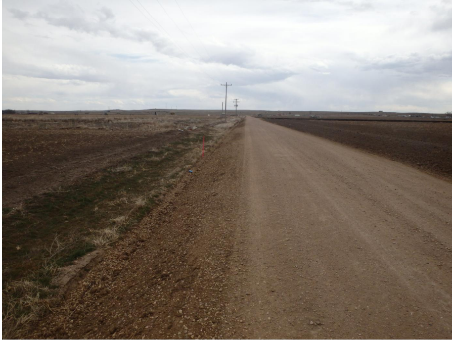
PHOTOGRAPH OF NORTH PLATTE A-33 PROPOSED ACCESS ROAD - CAMERA ANGLE SOUTH