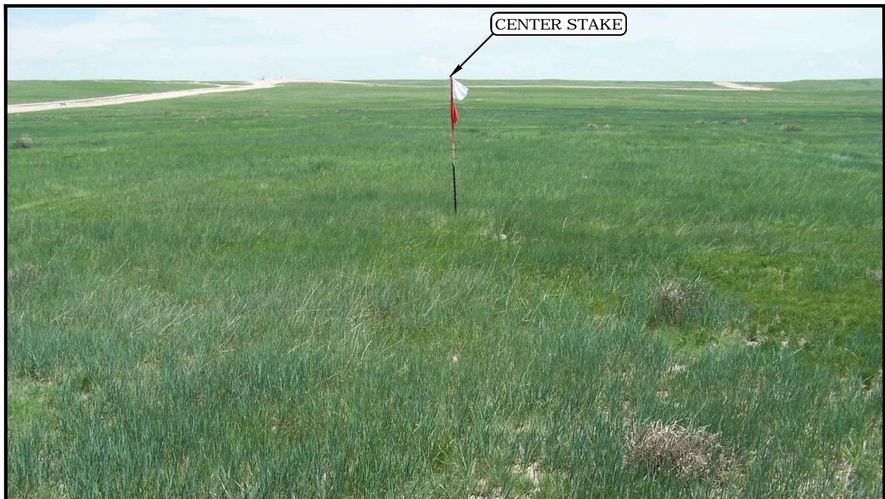
PHOTO: VIEW OF CENTER STAKE