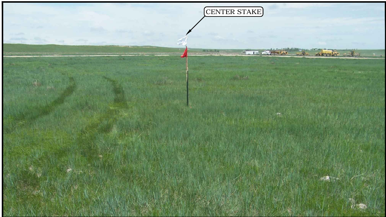
PHOTO: VIEW OF CENTER STAKE