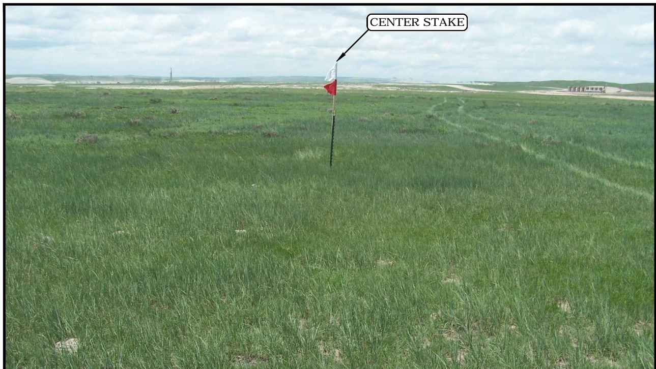
PHOTO: VIEW OF CENTER STAKE