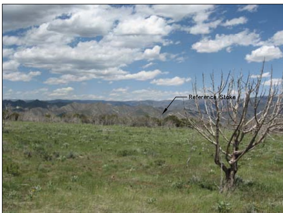
Looking North toward Reference Point May 21, 2010