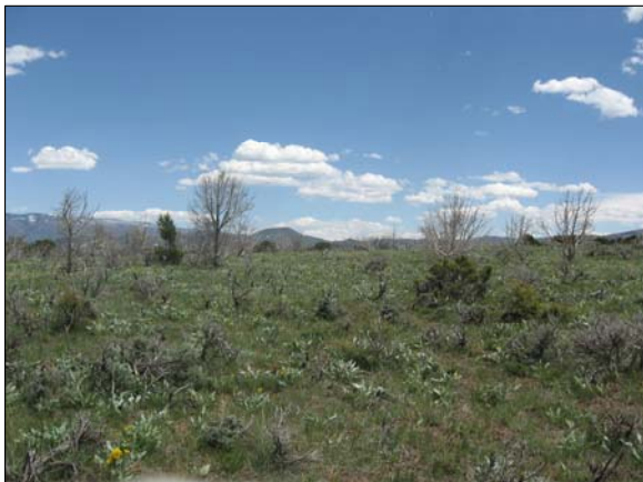
Looking East toward Reference Point May 21, 2010