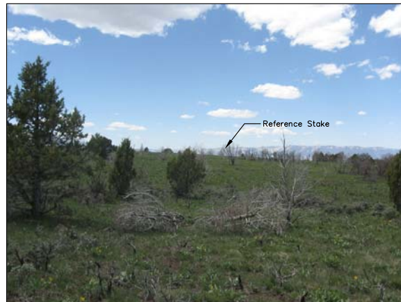
Looking West toward Reference Point May 21, 2010