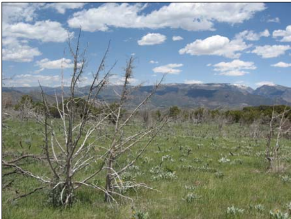
Looking North from Reference Point May 21, 2010