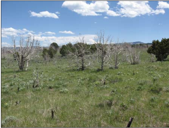
Looking East from Reference Point May 21, 2010