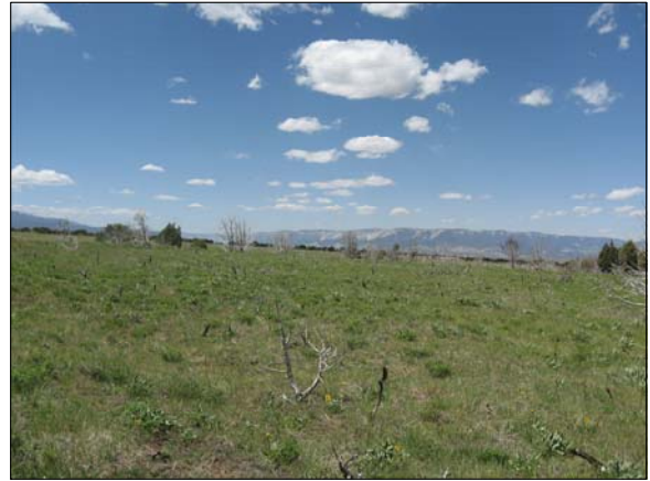
Looking West from Reference Point May 21, 2010