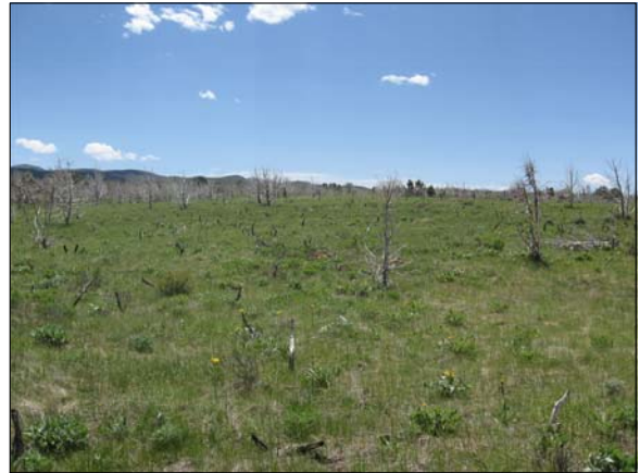
Looking South from Reference Point May 21, 2010