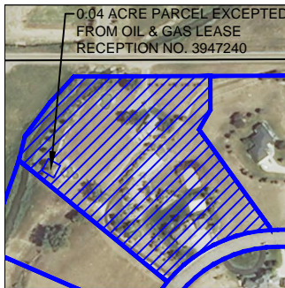
DETAIL "A" SCALE - 1"=500'