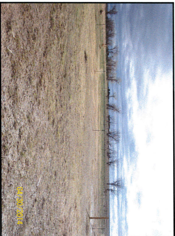
Cooke 34-35, looking NE