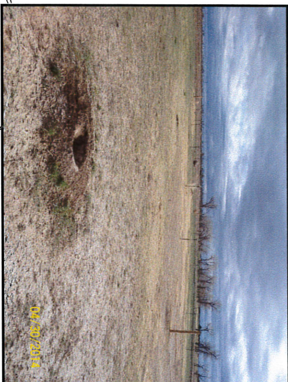
Cooke 34-35, looking north