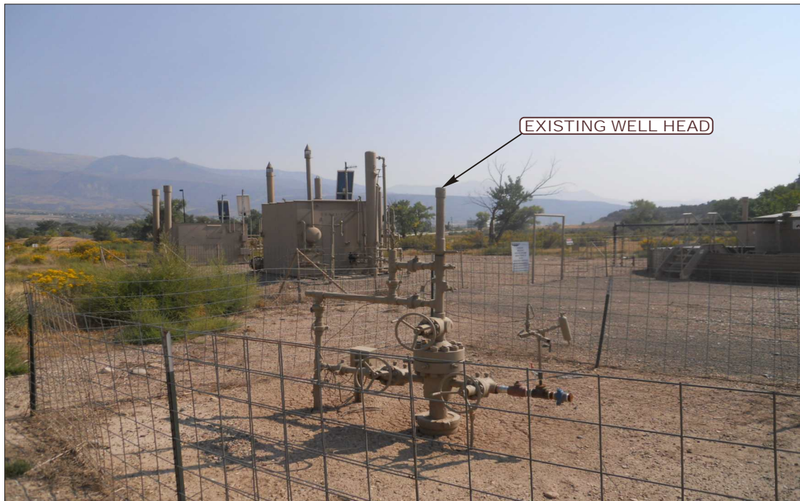
PHOTO: VIEW OF EXISTING WELL HEAD

LOCATED IN GARFIELD COUNTY, COLORADO SECTION 12, T7S, R96W, 6th P.M.