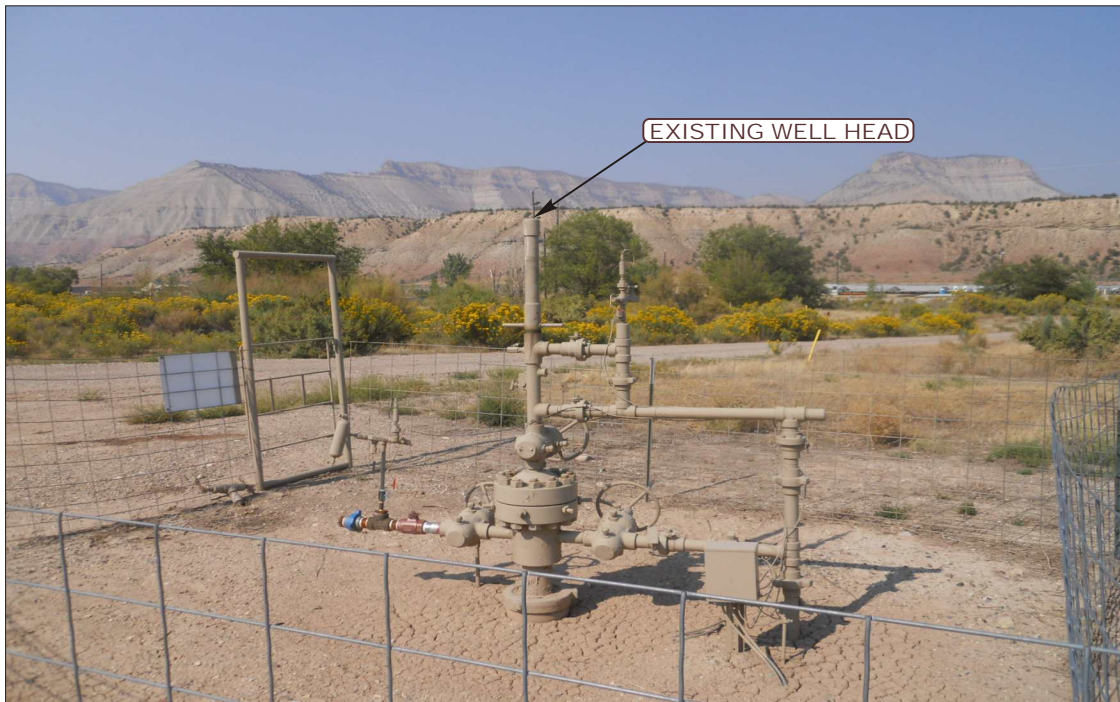
PHOTO: VIEW OF EXISTING WELL HEAD

LOCATED IN GARFIELD COUNTY, COLORADO SECTION 12, T7S, R96W, 6th P.M.