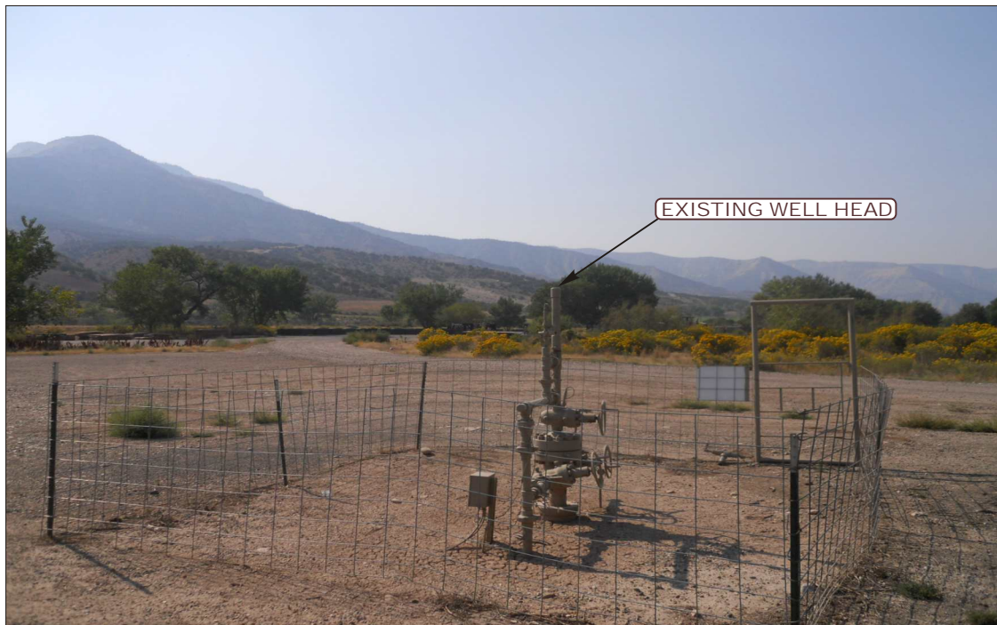
PHOTO: VIEW OF EXISTING WELL HEAD