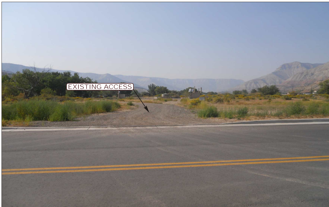
PHOTO: VIEW FROM BEGINNING OF EXISTING ACCESS