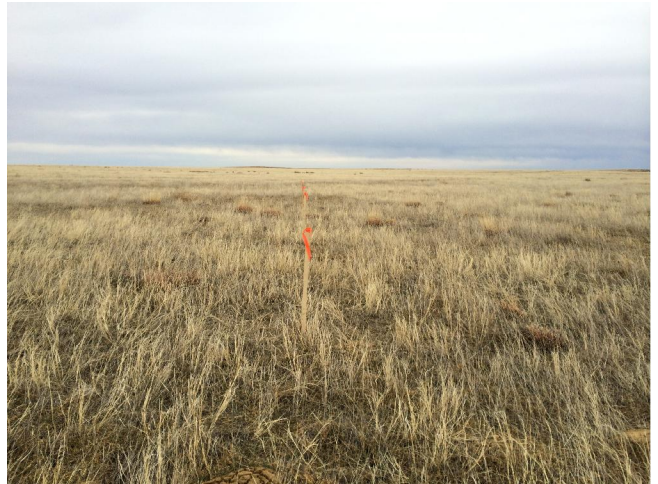
LOCATION LOOKING SOUTH