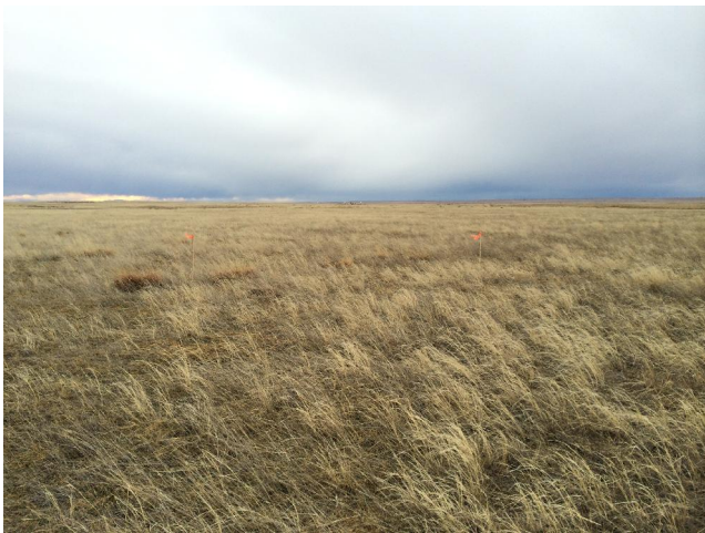
LOCATION LOOKING WEST