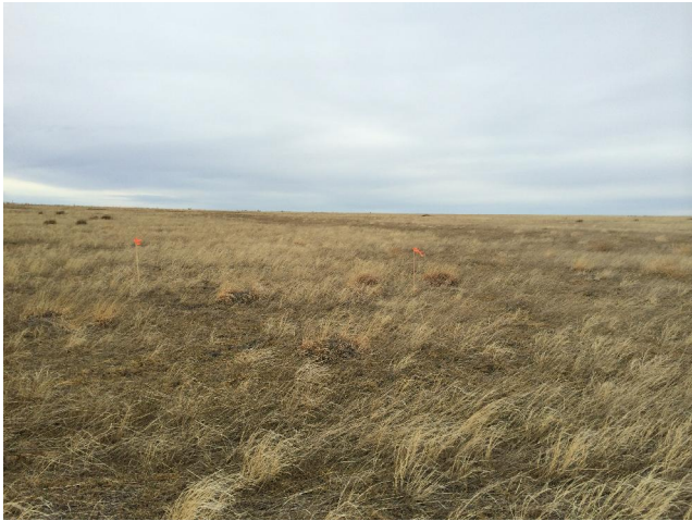
LOCATION LOOKING EAST

C:\FES PROJECTS\1319-01_BONANZA\5N-61W\dwg\MAP24_5-61.dwg SAVED DATE 2014-03-21 14:17