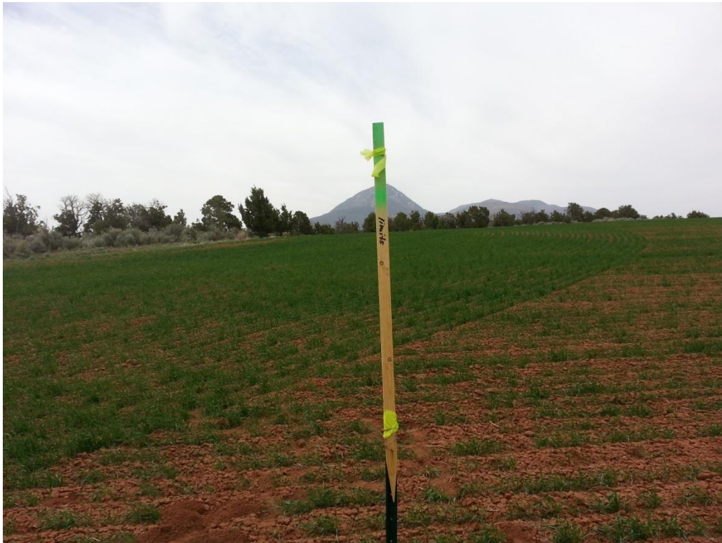
Photo 3: Reference Point Looking South (Taken: 04-23-2014)