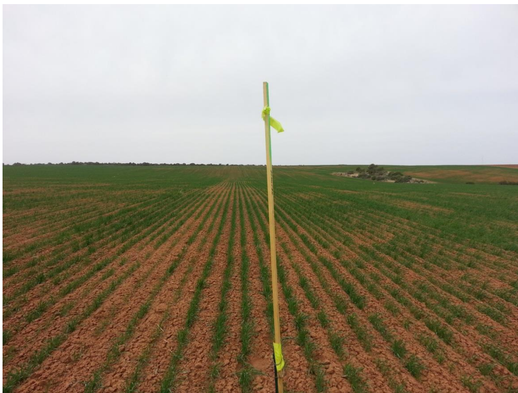
Photo 4: Reference Point Looking West (Taken: 04-23-2014)