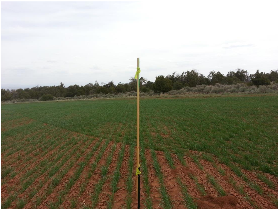
Photo 2: Reference Point Looking East (Taken: 04-23-2014)