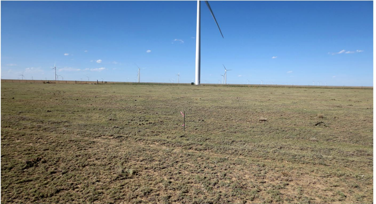
WELL PAD VIEW (LOOKING NORTH)