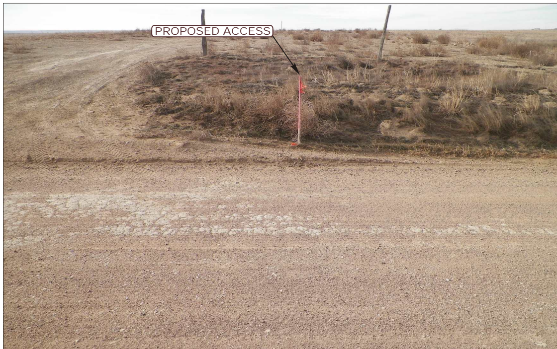
PHOTO: VIEW FROM BEGINNING OF PROPOSED ACCESS FOR RUH 6-62-11_14 NWNW PAD