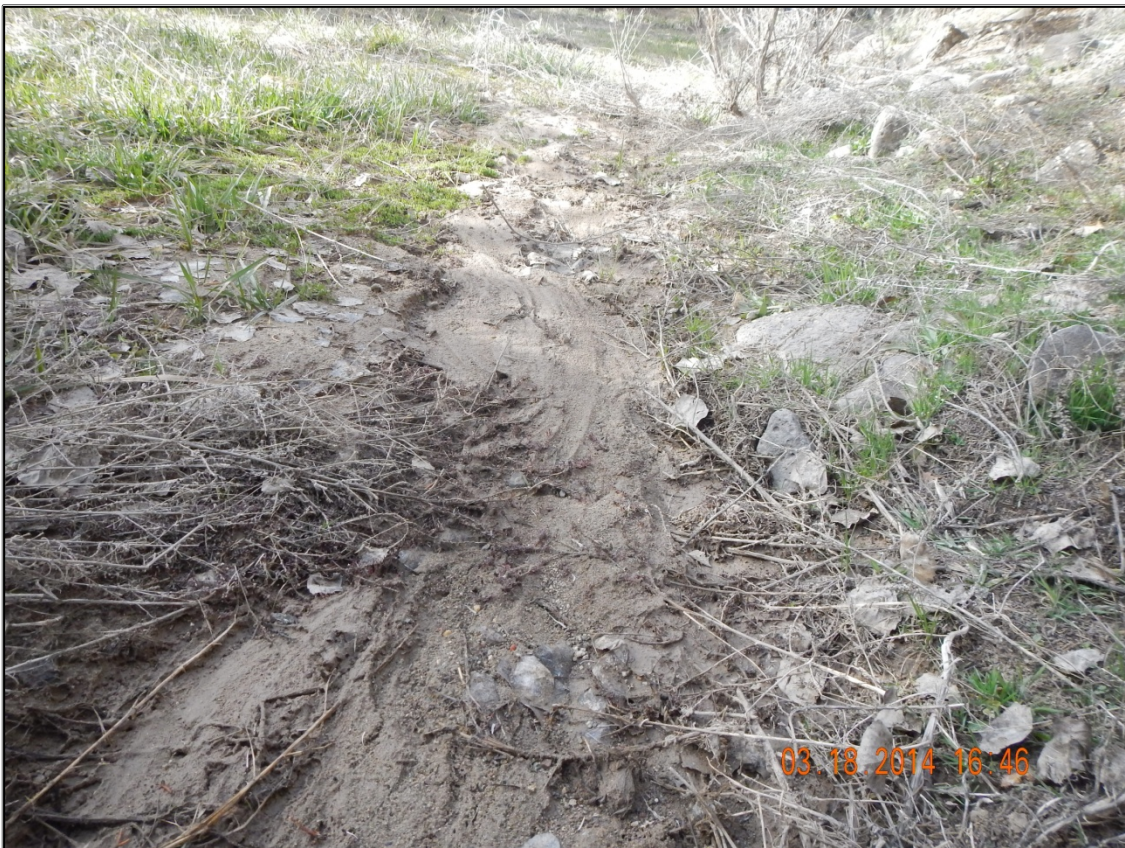
Photo 2. Drainage downstream of sampling location K3. (March 18, 2014)