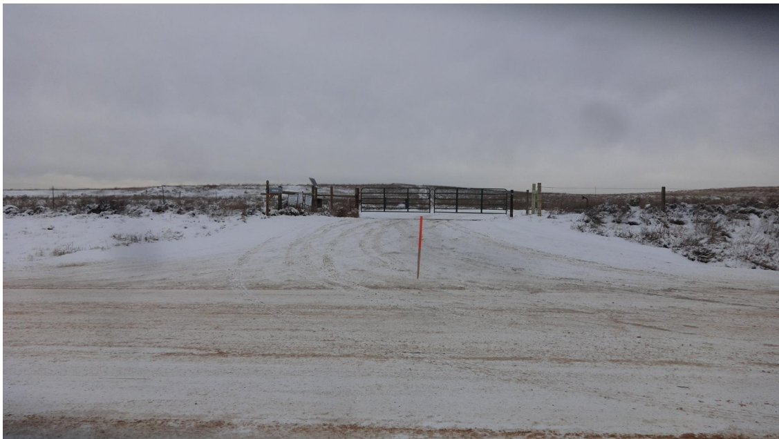
PHOTOGRAPH OF LATHAM U-14 PROPOSED ACCESS ROAD - CAMERA ANGLE EAST