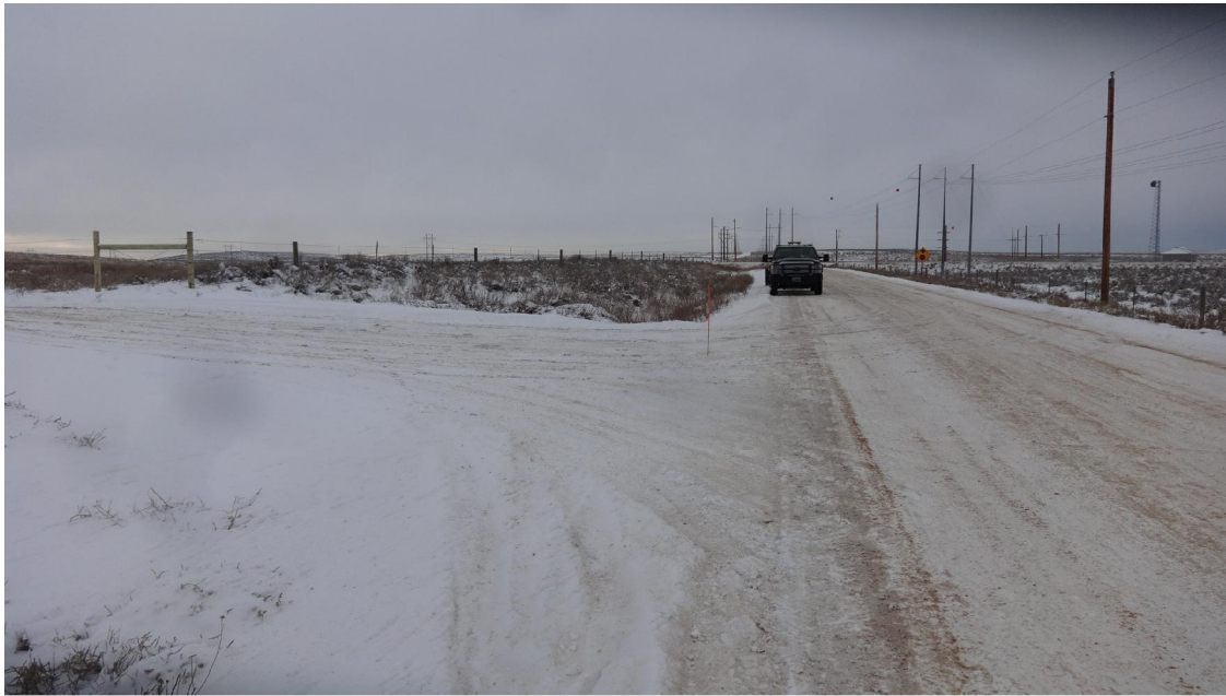
PHOTOGRAPH OF LATHAM U-14 PROPOSED ACCESS ROAD - CAMERA ANGLE SOUTH