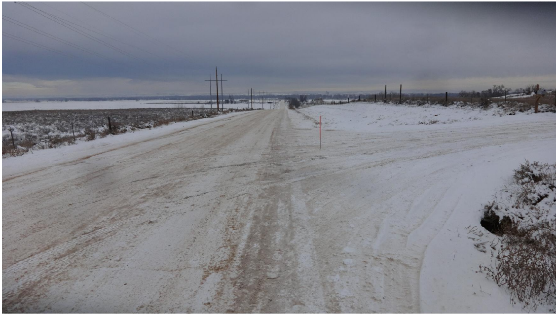
PHOTOGRAPH OF LATHAM U-14 PROPOSED ACCESS ROAD - CAMERA ANGLE NORTH