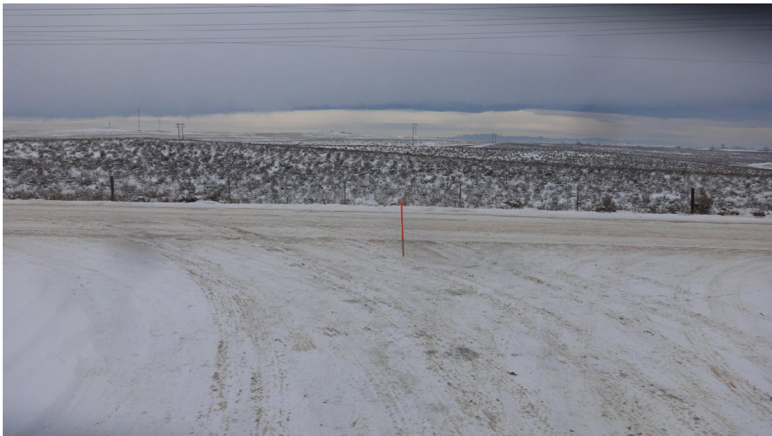
PHOTOGRAPH OF LATHAM U-14 PROPOSED ACCESS ROAD - CAMERA ANGLE WEST

PROPOSED ACCESS ROAD PHOTOGRAPHS LATHAM U-A-14HNB, LATHAM U41-A11-14HNB, LATHAM 41-11-14HNB, LATHAM V41-B11-14HNB & LATHAM V-B-14HNB LOCATED IN SECTION 14, T4N, R63W, 6TH P.M. WELD COUNTY, COLORADO