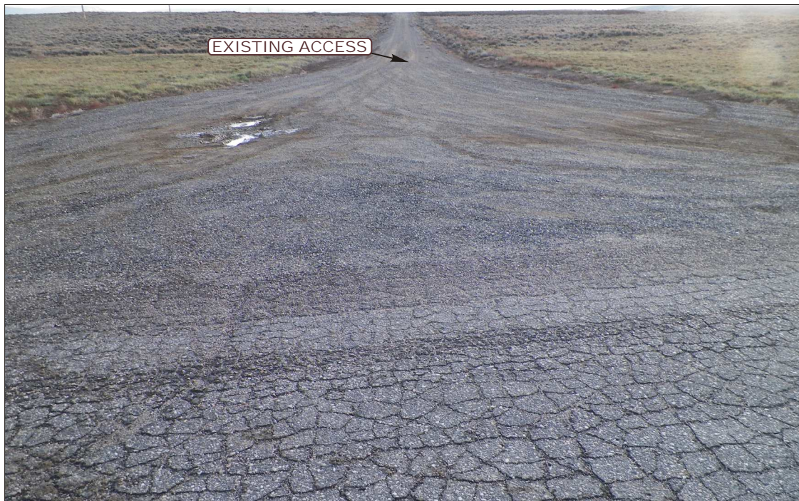
PHOTO: VIEW FROM BEGINNING OF EXISTING ACCESS