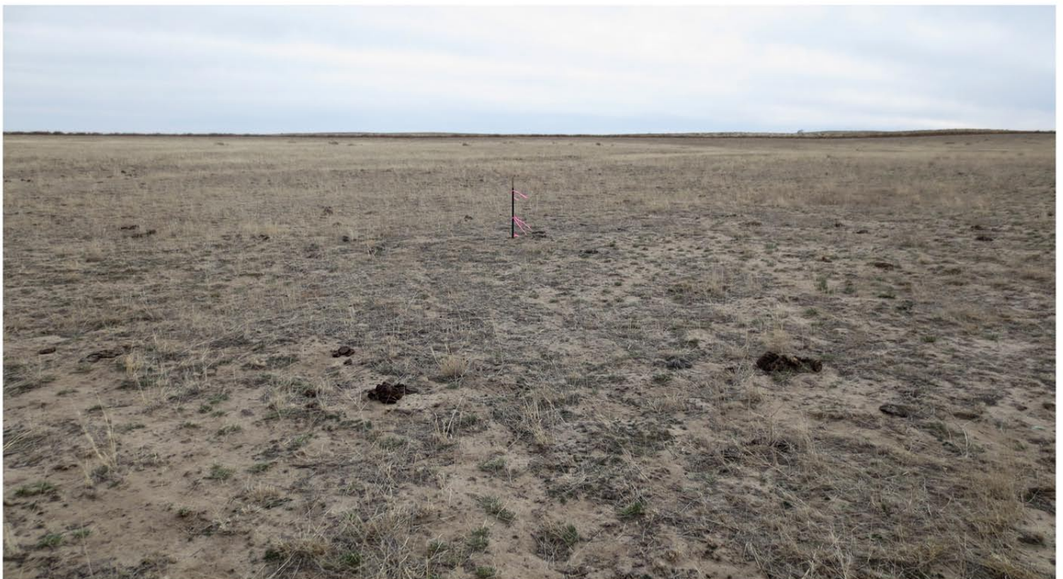
WELL PAD VIEW (LOOKING SOUTH)