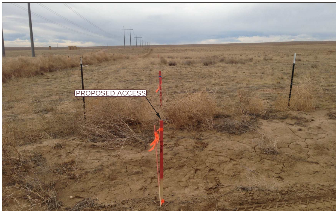
PHOTO: VIEW FROM BEGINNING OF PROPOSED FIDUCIAL 6-62-34 ROAD