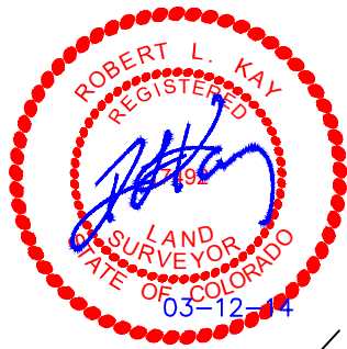
FIGURE #6 SCALE: 1" = 60' DATE: 03-10-14 DRAWN BY: M.D.