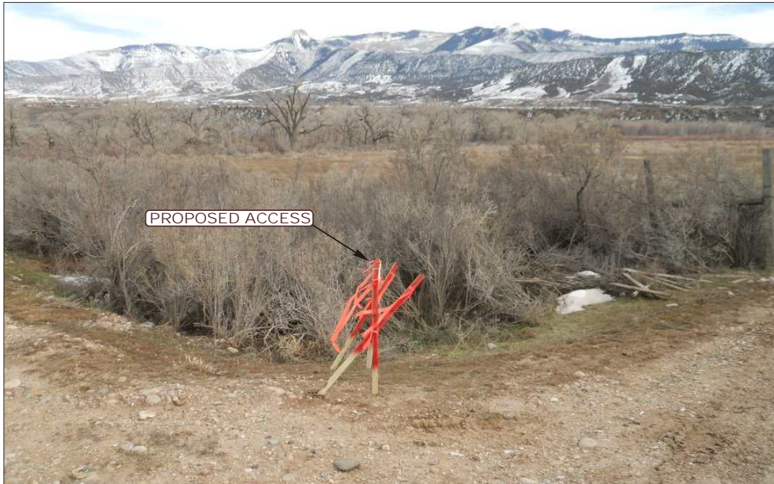
PHOTO: VIEW OF PROPOSED ACCESS