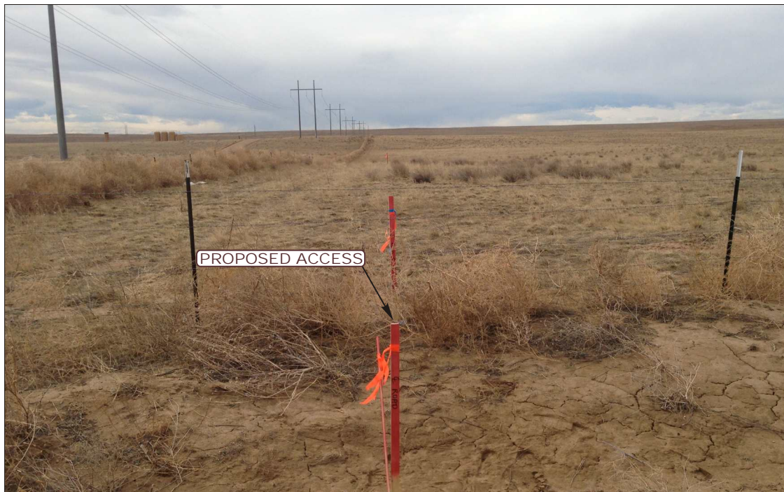
PHOTO: VIEW FROM BEGINNING OF PROPOSED FIDUCIAL 6-62-34 ROAD