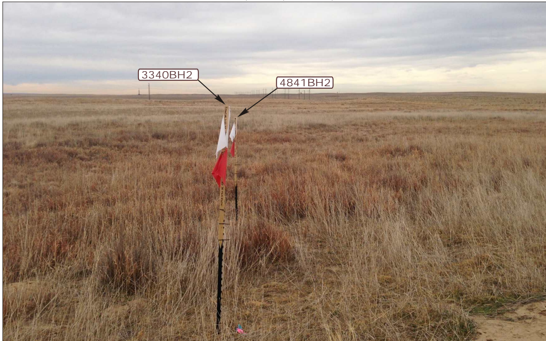
VIEW OF LOCATION STAKES